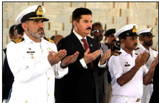
KARACHI: Governor Khyber Pakhtunkhwa, Faisal Karim Kundi along with others paying homage to Quaid-e-Azam Muhammad Ali Jinnah during his visit to Jinnah Mausoleum in Karachi.

Speaking to a news channel, CM Gandapur said that a Pakistan Tehreek-e-Insaf (PTI) leader of Karachi was 'barred' from entering Sindh House.