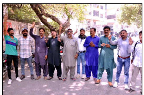
HYDERABAD: Journalists are holding protest demonstration against high handedness of police, at Hyderabad press club.