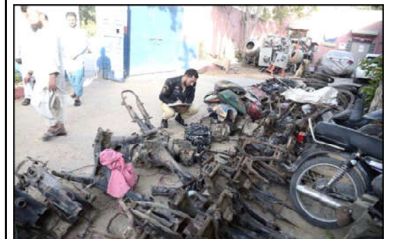
KARACHI: Police officials show recovered stolen motorcycles, who were recovered from a residential building in Azizabad area, to media persons during press conference, at Azizabad Police Station in Karachi.