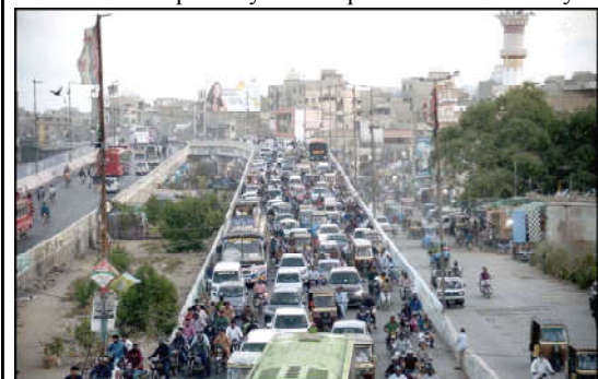
KARACHI: A large numbers of vehicles stuck in traffic jam due to negligence of traffic police staffs and illegal parking, at Liaquatabad in Karachi.