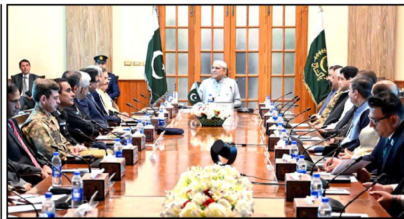
President Asif Ali Zardari being briefed about the law and order situation and the ongoing development projects in Balochistan, Quetta.