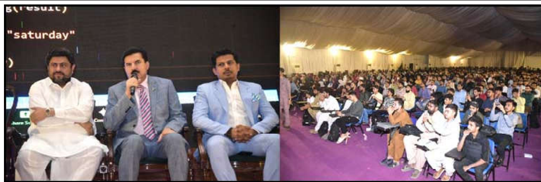
KARACHI: Governor Khyber Pakhtoonkwa Faisal Karim Kundi along with Sindh Governor Kamran Khan Tessori addressing students during visit IT Marquee at Governor House.