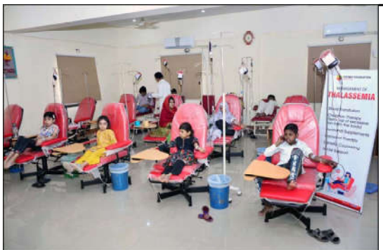
HYDERABAD: Children patients of Thalassemia being blood transfusions at Fatimid Foundation Center in connection with International Thalassemia Day.

potential for significant improvement. Khawaja Salman Rafique expressed optimism about enhancing the health insurance program. He acknowledged past challenges faced by health insurance initiatives but reaffirmed the government's commitment to addressing these issues. The minister stressed the need to rectify any shortcomings in the health insurance program and hold accountable those who exploit it for political gains. He also highlighted the importance of strengthening government hospitals' capacity and ensuring financial sustainability for the health insurance program.