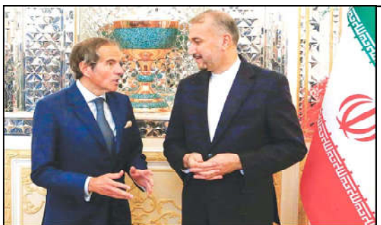
Iranian Foreign Minister Hossein Amir Abdollahian meets UN atomic watchdog chief Rafael Grossi.

pulled. "The equipment which was confiscated, the loss that we suffered from stopping our broadcast, all of that is subject matter for legal action," Nagm said. The Israeli government on Sunday said the order was initially valid for 45 days, with the possibility of an extension. Hours later, screens in Israel carrying Al Jazeera's Arabic and English channels went blank, apart from a message in Hebrew saying they had "been suspended in Israel". The shutdown does not apply to the Israeli-occupied West Bank or Gaza Strip, from which Al Jazeera still broadcasts live on Israel's fighting with Hamas. Al Jazeera immediately condemned Israel's decision as "criminal", saying on social media site X that it "violates the human right to access information".