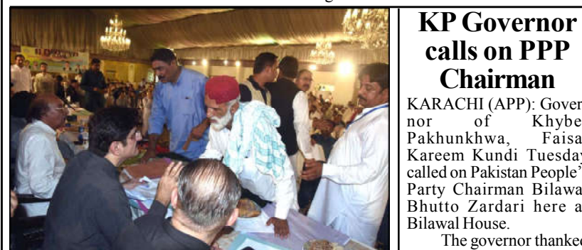
LARKANA: Sindh Chief Minister, Syed Murad Ali Shah interacts with party workers during a meeting of PPP Larkana Division held at local hall in Larkana.