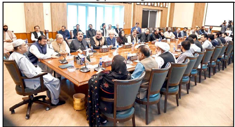
QUETTA: PPP's MPAs, office bearers and workers meeting with President Asif Ali Zardari. Chief Minister Balochistan Mir Sarfaraz Ahmed Bugti is also present.