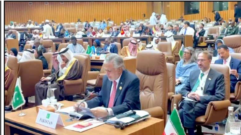
BANJUL: Deputy Prime Minister and Finance Minister Senator Muhammad Ishaq Dar addressing 15 th OIC Islamic Summit Conference.

He appreciated the OIC for its principled support for the Kashmir cause and requested the OIC member countries to use their influence for urgent resolution of Jammu and Kashmir dispute as per relevant UN Security Council and the OIC resolutions. Condemning the rising trend of Islamophobia and discrimination against Muslims in various parts of the world, the deputy prime minister and foreign minister urged the OIC to formulate a joint strategy to work with global social media platforms.