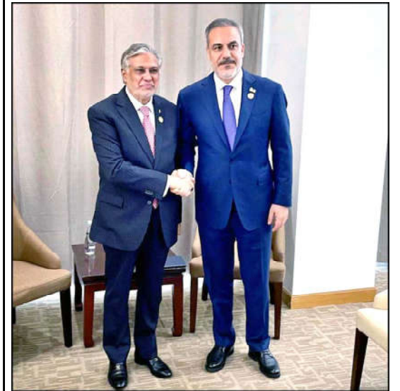
BANJUL: Deputy Prime Minister and Foreign Minister Senator Mohammad Ishaq Dar met with Turkish Foreign Minister Hakan Fidan, on the sidelines of the 15th OIC Islamic Summit Conference.

“They have actively participated in various political movements, including men, women, and even their children,” he said.