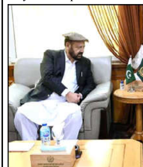
GILGIT: Chief Minister Gilgit-Baltistan Haji Gulbar Khan in a meeting with Federal Minister for Communication Abdul Aleem Khan at CM Secretariat.

Replying to a question Shazia Mari said that soon NICVD unit would also be inaugurated in Sanghar for which land had also been specified for the construction of cardio hospital because Pakistan People Party had always preferred poor and destitute people.