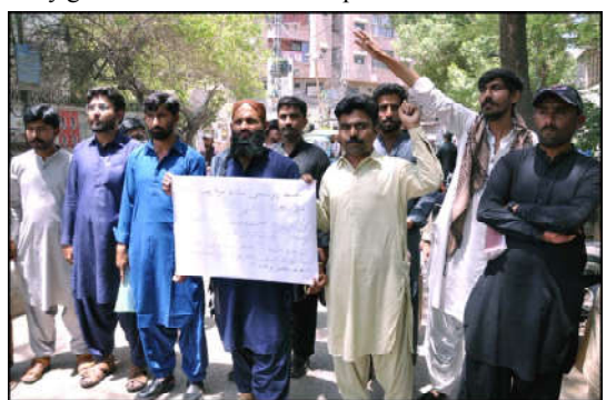
HYDERABAD: Terminated Police Officials of Sindh Police Department are holding protest demonstration for restoration of their duties, at Hyderabad press club.