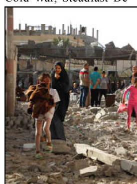
Palestinian children look up as they walk at the site of an Israeli strike on a house, amid the ongoing conflict between Israel and Hamas, in Rafah, in the southern Gaza Strip.

Relations between Russia and the West have been at their most hostile in decades following the start of Russia's military conflict in Ukraine in 2022.