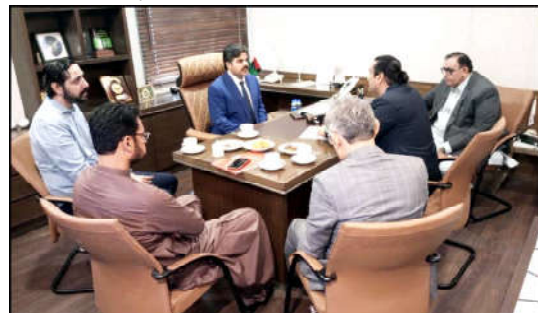
KARACHI: Sindh Minister for Energy and Planning & Development Syed Nasir Hussain Shah presides over a high-level meeting on the Sindh Coal Authority (SCA).

"The two sides reaffirmed the All-Weather Strategic Cooperative Partnership between Pakistan and China and exchanged views on deepening exchanges between the Parliament of Pakistan and the National People's Congress of China," it was added.