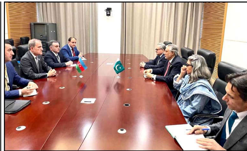
BANJUL: Deputy Prime Minister and Foreign Minister Senator Mohammad Ishaq Dar held a bilateral meeting with Foreign Minister of Republic of Azerbaijan Jeyhun Bayramov, on the sidelines of the 15th OIC Islamic Summit Conference.

Mainly, hot and dry weather is likely to prevail in the province.