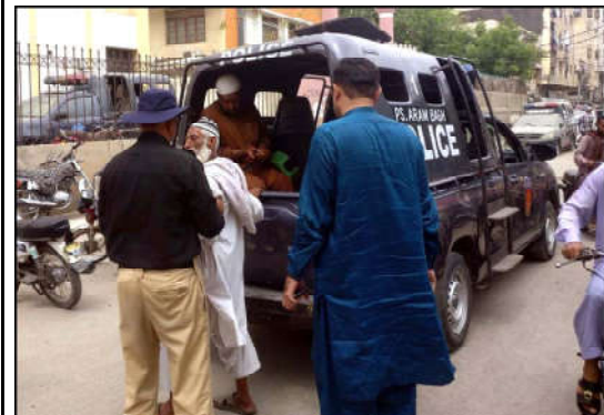
KARACHI: Police officials arrested the beggars after crackdown against beggars over the directions of the Commissioner Karachi and DC South, at Aram Bagh in Karachi.