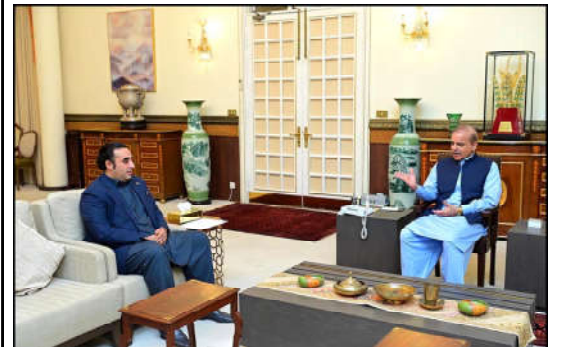
ISLAMABAD: Chairman Pakistan People's Party and MNA Bilawal Bhutto Zardari called on Prime Minister Muhammad Shehbaz Sharif.

ISLAMABAD (APP): Chairman Pakistan People's Party and MNA Bilawal Bhutto Zardari Friday called on Prime Minister Muhammad Shehbaz Sharif and discussed matters related to mutual interests. In the meeting, the two leaders also discussed the overall political situation of the country, a PM Office news release said.