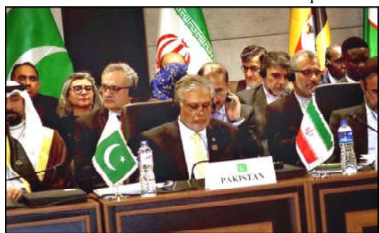
BANJUL: Deputy Prime Minister and Foreign Minister Senator Mohammad Ishaq Dar participated in the preparatory Meeting of Foreign Ministers to the Islamic Summit of the OIC.

The theme of this year's summit is "Enhancing Unity and Solidarity through Dialogue for Sustainable Development."