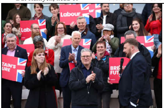
Britain's opposition Labour Party leader Keir Starmer, Shadow Deputy Prime Minister Angela Rayner and Labour Party MP for Blackpool South Chris Webb meet with activist after Labour won a Parliamentary by-election in Blackpool, Britain.

According to a statement from organizers the encampment will stay until the university discloses its investments, divests from any that "sustain Israeli apartheid, occupation and illegal settlement of Palestine" and ends partnerships with some Israeli academic institutions.