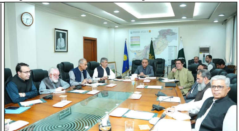
Federal Minister for Communications Abdul Aleem Khan is being briefed on the matters pertaining to Pakistan Post.

Attorney General, Mansoor Usman Awan was also present on the occasion, according to press statement issued by FBR.