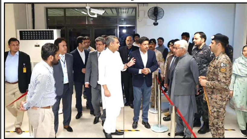
LAHORE: Federal Minister for Interior, Mohsin Naqvi and Federal Minister for Aviation and Defence, Khawaja Muhammad Asif reviewing the facilities for passengers at Allama Iqbal International Airport.

"I urge all judges presiding over my cases to expedite the hearings and refrain from unjustified delays," he said in a message from Rawalpindi's Adiala Jail. Saying that delaying the decisions was unjust, he said that all cases against him were false, baseless, and concocted. Khan referred to CJP Isa's statement, saying, "He stated that there is no pressure on him, but pressure comes to those who refuse to indulge in wrongdoing. You are behaving like [government's] B-team against PTI." "You snatched electoral symbol from PTI, denied a level playing field, and violated our fundamental human rights in the guise of the May 9 incidents.