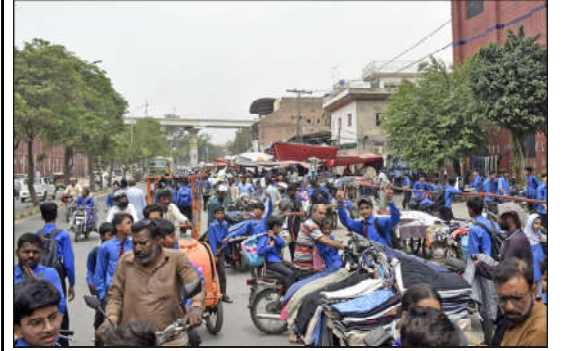
LAHORE: Students crossing a busy road after the attending their class at a local school, in the Provincial Capital, which may cause any incident any time as needs to attention for concern authority.