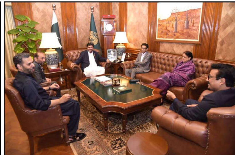
KARACHI: A delegation of MQM-P meeting with Sindh Governor Kamran Khan Tessori at governor house.

levelized at $36.70 per tonne against the Petition Tariff sought at USD 45.80 per tonne. The Board also unanimously approved revised financing terms in review Contract Stage tariff for Thar coal Block-II mine of 11.2 Mtpa capacity (Phase-III) SECMC by increasing lending spread up to 1.85 per cent over the benchmark interest rate, which was earlier allowed up to 1.5 per cent. The Board appreciated the efforts made by the Sindh government for achieving the objectives of Thar Coalfield through Block-I and Block-II and directed to expedite Phase-III of Block-II maintained by SECMC so that the objectives of Thar Coalfield could be achieved to bring down the prices of energy tariff in the country.