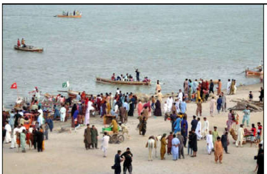
HYDERABAD: People are enjoying pleasant evening and cooling themselves during the hot weather, at River Indus in Jamshoro.

effective measures against the copy culture of Section 144. Legal action should be taken against the violators. The Deputy Commissioner says that the copy culture is no less than a pest for our education, the youth will realize in the future that they have wasted their precious time due to copying, so today the youth should abandon the trend of copying. Go ahead with hard work so that they don't have to face difficulties tomorrow because development is impossible without better education.