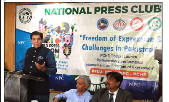
ISLAMABAD: Former Prime Minister of Pakistan Raja Pervaiz Ashraf addressing the World Press Freedom Day 2024 seminar on "Freedom of Expression & Challenges in Pakistan" at National Press Club.

Meanwhile, underscoring the importance of press freedom, Tessori said: "The press freedom is an integral part of democracy's strength. We cannot overlook the role of journalists in promoting and maintaining democratic values and continuity."