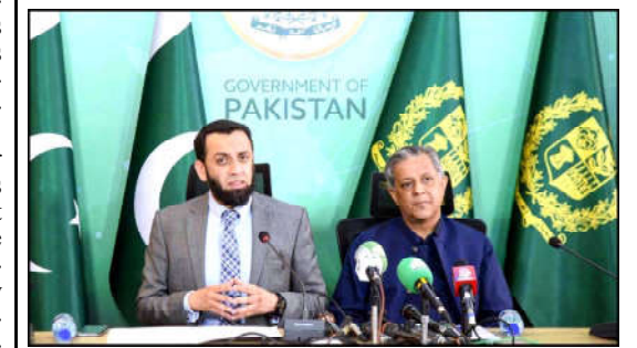
ISLAMABAD: Federal Minister for Law and Justice Senator Azam Nazeer Tarar and Federal Minister for Information and Broadcasting Attallah Tarar held an important press conference.

RAWALPINDI (APP): The Security Forces on Thursday killed three terrorists including two ring leaders during a joint intelligence-based operation (IBO) conducted in Tank District. According to the Inter Services Public Relations (ISPR), during the conduct of operation, after intense fire exchange, the three terrorists were successfully neutralized who were identified as, Terrorist Ringleader Azmat alias Azmat, Terrorist Ringleader Karamat alias Hanzla and Terrorist Rehman.