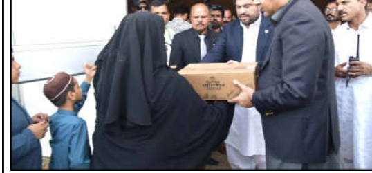
KARACHI: Federal Interior Minister Mohsin Naqvi along with Governor Sindh Kamran Khan Tessori distributing ration among deserving people.

ISLAMABAD (APP): Tremors of an earthquake were felt in various areas of Karachi, with a recorded intensity of 2.3 on the Richter scale. According to a private news channel, tremors were felt in the areas of Kathore, Gadap, and Malir in Karachi. According to the seismic center, the intensity of the earthquake was recorded at 2.3 on the Richter scale. The depth of the earthquake was 84 kilometers, and the epicenter was located 38 kilometers northeast of Malir. The tremors, which occurred at 5:52 pm, caused no reported loss of life or property.