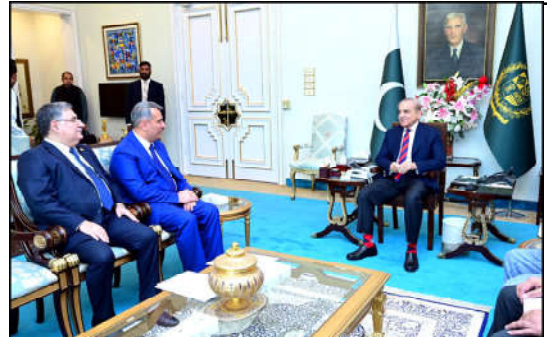
ISLAMABAD: Ambassador of the Republic of Azerbaijan, Khazar Farhadov calls on Prime Minister Muhammad Shehbaz Sharif.