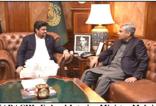
KARACHI: Federal Interior Minister Mohsin Nagyi meeting with Sindh Governor Kamran Khan Tessori at governor house.

MQM delegation assured the President of their