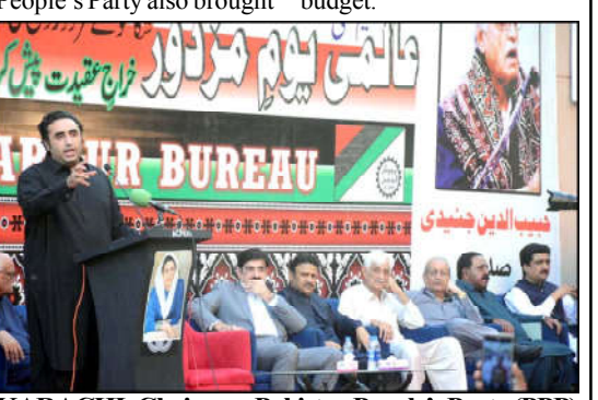
KARACHI: Chairman Pakistan People's Party (PPP) Bilawal Bhutto Zardari addressing function organized by People's Labour Bureau Sindh in connection with International Labour Day at Arts Council.

He said at present Sindh and Balochistan provinces are governed by his party and in view of rising inflation, the governments of both the provinces will increase the salaries of employees in the coming budget.