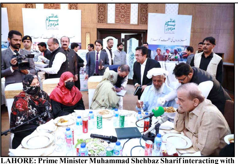
families of labourers at a luncheon he hosted in their honour on the occa-

the Sindh province at the Chief Minister House.