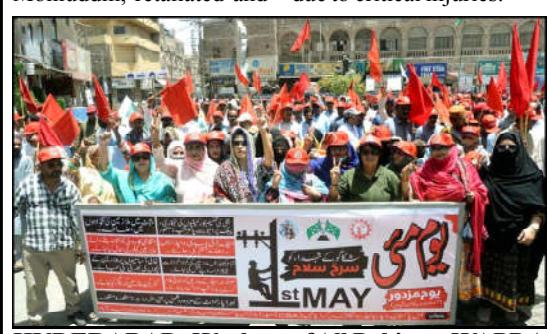
HYDERABAD: Workers of All Pakistan WAPDA Hydroelectric Workers Union hold protest on In-