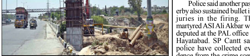
ISLAMABAD: Labourers busy in construction work of flyover at under construction 10th Avenue during development work in Federal Capital.