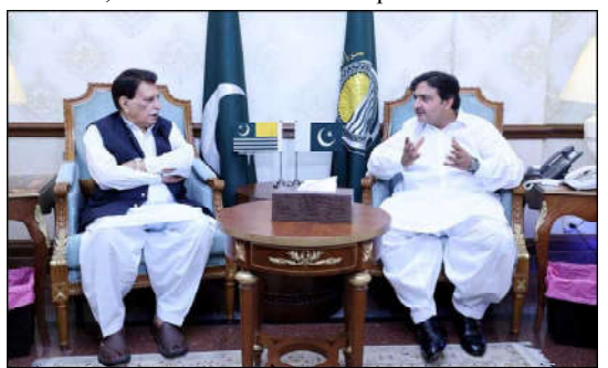
LAHORE: Former Prime Minister Azad Kashmir Raja Farooq Haider meeting with Speaker Punjab Assembly Malik Muhammad Ahmed Khan.