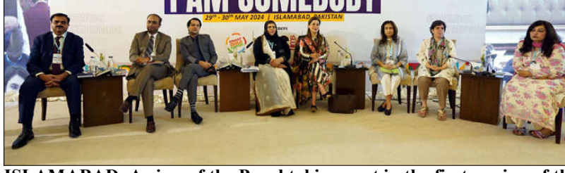
ISLAMABAD: A view of the Panel taking part in the first session of the conference titled "National Street Children Conference - I am Somebody" under the auspices of Muslim Hands and Madaan at a local hotel.

He said that Gandhara civilization also led to the early linkages between Pa-