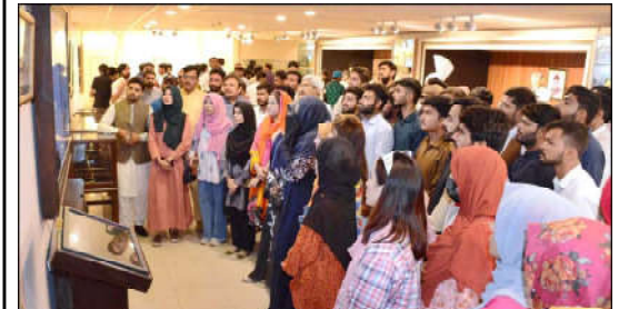
ISLAMABAD: Students of Government College University, Faisalabad visiting Senate Museum at Parliament House.

The AG presented report of police station Dhir