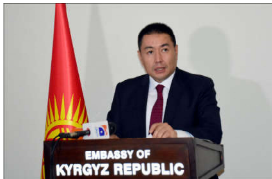
ISLAMABAD: Ambassador of the Kyrgyz Republic, Ulanbek Totuaev briefing the representatives of Media on the ongoing security situation in Bishkek, Kyrgyz Republic at the Embassy of the Kyrgyz Republic, in the Federal Capital.

The prime minister reiterated Pakistan's commitment to its pursuit of peace and justice and to building a future "where peace prevails and humanity thrives."