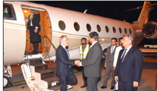
Foreign Minister of Azerbaijan Jeyhun Bayramov arrives in Islamabad. He was received at the Islamabad International Airport by Additional Foreign Secretary (Afghanistan and West Asia) Ahmed Naseem Warraich.

ISLAMABAD (APP): In a significant crackdown on smuggling, hoarding, and power pilferage, the government has made substantial progress in its zero-tolerance policy, yielding impressive results. Since September last year, the Special Investment Facilitation Council (SIFC) has been instrumental in facilitating the recovery of billions of rupees and scores of arrests, PTV reported. In a major anti-smuggling operation, authorities foiled the smuggling and illegal movement of 3,036 metric tons of fertilizer. Additionally, 281 metric tons of wheat and flour were seized from smugglers, preventing the smuggling of essential items. The government's efforts have also led to the seizure of 34,640 metric tons of sugar, putting an end to illegal profiteering. Furthermore, authorities recovered 2,503 metric tons of wheat, 56,948 metric tons of ghee, and 10,379 metric tons of sugar from market price manipulators.