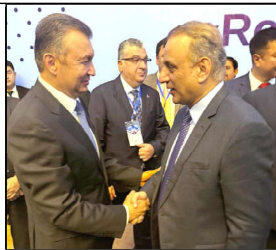
Federal Minister for Communications, Investment Board and Privatization, Abdul Aleem Khan met with Prime Minister of Tajikistan, Kokhir Rasulzoda in Dushanbe.

RAWALPINDI (APP): The Pakistan Armed Forces on Wednesday paid tribute to its martyrs who had rendered the ultimate sacrifice while serving as UN peacekeepers in conflict-hit countries across the world on the International Day of UN Peacekeepers. "Today, Pakistan joins the international community in commemorating the International Peacekeepers Day, paying tribute to the brave men and women who have served in the United Nations peacekeeping missions around the world," an Inter-Services Public Relations (ISPR) news release said. Pakistan, the ISPR said, was one of the largest contributors to the UN peacekeeping, with around 3,000 peacekeepers currently serving in missions in the Democratic Republic of Congo, South Sudan, Abyei, Central African Republic, Cyprus, Western Sahara and Somalia. It added that since 1960, Pakistan had contributed 235,000 troops to the UN peacekeeping operations in 48 United Nations missions in 29 countries including almost all continents of the world.