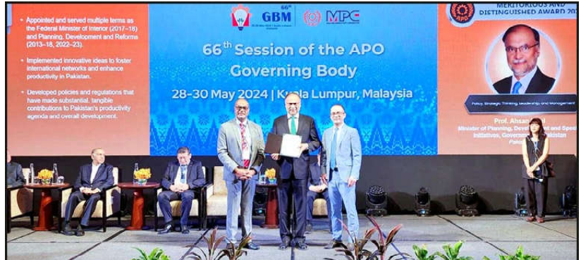
KUALALUMPUR: Planning Minister Prof. Ahsan Iqbal receiving the APO Meritorious and Distinguished Award 2024 by the Asian Productivity Organisation (APO) in Malaysia.

cultural ties and in future this relationship can be further strengthened by the promotion of trade activities. Earlier, while addressing the International Conference at Dushanbe, the federal minister said that Pakistan was ready to cooperate in all kinds of economic and business activities in the region for which practical work was being done to bring trade corridors to global standards and connect them with other countries. He said that Pakistan was working on digitizing the "Silk Route Corridor" especially for the countries of Central Asia while also ensuring the implementation of "Right to Monitor" through satellite technology on the roads under construction.