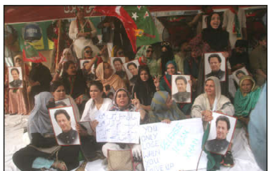
KARACHI: Pakistan Tehreek-e-Insaf activists hold a protest demonstration for the release of Imran Khan outside the Karachi Press Club.

culture sector's recovery is mainly attributed to government initiatives through improved input supply and increased credit disbursement to farmers. Large Scale Manufacturing (LSM) growth in 2024 Quarter 3, became positive and is expected to remain moderately positive on average throughout the second half of the current fiscal year. It witnessed a minor decline of 0.1 per cent during July-March FY 2024 against the contraction of 7.0 per cent same period last year. During this period, 11 to 22 sectors witnessed positive growth. The Consumer Price Index (CPI) inflation stood at 17.3 per cent on a year-on-year basis in April 2024 as compared to 36.4 per cent in April 2023. The major drivers include housing, water, electricity, gas & fuel, perishable food items, furnishing & household equipment maintenance, clothing, footwear and transport.