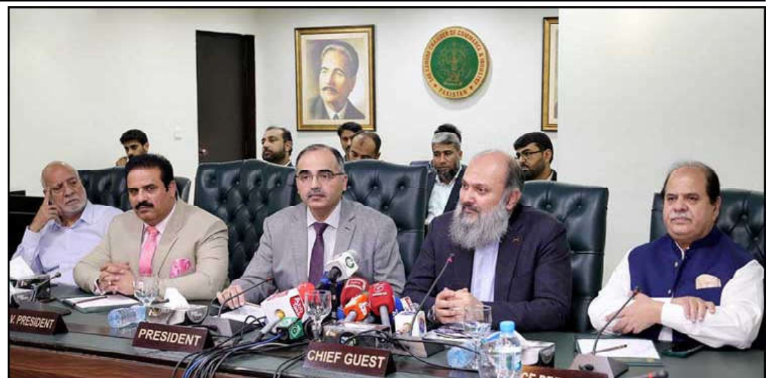
LAHORE: Federal Minister for Commerce Jam Kamal Khan addressing during his visit to Lahore Chamber of Commerce and Industry.