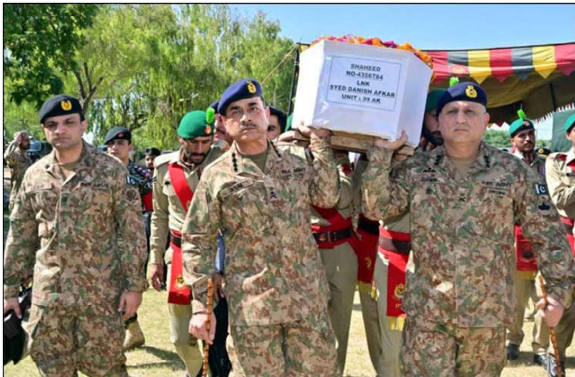
PESHAWAR: Chief of the Army Staff General Syed Asim Munir attending funeral prayers of soldiers who embraced Shahadat during an intense exchange of fire with terrorists at general area Bagh, Khyber district