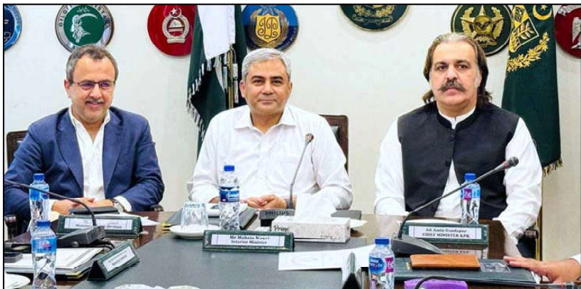
ISLAMABAD: Federal Minister for Interior Mohsin Naqvi and Federal Minister for Energy Sardar Awais Ahmad Khan Laghari in a meeting with Chief Minister Khyber Pakhtunkhwa Ali Amin Gandapur.

Federal Minister for Information, Broadcasting, National Heritage and Culture Attaullah Tarar on Monday said that a convicted person in prison could not digest and acknowledge multiple achievements of current government on diplomatic front and initiatives for the development of the country. "Definitely, there is a sinister plan to compare the current situation with that of 1971 but these tactics are doomed to fail; InshaAllah, Pakistan will remain on the map of the world and make march towards progress and prosperity," he said while addressing a press conference. He said during the tenure of the present elected government, by the grace of Allah Almighty, Pakistan had achieved many milestones on the diplomatic front. "The Prime Minister had a telephonic conversation with the Prime Ministers of Norway and Ireland in the backdrop of their strong stance on Middle East situation", he remarked. He said Prime Minister Shehbaz Sharif had telephonically contacted the prime ministers of Norway and Ireland who had condemned the ongoing atrocities in Gaza and Rafah and called for immediate for ceasefire. The minister said that PM Shehbaz Sharif informed the two Prime Ministers about Pakistan's position on the situation. "Pakistan has always raised its voice for the rights of Palestinians," he said adding PM Shehbaz Sharif during his address to UN General Assembly had stated categorically that Pakistan will continue to raise its voice for the cause of Palestinians.