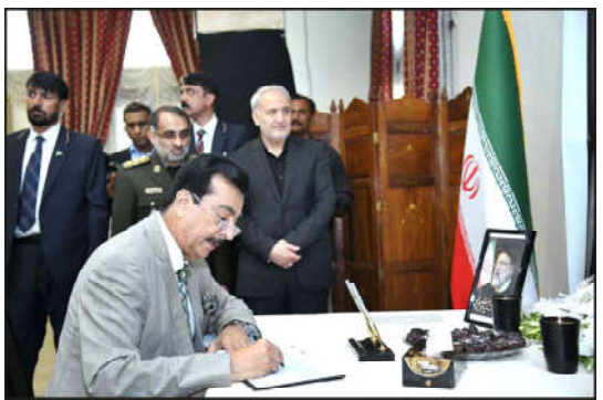
shared the grief of the Iranian brothers and sisters.

Dr Raisi, the Iranian foreign minister and others in the helicopter accident, saying that the whole nation