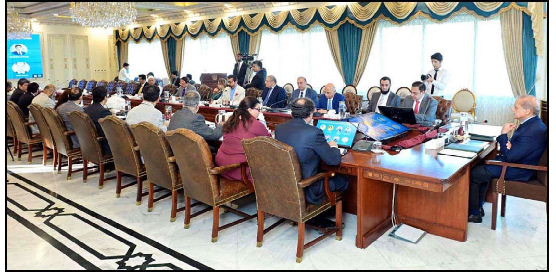
ISLAMABAD: Prime Minister Muhammad Shehbaz Sharif chairs a meeting on the matters related to Ministry of Information Technology and Telecommunications and National Information Technology Board.

the IT industry for further enhancing of harmony between the government and the IT industry. The Governor State Bank of Pakistan was directed that there should be no hurdles from the banks with regard to the debit cards and foreign currency issues of the exporters of software products. The prime minister also underlined that the Higher Education Commission, universities and the training institutes should work on priority basis to increase the number of IT professionals.