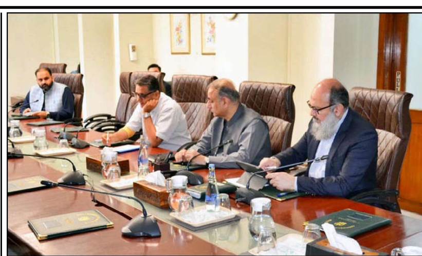
ISLAMABAD: Federal Minister for Commerce, Jam Kamal Khan and Federal Minister for Communication, Abdul Aleem Khan, jointly chairing a cabinet committee dedicated to promoting Pakistani enterprises in global markets.

ISLAMABAD (APP): Minister for Defence and Defence Production, Khawaja Muhammad Asif on Tuesday said that it was absolutely saddening that counterfeit cigarette manufacturers were members of the assemblies and watch guard their business' interests through the legislature. "Pakistan has a capacity to generate 27,000 billion rupees in terms of taxes and we will not need IMF support if we only collect half of this tax," this was stated by Defence Minister Khawaja Muhammad Asif at the research session of the research report titled 'Illicit Cigarette Trade in Pakistan - Current Situation and Way Forward', produced by the National University of Science & Technology (NUST), a news release said. "Two major cigarette manufacturers are contributing Rs170b in taxes while the share of all the other cigarette manufacturers is just 2 billion rupees," he added.