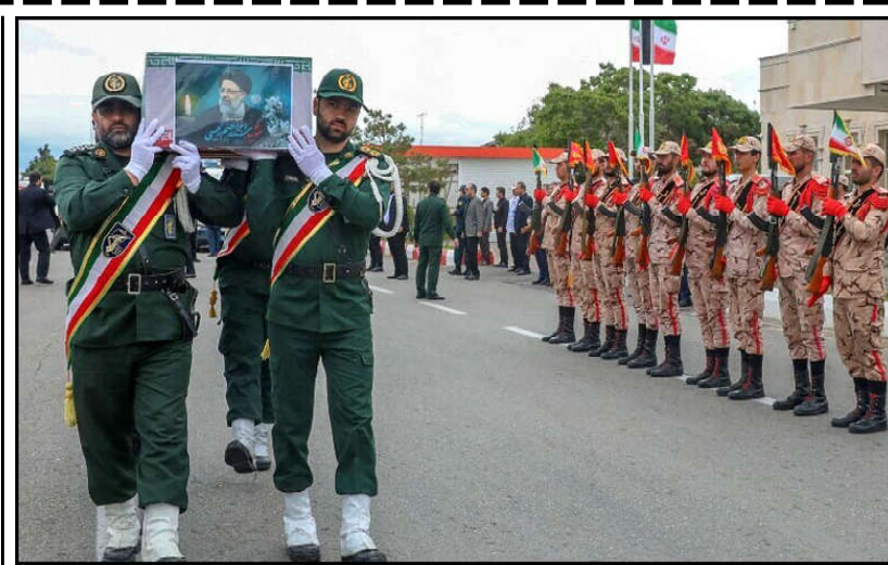
This handout picture provided by the Iranian president's office shows honour guards carrying the coffin of late president Ebrahim Raisi during a funeral procession in Tabriz, the capital of Iran's East Azerbaijan province.

killed by a US missile in 2020 in Iraq, whose funeral drew huge crowds of mourners, weeping with sorrow and rage. The helicopter lost communications while it was on its way back to Tabriz after Raisi attended the inauguration of a joint dam project on the Aras River, which forms part of the border with Azerbaijan, in a ceremony with his counterpart Ilham Aliyev. A massive search and rescue operation was launched on Sunday when two other helicopters flying alongside Raisi's lost contact with his aircraft in bad weather. State television announced his death in a report early on Monday, saying "the servant of the Iranian nation, Ayatollah Ebrahim Raisi, has achieved the highest level of martyrdom".