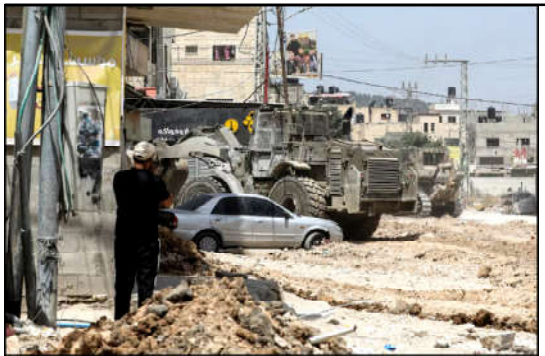
A man stands as Israeli military machineries operate in Jenin, in the Israeli-occupied West Bank.

and ceasefire. Some US lawmakers called for the United States to impose sanctions on the court. In 2020, the United States imposed sanctions on an ICC prosecutor. "In general, the situation is more than curious in terms of the US attitude and willingness to use sanctions methods even against the ICC," Kremlin Spokesman Dmitry Peskov told reporters. In March last year, the ICC issued warrants for the arrest of President Vladimir Putin on war crimes charges. Russia says the warrant against Putin is a meaningless attempt by the West to soil Russia's reputation and denies war crimes in Ukraine. Ukraine says Russia committed war crimes. Russia says the West has ignored Ukraine's crimes, a charge denied by Kyiv.