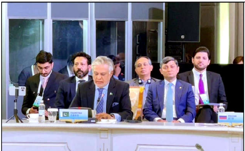
ASTANA: Deputy Prime Minister and Foreign Minister Senator Mohammad Ishaq Dar addressed the SCO Council of Foreign Ministers (CFM) meeting.