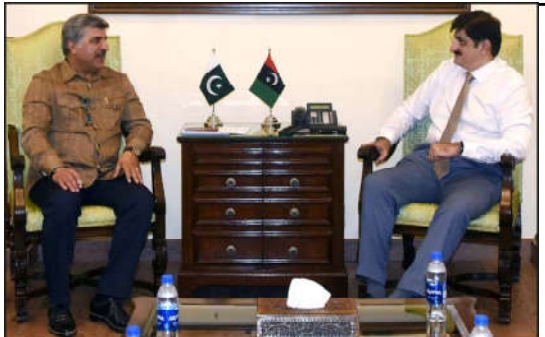
KARACHI: Sindh Chief Minister, Syed Murad Ali Shah exchanges views with Deputy Speaker National Assembly, Syed Ghulam Mustafa Shah during meeting held at CM House in Karachi.