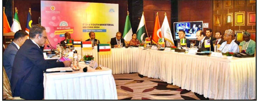
DHAKA: Rana Mashhood Ahmad Khan, Chairman Pakistan Prime Minister's Youth Programme delivering statement during 1st D-8 Youth Ministerial Meeting being held in Dhaka.