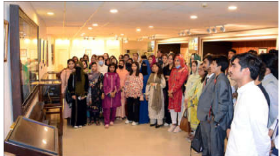
Students of Political Science Department from Islamic International University, Islamabad visiting senate museum at Parliament House, Islamabad