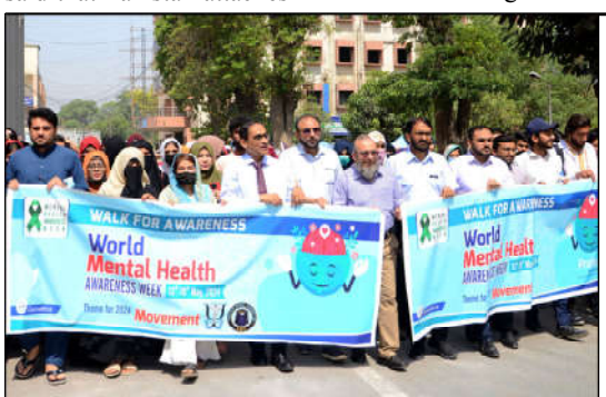
FAISALABAD: Participants hold a banner during awareness walk on the eve of World Mental Health at Allied Hospital in the city.

The court ordered to submit report regarding restoration of 7 sports complex of LDA and cutting of tree.