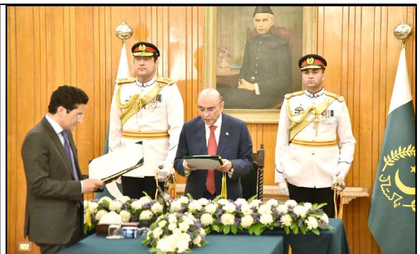
President Asif Ali Zardari administering the oath of office to Mr. Ali Pervaiz as the Minister of State, during an oath-taking ceremony, held at Aiwan-e-Sadr.

He said the Constitution and laws related to freedom of speech and contempt of court were clear and there was no ambiguity in this regard. The politician held a conference, instead he could have expressed these views in the parliament, he added.