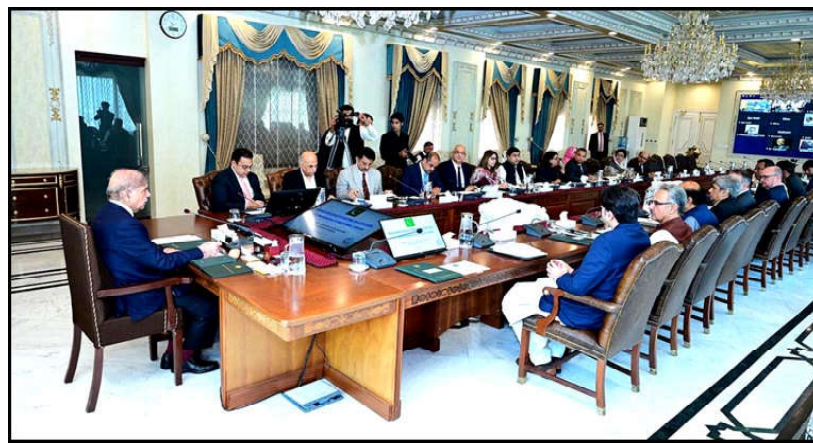
ISLAMABAD: Prime Minister Muhammad Shehbaz Sharif chairs a meeting to discuss the issue of child stunting.