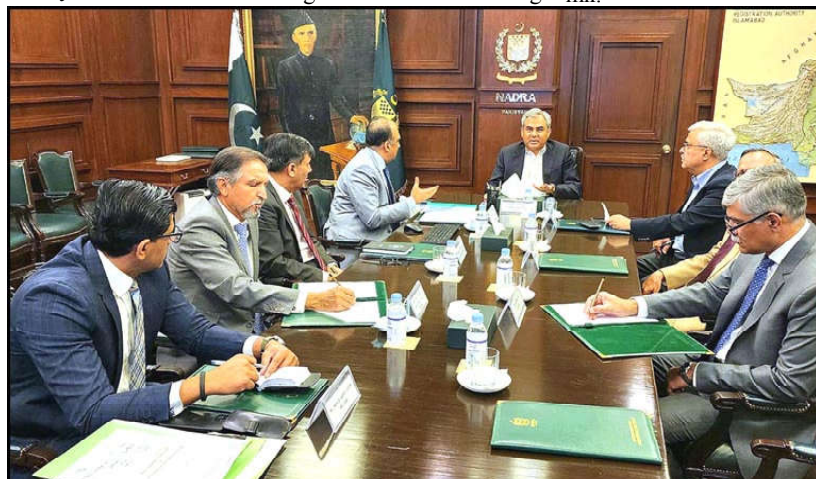
ISLAMABAD: Federal Minister for Interior Mohsin Naqvi chairing a meeting at NADRA headquarters.

Late last month, Chief Minister Maryam Nawaz had caused quite a stir when she attended a passing-out ceremony for women constables and traffic assistants decked out in a Punjab police uniform. Addressing the gradu-