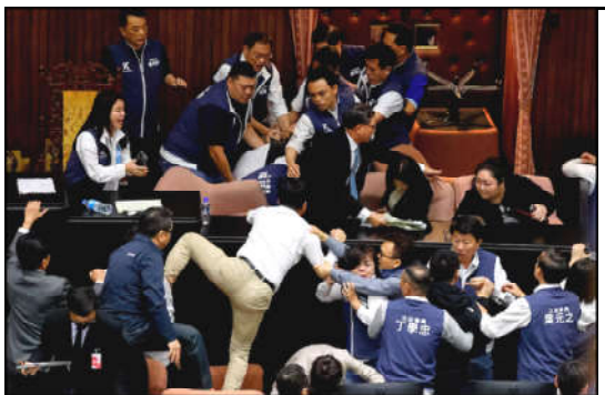
Taiwan lawmakers argue and exchange blows during a parliamentary session in Taipei, Taiwan.

set a refinery ablaze. Speaking to reporters Friday on a visit to Harbin, China, Putin said that Moscow launched attacks in the Kharkiv region in response to the Ukrainian shelling of Russia's Belgorod region.