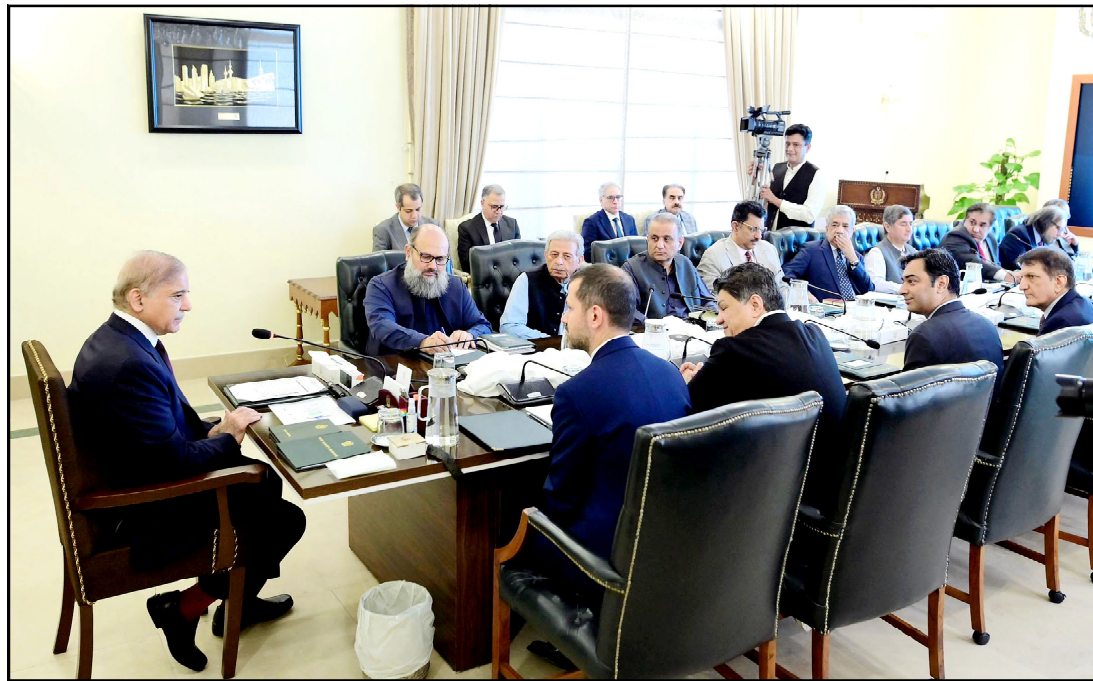
ISLAMABAD: A delegation of international beverages manufacturing companies met Prime Minister Shehbaz Sharif

Vol. XIV No. 116 Reg. mails-B / ID-445 Saturday May 18, 2024, Zeeqad 09, 1445 A.H. Ph: 2158688, 2158997 Pages 4: Rs. 12