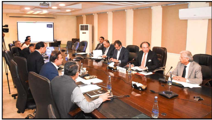
ISLAMABAD: Federal Minister for Finance and Revenue Senator Muhammad Aurangzeb chaired the meeting of Economic Coordination Committee.

While deliberating upon the contours for the formation of the strategic plan, Committee members unanimously decided to make a strategic plan led by parliamentarians. Speaking on the forum, Member National Assembly (MNA) Syed Naveed Qamar said that social media has gained undeniable importance in their age of social media and developing an independent proactive social media.