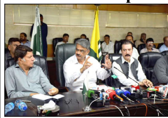
MUZAFFARABAD (APP): Azad Jammu and Kashmir (AJK) Prime Minister Anwar-ul-Haq while paying tribute to Prime Minister Shehbaz Sharif's swift response to the demands of protesters has categorically denounced the malicious propaganda that AJK was being turned