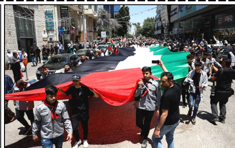
Palestinians hold Palestinian flags as they take part in a protest to mark the 76th anniversary of the Nakba, the "catastrophe" of their mass dispossession in the 1948 war surrounding Israel's creation, in Ramallah, in the Israeli-occupied West Bank.

have triggered a humanitarian crisis in Gaza, with the UN repeatedly lamenting aid restrictions as famine stalks the north. Since Israeli troops moved into eastern Rafah, the aid crossing point from Egypt has remained closed and the nearby Kerem Shalom crossing lacks "safe and logistically viable access", a UN report said late Monday. Qatar, which has been mediating peace talks, said Gazans "have not received any aid" since May 9. Israeli police on Tuesday said they had opened an investigation after right-wing activists stopped and ransacked at least seven Gaza-bound aid trucks coming from Jordan, leaving food spilt on the road.