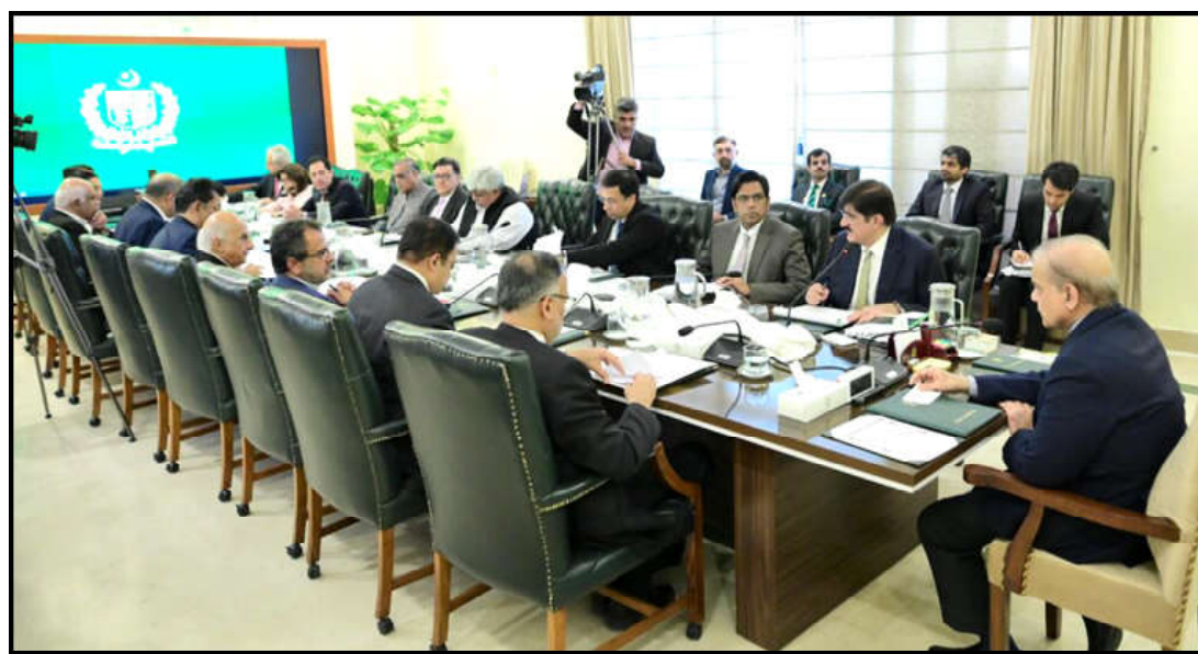
ISLAMABAD: Chief Minister Sindh Syed Murad Ali Shah calls on Prime Minister Muhammad Shehbaz Sharif.

About nine key thematic sessions under the topic of 5Es Framework would gather expert feedback and prepare a comprehensive plan of action to attain sustainable economic development and social prosperity.