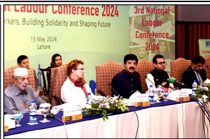
LAHORE: Governor Punjab, Sardar Saleem Haider Khan addresses during the 3rd National Labour Conference held in Lahore.