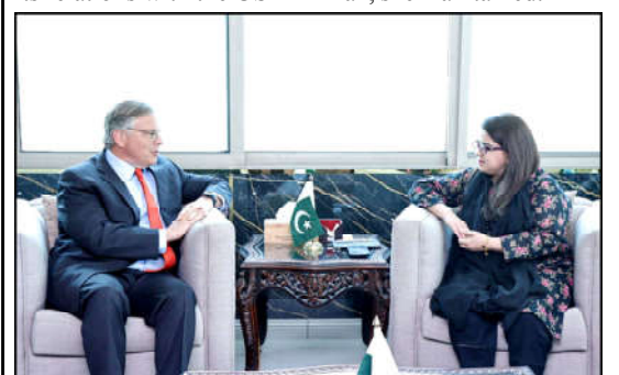
ISLAMABAD: US Ambassador to Pakistan Mr. Donald Blome calls on Minister of State for IT and Telecommunication Ms. Shaza Fatima Khawaja.

The minister of State for IT said that the present government is focusing on digitalisation in the country. Economy, governance and society are being digitalised under the Prime Minister's National Digitalisation Plan, she maintained.