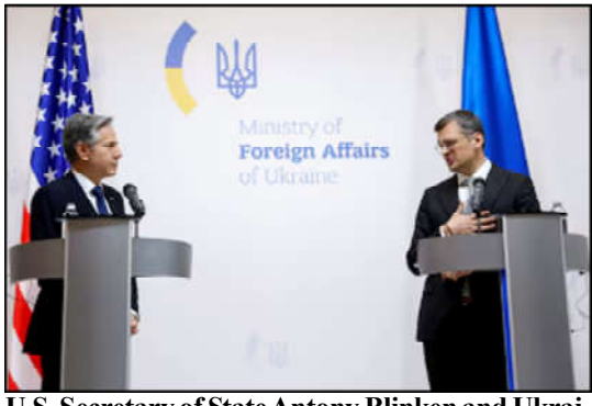
U.S. Secretary of State Antony Blinken and Ukrainian Foreign Minister Dmytro Kuleba hold a joint press conference, amid Russia's attack on Ukraine, in Kyiv, Ukraine.

estinian group. "There is no clarity how to stop the war from the Israeli side. I don't think that they are considering this as an option... even when we are talking about the deal and leading to a potential ceasefire," Sheikh Mohammed said. Israeli politicians were indicating "by their statements that they will remain there, they will continue the war." And there is no clarity on what Gaza will look like after this", he added. Israel continued to fight Hamas in Rafah on Monday, despite US warnings against a full-scale assault on the south Gaza city that is crowded with displaced Palestinians. A senior US official said negotiations were "at a simmer, but are at a low boil", but that conversations with the parties were continuing.