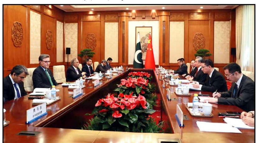
A view of 5th round of China-Pakistan Strategic Dialogue, co-chaired by Deputy Prime Minister and Foreign Minister Ishaq Dar and Chinese Foreign Minister Wang Yi in Beijing.