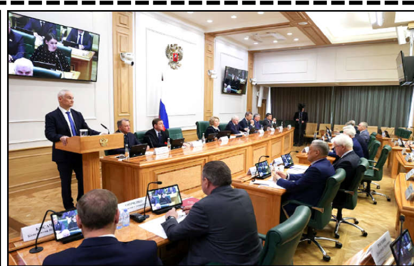
Nominee for the post of Russia's Defence Minister Andrei Belousov attends a hearing held by the defence and security committee of the parliament's upper house Federation Council as part of a confirmation process for a new government line-up, in Moscow, Russia.

Ankara on Friday welcomed the United Nations General Assembly's backing for a Palestinian bid to become a full UN member. Erdogan on Sunday called on countries not recognising a Palestinian sovereign state to do so after the vote, but slammed Washington and others who voted against.