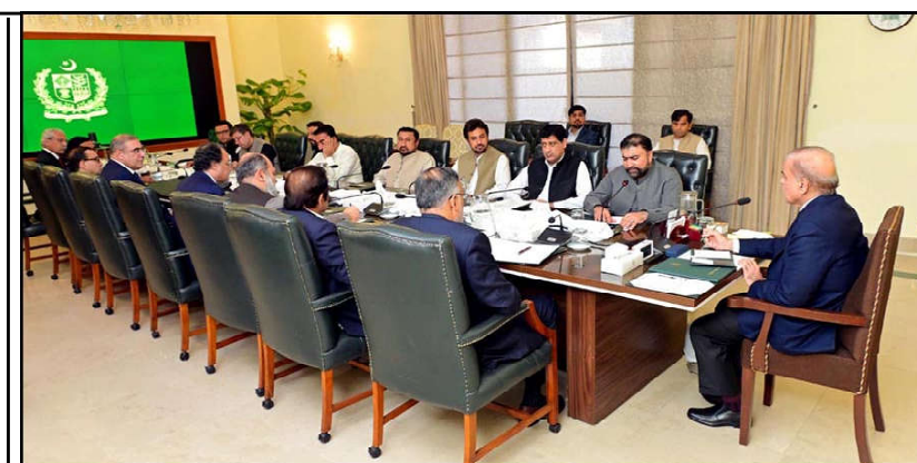
ISLAMABAD: Prime Minister Muhammad Shehbaz Sharif chairs a meeting on the matters related to Balochistan province.

It is pertinent to mention here that the premier has posted his resignation as party president to the PML-N Secretary General.