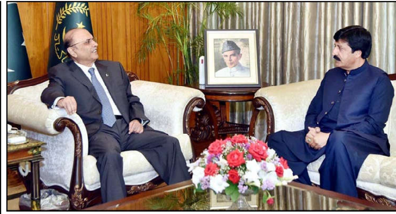
ISLAMABAD: Governor Punjab Sardar Saleem Haider Khan called on President Asif Ali Zardari at Aiwan-e-Sadr.

this regard, Prime Minister Shehbaz said that he would instruct relevant cabinet members to coordinate with the Korean side to discuss existing investments by Korean companies as well as to explore new opportunities. He also extended an invitation to President Yoon Suk Yeol to undertake an official visit to Pakistan. The Korean ambassador thanked the prime minister for receiving him and conveyed the desire of the Korean government to enhance its bilateral cooperation with Pakistan in a number of areas of mutual interest, particularly trade, investment, IT, culture, tourism and people to people exchanges.