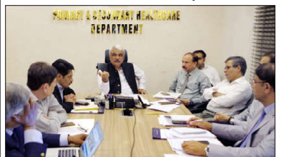
LAHORE: Provincial Minister for Health Khawaja Salman Rafique presides over the 2nd meeting of Health Insurance working group Sub Committee.

LAHORE (APP): The Sui Northern Gas Pipelines Limited (SNGPL) disconnected 718 connections during its on going crackdown against gas pilferers in Punjab, Khyber Pakhtunkhwa and Islamabad, imposing Rs 24 million fine. According to a spokesman for the SNGPL, in Lahore and Sheikhupura, regional teams disconnected 549 connections on illegal use of gas and imposed a fine of Rs 19.6 million against gas pilferers and also lodged 21 FIRs. In Multan and Bahawalpur, 139 connections were disconnected on illegal use besides imposing Rs 3 million fine.