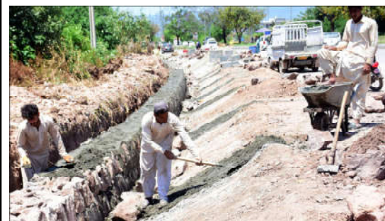
ISLAMABAD: Labourers working on sewage water project on Chak Shahzad road in the Federal Capital.

lighted The Kingdom of Saudi Arabia Project For Utilization of Hady & Adahi as the official authority for selling and marketing Hady, Adahi, alms, and charity bonds on behalf of pilgrims. These services can be accessed or tracked through the project's official website (adahi.org), electronic platforms like the Ehsan platform, or certified outlets, it said, adding that additionally, a unified inquiry and order tracking number (920020193) had been established for convenience. Urging compliance with Hajj regulations, the Directorate called upon citizens and residents to report any violations by dialing (911) in Makkah, Riyadh, and the Eastern Provinces, and (999) in all other regions of the Kingdom.