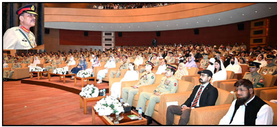
RAWALPINDI: Chief of Army Staff (COAS), General Syed Asim Munir, NI (M), addressing GHQ Investiture ceremony held at General Headquarters Rawalpindi.

A large number of senior Army officers and families of awardees attended the ceremony. The officers & soldiers were awarded medals including Sitara-I-Imtiaz (Military) and Tamgha-I-Basalat. Medals of Shuhada were received by their family members, an Inter Services Public Relations (ISPR) news release said.