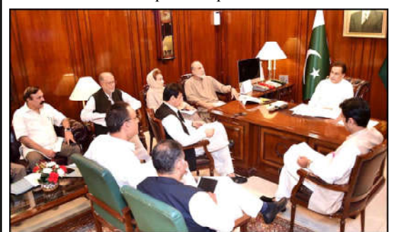
ISLAMABAD: Speaker National Assembly Sardar Ayaz Sadiq presiding the meeting to discuss matters related to present and upcoming Budget Session of National Assembly at Parliament House.

He also assured to extend full cooperation on behalf of National Assembly Secretariat for proper and smooth functioning of Special Committee.