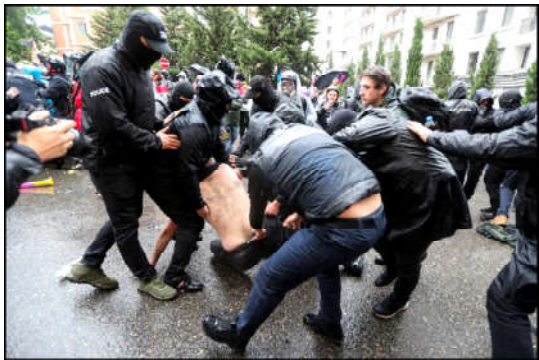
Police officers detain a demonstrator during a protest against a bill on "foreign agents" in Tbilisi, Georgia.