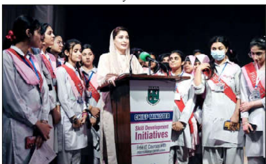
LAHORE: Punjab Chief Minister Maryam Nawaz Sharif along with students addressing the inaugural ceremony of Chief Minister Skills Development Initiative.

While issuing policy directives about new ADP, the CM directed the high ups of these departments to give top priority to the ongoing schemes specially those which are due for completion in the allocation of developmental funds.