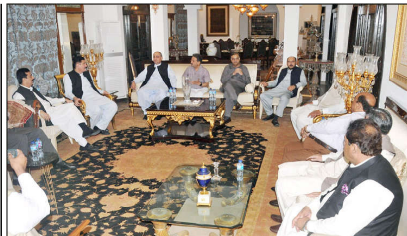
MULTAN: Chairman Senate Syed Yusuf Raza Gilani honored Governor Khyber Pakhtunkhwa Faisal Karim Kundi with a high tea at Gilani House.

The CM was briefed that the work on repair and rehabilitation of 590 roads covering a distance of 11500 kilometers across Punjab has been started.