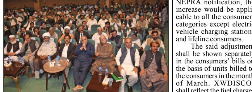
ISLAMABAD: Participants attending a seminar titled "Tahafuz e Ain e Pakistan kesy aur kiun" under the auspices of Tehreek Tahafuz Pakistan in the Federal Capital.

Responding to a question about the potential for dialogue with PTI, he said, "We are open to dialogue, but certain conditions must be to make it productive."