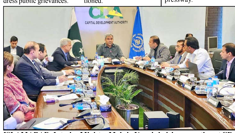
ISLAMABAD: Interior Minister Moshin Naqvi chairing a meeting at CDA Headquarters.

ISLAMABAD (APP): Metropolitan Corporation Islamabad (MCI) will set up six cattle markets for sacrificial animals to facilitate the buyers ahead of Eid-ul-Azha. "Three each cattle market will be set for big and small animals at various locations in the federal capital," an official in the MCI told APP. About the sites for the cattle markets, he said the authority will establish cattle markets for big animals in Sangiani, I-15 and I-12 while for small animals Bhara Kahu, Lehrar Road near Sultana Foundation and Zia Masjid along Expressway.