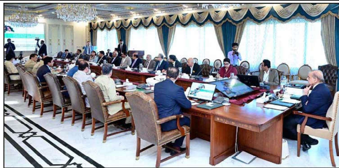
ISLAMABAD: Prime Minister Muhammad Shehbaz Sharif chairs a sectoral briefing regarding NAVTC and Ministry of Overseas Pakistanis and Human Resource Development.