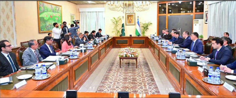
ISLAMABAD: Deputy Prime Minister and Foreign Minister Senator Mohammad Ishaq Dar and Foreign Minister of the Republic of Uzbekistan Bakhtiyor Saidov held delegation level talks at Ministry of Foreign Affairs.