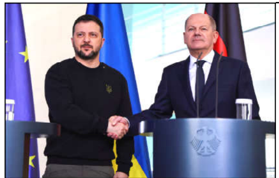
German Chancellor Olaf Scholz and Ukraine's President Volodymyr Zelenskyy shake hands at a press conference in Berlin, Germany.

Monitoring Desk KYIV: Russian forces unleashed a nighttime barrage of more than 50 cruise missiles and explosive drones at Ukraine's power grid Wednesday, targeting a wide area in what President Volodymyr Zelenskyy called a "massive" attack on the day the country celebrates the defeat of Nazism in World War II. The bombardment blasted targets in seven Ukrainian regions, including the Kyiv area and parts of the south and west, damaging homes and the country's rail network, authorities said. Three people, including an 8-year-old girl, were injured, according to officials. Russia has repeatedly pounded Ukraine's energy infrastructure during the war that is stretching into its third year and has claimed thousands of lives. By taking out the power, the