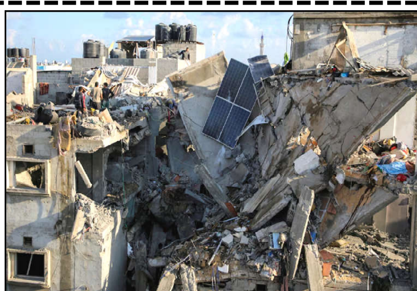
Palestinians inspect the site of an Israeli strike on a house in Rafah, in the southern Gaza Strip.

rogance" on the part of the United States and its allies. Russia's chief (of more than 24 years) promised 'victory' and said all Russians were now "answerable to our thousand-year history and our ancestors." He departed from the ceremony to the music "Hail" from Mikhail Glinka's opera "A Life for the Tsar". The words "Hail, hail, my Rus! Hail you are my Russian land" rang out in the Kremlin. The original words are "Hail, hail, our Russian tsar!". "The authority of our president is higher than ever, higher than the American president, higher even than the Russian tsar. So much depends on our president" said Gennady Zyuganov (a leader of the Communist Party).