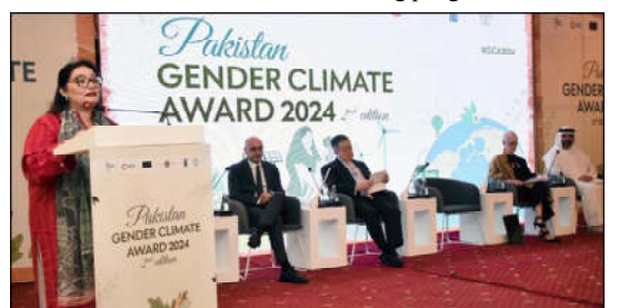
ISLAMABAD: PM's Coordinator on Climate Change & Environmental Coordination Romina Khurshid Alam addresses Pakistan Gender Climate Award 2024 ceremony.

ISLAMABAD (APP): The United States Agency for International Development (USAID) on Wednesday gathered government officials, local and international partners, and communities from Khyber Pakhtunkhwa (KP) Buner and Upper Dir districts to celebrate the conclusion of $10 million Human Development Activity. Over four years, the project empowered local communities and organizations to achieve sustainable development outcomes in health and education. Through collaboration with the KP government, the project provided grants to Pakistani organizations to implement education and health interventions, including operating accelerated learning program centers and restructured and strengthened the Primary Care Health Committee to include women members. The event underscored the instrumental support of the KP provincial departments of Education, Health, and Population Welfare. These departments contributed to the interventions' design, implementation, and oversight, fostering a deeper understanding of government priorities among local partners, addressing implementation challenges, and promoting the integration of health and education services. The government officials expressed gratitude to USAID, the implementing partner Palladium, and the local organizations. They affirmed their commitment to leveraging the insights and experiences gained from the project, including their continued support to over 1,000 out-of-school girl students enrolled in 34 accelerated learning program centers.