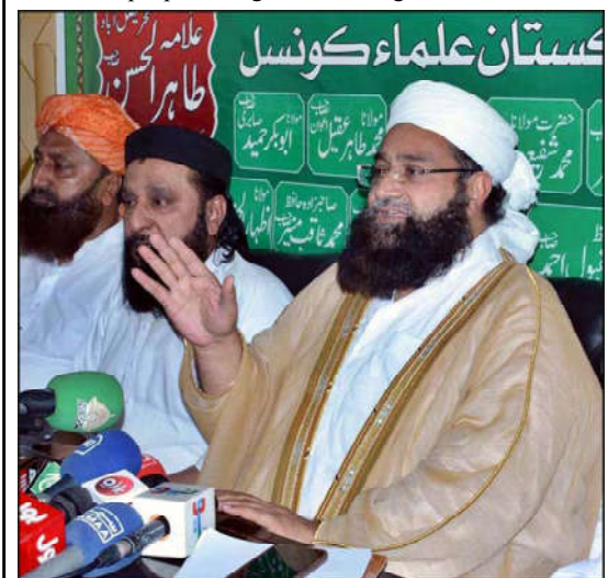
FAISALABAD: Chairman Ulema Council Hafiz Muhammad Tahir Mehmood Ashrafi addressing a press conference.

previous government's tenure. "It is our duty to safeguard people's money and we cannot permit its loss. We want to establish state-of-the-art health facilities for people in every district. We will provide high quality treatment facilities to the common man." The proposal to establish a medical college with the help of public-private partnership in Attock, Mianwali, Vehari, Bhakkar and Jhelum was reviewed. A comprehensive briefing was given on the construction, rehabilitation of hospitals: 'Clinic on Wheels', free medicines and other matters, along with undertaking health reforms and other affairs were reviewed during the meeting.