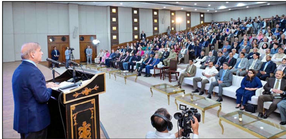
ISLAMABAD: Prime Minister Muhammad Shehbaz Sharif addresses the National Conference on Education Emergency.

He assured that all possible measures would be taken to avoid desecration of martyrs' monuments.