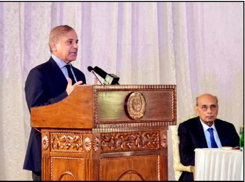
Prime Minister Muhammad Shehbaz Sharif addresses a banquet organized in honor of the delegation of businessmen and investors led by the Saudi Deputy Investment Minister Ibrahim Al-Mubarak, in Islamabad

this month ISLAMABAD (INP) Saudi Crown Prince