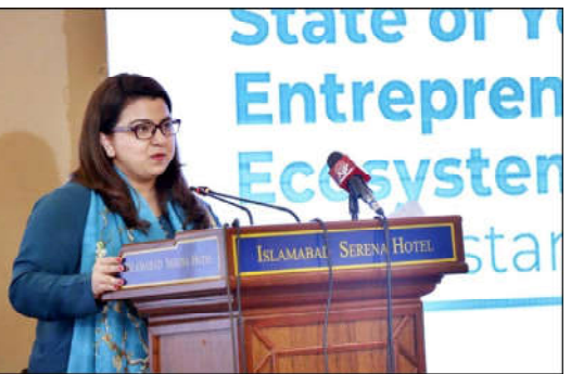
ISLAMABAD: Minister of State for IT and Telecommunication Shaza Fatima Khawaja addressing the launching ceremony of "State of Youth Entrepreneurship Ecosystem in Pakistan" Report.

The time period of the project was extended to ten years, which was expected to be completed in 2024 and could not meet its deadline, he said adding that the political leadership of Pakistan had tendency to complete the project.