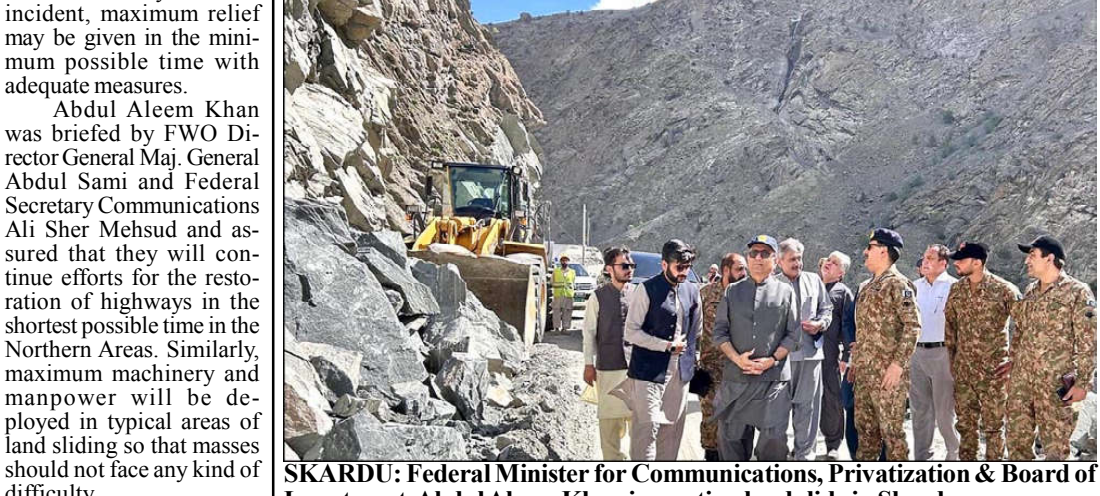
Investment, Abdul Aleem Khan inspecting land slide in Skardu.

self-determination in actional community to take cordance with the relevant cognizance of the Indian UN Security Council resoleaders' provocative statelutions. Deputy Prime ments and unwarranted Minister and Foreign Minclaims about Azad Jammu ister, Mohammad Ishaq and Kashmir, which con-Dar, who led the Pakistan stitute a serious threat to delegation briefed the Conregional peace.