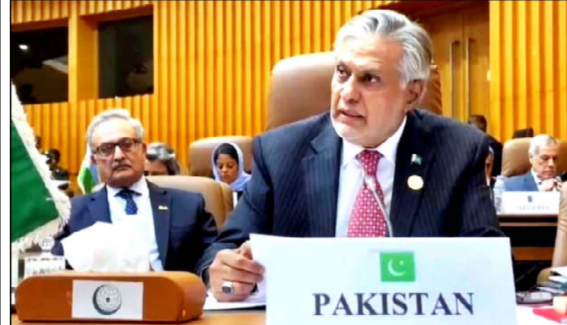
BANJUL: Deputy Prime Minister and Finance Minister Senator Muhammad Ishaq Dar addressing 15th OIC Islamic Summit Conference.

Condemning the rising trend of Islamophobia and discrimination against Muslims in various parts of the world, the deputy prime minister and foreign minister urged the OIC to formulate a joint strategy to work with global social media platforms to harmonize their application of content regulation policies for blasphemous, anti-Islamic and Islamophobic content