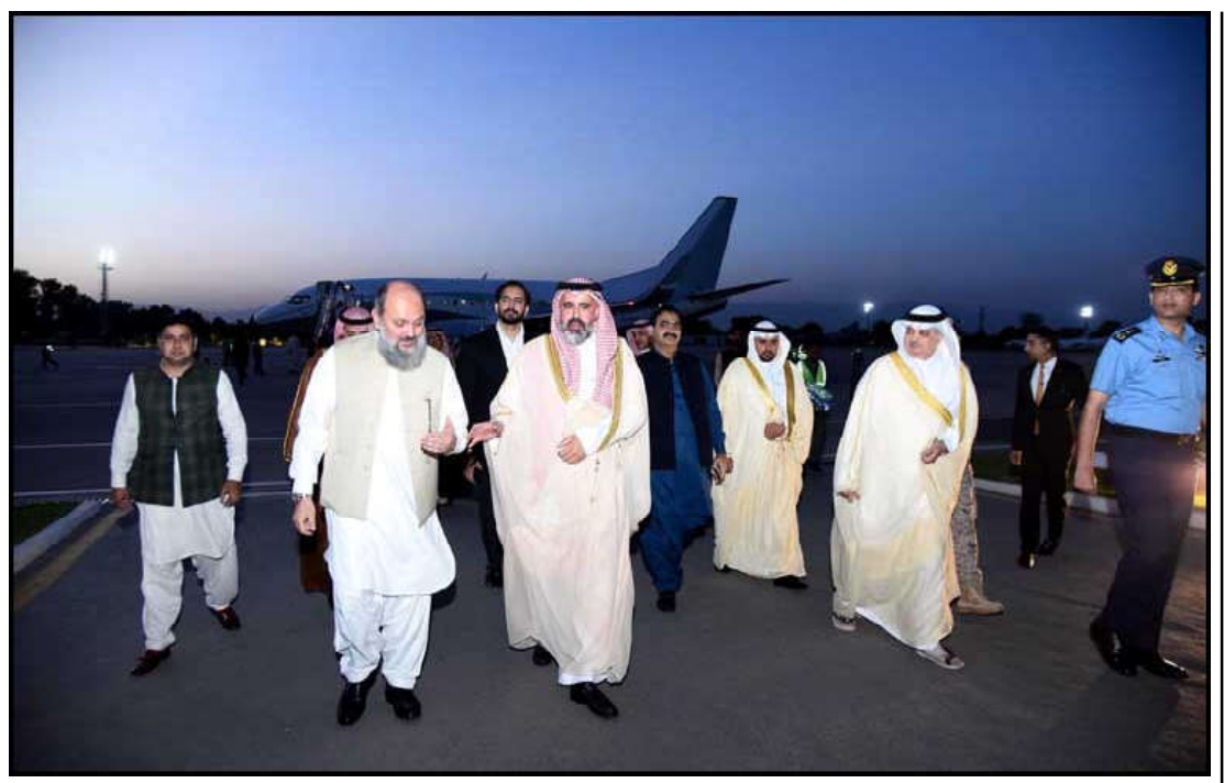
Federal Minister Jam Kamal Khan receiving a high-level Saudi business delegation upon its arrival.

Vol. XIV No. 105 Reg. mails-B / ID-445 Monday May 06, 2024, Shawal 27, 1445 A.H. Ph: 2158688, 2158997 Pages 4: Rs. 12