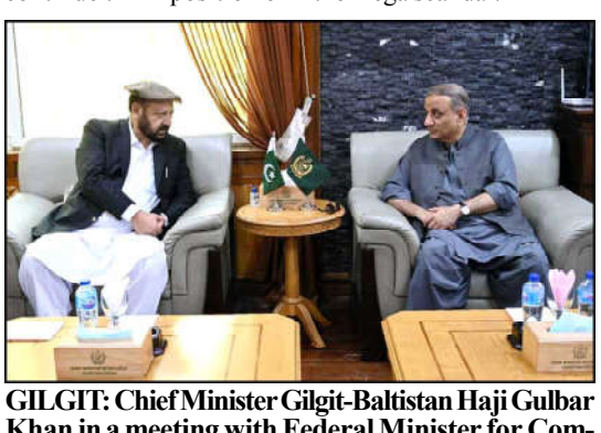
Khan in a meeting with Federal Minister for Communication Abdul Aleem Khan at CM Secretariat.

When a bumper stock was available in the country, there was no need to import wheat, he added. tractor trollies, and ani-He called for punishment mals. The protest will to the persons involved in continue till imposition of the mega scandal.