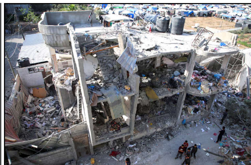
People stand next to a house damaged in an Israeli strike, amid the ongoing conflict between Israel and the Palestinian Islamist group Hamas, in Rafah, in the southern Gaza Strip.

"72 per cent of all residential buildings have been completely or partially destroyed". Reconstruction is made more difficult by the presence of large quantities of unexploded ordnance in the debris that Gaza's Civil Defence agency says triggers "more than 10 explosions every week". Mediators have proposed a deal that would halt fighting for 40 days and exchange Israeli hostages for potentially thousands of Palestinian prisoners, according to details released by Britain. An Israeli official not authorised to speak publicly said Israel was still waiting for Hamas's formal response to the latest proposal.