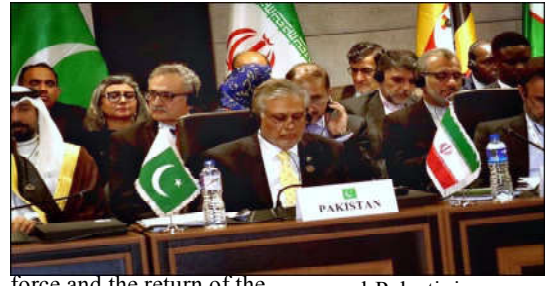
force and the return of the displaced people.

Deputy Prime Minister and Foreign Minister Ishaq Dar, in his address at the Preparatory Meeting of the 15th Session of the Islamic Summit Conference held here on Thursday, also called for an end to the indiscriminate use of