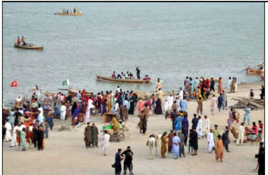
HYDERABAD: People are enjoying pleasant evening and cooling themselves during the hot weather, at River Indus in Jamshoro.