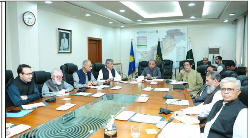
Federal Minister for Communications Abdul Aleem Khan is being briefed on the matters pertaining to Pakistan Post.

Attorney General, Mansoor Usman Awan was also present on the occasion, according to press statement issued by FBR.