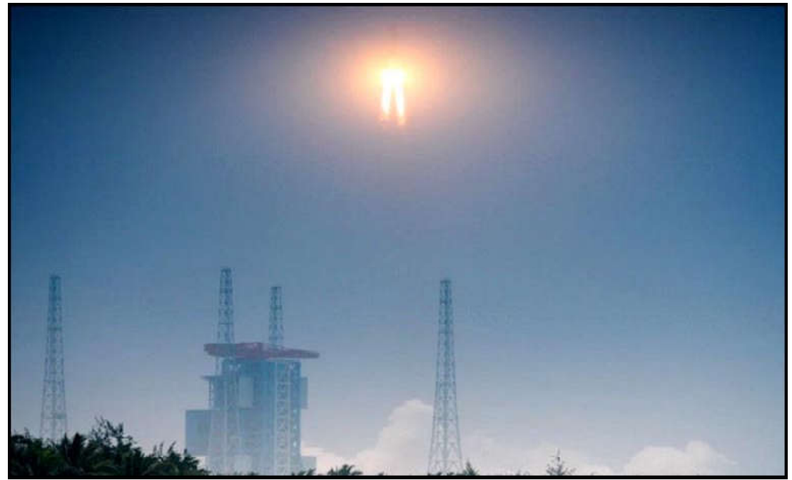
ISLAMABAD: In a historic moment for Pakistan, iCube Qamar, the country's first satellite mission to the moon has been launched into the space

In a statement today, Asif Ali Zardari congratulated the Institute of Space Technology, SUPARCO and the China National Space Administration on this achievement.