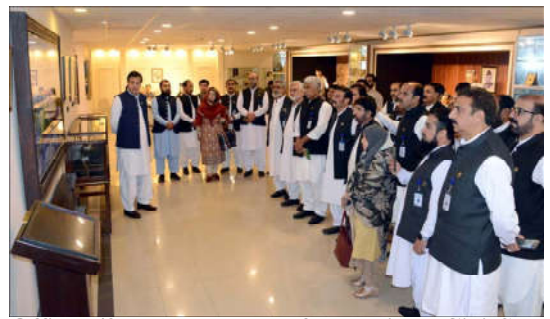
ISLAMABAD (Online): Minister for privatization Abdul Aleem Khan has said 10 larger institutions have expressed interest for privatization of PIA so far and obtained elementary documents.

ISLAMABAD (APP): Minister for Law and Justice, Senator Azam Nazeer Tarar has emphasized on the necessity of an independent and responsible media to promote democracy and accountability in the society. In his message on 'Press Freedom Day here Friday, he said, this year's theme, 'A Free Press for a Sustainable Future: Journalism Facing Environmental Challenges,' highlights the important role of the media in addressing environmental issues and sustainability. The law minister said that the Constitution of Pakistan ensured freedom of expression. It is our duty, as guardians of justice, to ensure a conducive environment where journalists can work freely, he added.