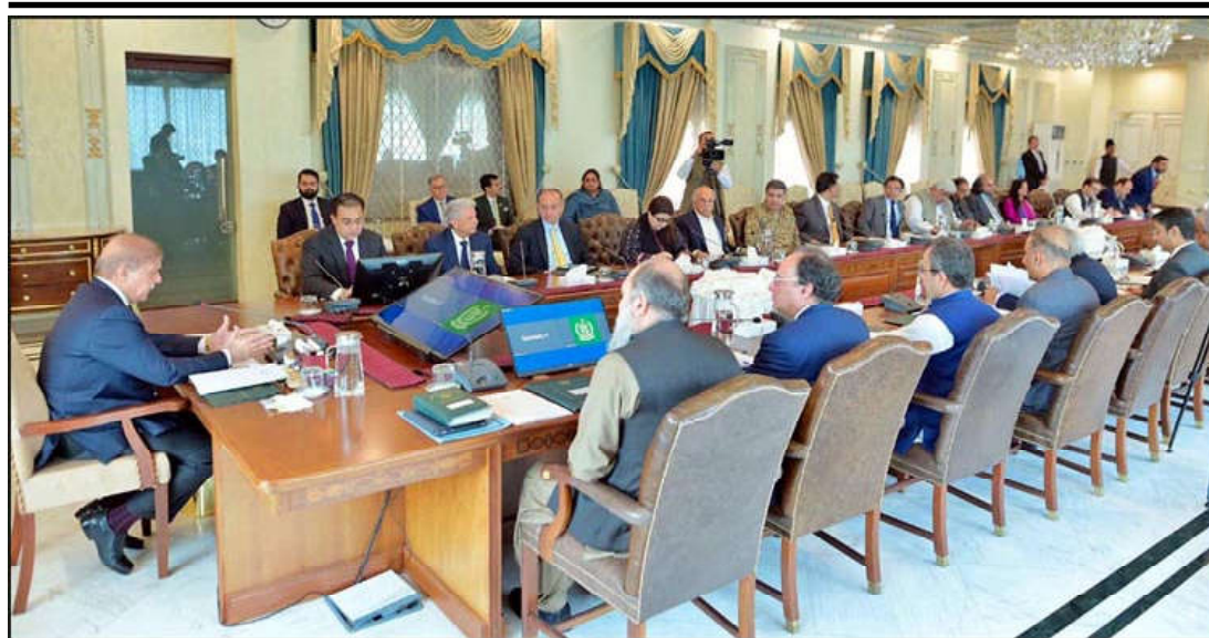
ISLAMABAD: Prime Minister Muhammad Shehbaz Sharif chairs a high level meeting regarding Saudi investments.