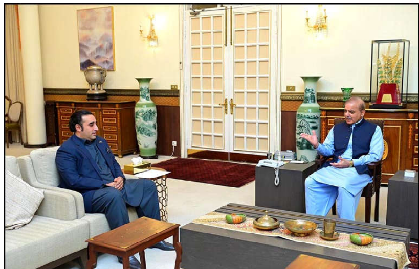
ISLAMABAD: Chairman Pakistan People's Party and MNA Bilawal Bhutto Zardari called on Prime Minister Muhammad Shehbaz Sharif.