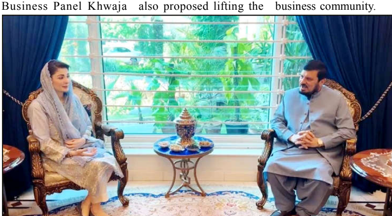
LAHORE: Governor Khyber Pakhtunkhwa Haji Ghulam Ali meeting with Chief Minister Punjab Maryam Nawaz Sharif at Jaati Umra.