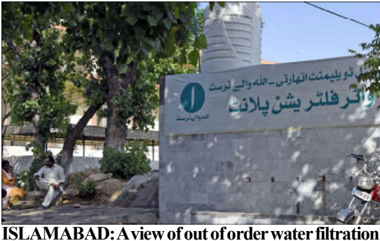
plant at a Katchi Abadi sector G-7 in the Federal Capital, as needs to attention for concern authority.

Through the Hajj Scheme, WWF 57 workers were selected for Hajj through the balloting of the dren of workers including annual Hajj programme.