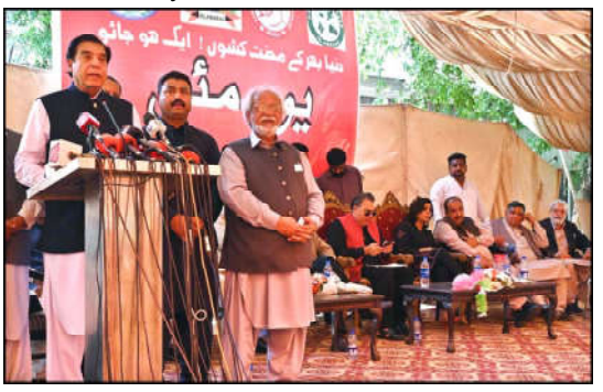
ISLAMABAD: Speaker National Assembly Raja Pervaiz Ashraf addressing during function to mark the International Labour Day at National Press Club.

The Modi government cannot weaken the Kashmiris' spirit of freedom by resorting to massacres, arrests, and unjustified restrictions, he added