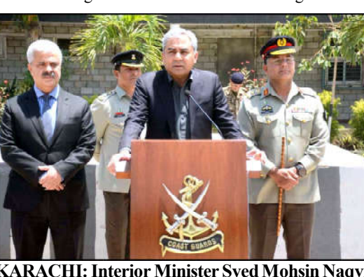
KARACHI: Interior Minister Syed Mohsin Naqvi addressing during visit Pakistan Coast Guards Headquarters

the institution, the high determination, courage and efforts of the officers and jawans of the Coast Guards, said Pakistan Coast Guards, is the only one that performs its duties simultaneously on land and sea. This is a force which has an important role not only in peace time but also in any difficult and war situation, Naqvi said. He expressed best wishes for the Pakistan Coast Guards by assuring the provision of all possible support and resources to make it more active and strong.