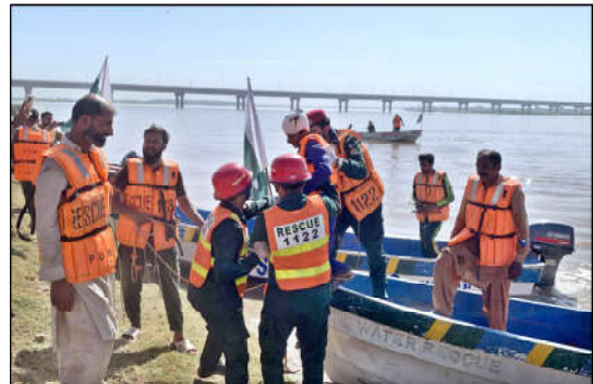
MULTAN: Staffers of Rescue 1122 participating in pre-flood mock exercises at Head Muhammadwala.