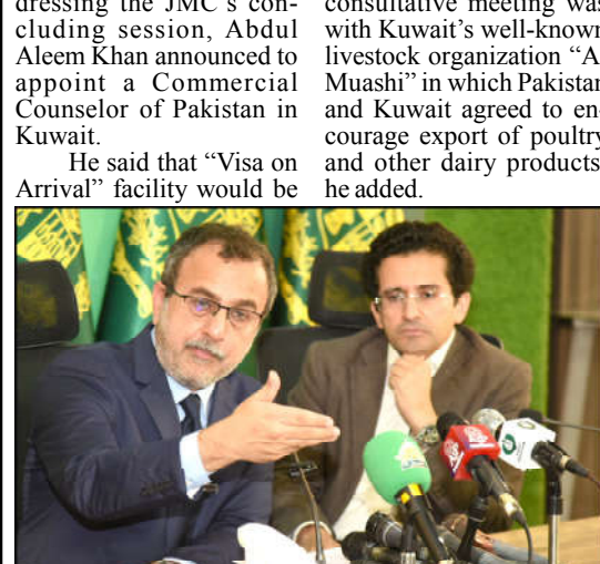
ISLAMABAD: Federal Minister for Power Division Awaiz Ahmad Khan Leghari addressing a press conference, in the Federal Capital.

started soon in Pakistan for the Gulf Cooperation Council member countries. The minister said that Kuwait could engage veterinary staff, doctors, nurses and other workforce from Pakistan. He expressed the hope that in future Kuwait would also relax visa conditions for Pakistanis. The minister said, "Pakistan wants a long term economic partnership with Kuwait for which special facilities can be provided under the banner of SIFC for businesses". He said that new investment opportunities were available in tourism, minerals, agriculture, food, textile and energy sectors in Pakistan. Aleem Khan said that the Pakistani delegation also held talks on joint ventures with the Kuwait Chamber of Commerce. A consultative meeting was with Kuwait's well-known livestock organization "Al Muashi" in which Pakistan and Kuwait agreed to encourage export of poultry and other dairy products, he added.