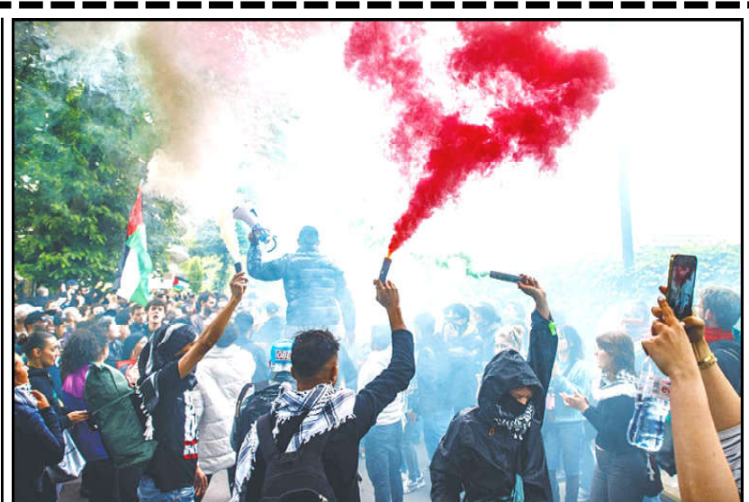
BRUSSELS: Protesters hold smoke bombs as they attend a demonstration in support of the people of Gaza in front of the embassy of Israel.

Ireland and Norway officially recognised a Palestinian state, prompting an angry reaction from Israel. Of the 27 members of the European Union, Sweden, Cyprus, Hungary, the Czech Republic, Poland, Slovakia, Romania and Bulgaria have already recognised a Palestinian state. Malta has said it could follow soon. Britain and Australia have said they are also considering recognition, but France has said now is not the time. Germany joined Israel's staunchest ally, the United States, in rejecting a unilateral approach, insisting that a two-state solution can only be achieved through dialogue. Denmark's parliament on Tuesday voted down a bill to recognise a Palestinian state.