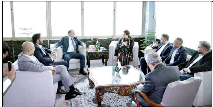
ISLAMABAD: Minister of State for IT and Telecommunication, Ms. Shaza Fatima Khawaja in a meeting with tech company Lenovo.