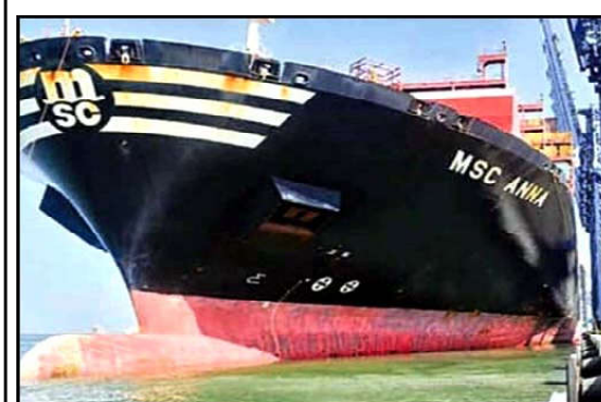
KARACHI: The world's largest cargo ship, MSC Anna has made a historic arrival at Karachi Port Trust (KPT) in Karachi. The colossal vessel arrived from India's Port Mundra and anchored at Karachi port, highlighting the port growing importance in international maritime trade. MSC Anna boasts impressive dimensions, measuring 400 meters in length and having a capacity to carry 19,638 containers.

Independent Report QUETTA: The Governor Balochistan, Sheikh Jaffar Khan Mandokhail and Chief Minister Mir Sarfraz Ahmed Bugti have condemned the incident of firing at the caravan of central President Balochistan Awami Party (BAP), Nawabzada Khalid Magsi. In their separate messages on Thursday, the Governor and Chief Minister expressed displeasure over performance of the administration in this regard. Chief Minister said the incident occurred with Nawabzada Khalid Magsi is sorrowful. He expressed satisfaction over safety of Nawabzada Khalid Magsi in the firing incident. He said that it is the topmost responsibility of police and levies to restore peace. He said that the criminal activities in broad daylight is a negligence of the district administrative officers.