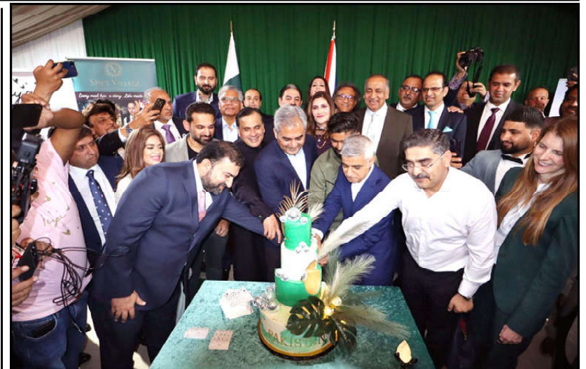
LONDON: Interior Minister Mohsin Naqvi cutting cake during a reception in honor of Pakistan Cricket team. Chief Minister Balochistan Mir Sarfraz Ahmed Bugti is also present

LONDON (INP): Federal Minister for Interior and Chairman Pakistan Cricket Board (PCB), Mohsin Naqvi on Thursday expressed the hope that the Pakistan cricket team through its hard work would bring the World Cup to the country. While addressing a reception hosted by the Pakistan's High Commissioner in the UK, Dr Muhammad Faisal in honour of the Pakistan Men's Cricket Team and the management at Pakistan House, London, Mohsin Naqvi said that entire cricket team of Pakistan was giving their best to the game. He urged the Pakistan's fans to keep supporting the team on their upcoming tour to the United States of America. The chairman PCB said that team management was independent in making decisions about players which he added important for delivering good performance. Speaking on the occasion, Mayor of London Sadiq Khan said that he was very happy to welcome Pakistan Cricket Team at London and wished them best of luck for upcoming matches.