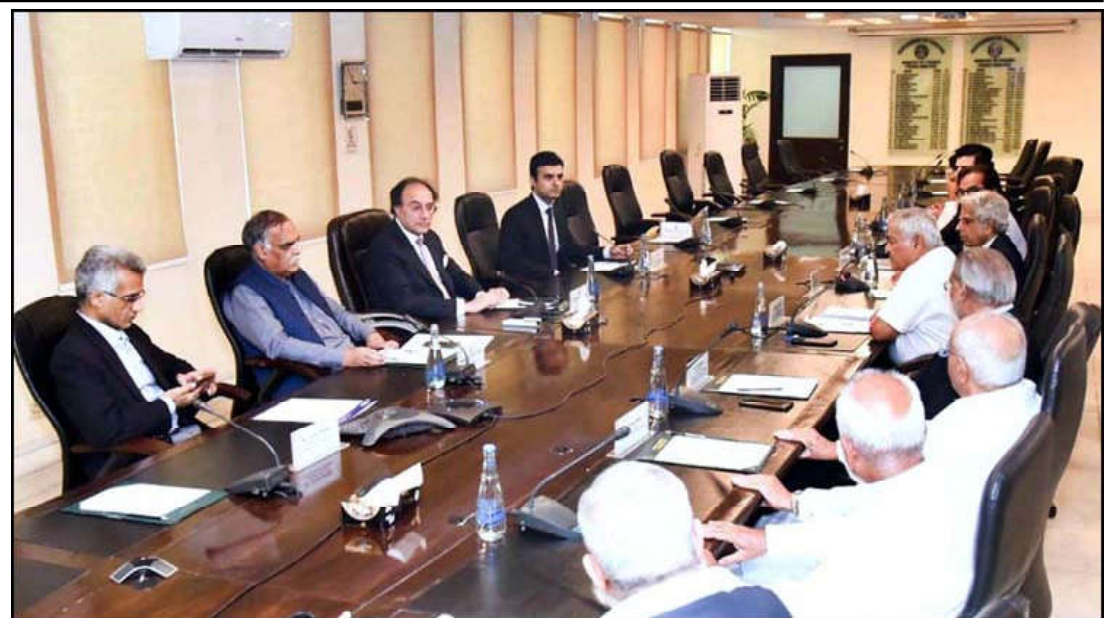
ISLAMABAD: Federal Minister for Finance and Revenue Senator Muhammad Aurangzeb in a meeting with the representatives from Pakistan Association of Large Steel Producers (PALSP), Pakistan Steel Melters Association (PSMA), Pakistan Steel Re-Rolling Mills Association (PSRMA) and Pakistan Steel Pipelines Association (PSPA).