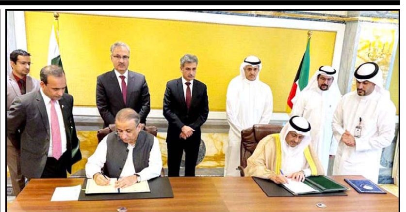
KUWAIT: Federal Minister for Communications, Investment Board and Privatization Abdul Aleem Khan and Kuwait's Minister of Commerce and Industry Omar Saud Al-Omar signing the MoU.

importance of China-Pakistan relations, founded on mutual respect, strategic trust, and close cooperation. He stressed that from the very outset, this relationship developed as a special and unique example in interstate relations and has served the best interests of the two countries. Both nations have consistently supported each other on issues of core interest, with Pakistan backing 'One China' principle and China's principled stance on the Jammu and