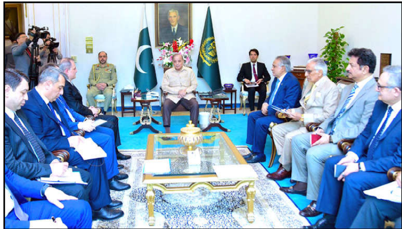
ISLAMABAD: Minister of Foreign Affairs of Azerbaijan Jeyhun Bayramov calls on Prime Minister Muhammad Shehbaz Sharif.

the Israeli aggression." The Saudi Crown Prince, and the rulers of the United Arab Emirates, Qatar, Kuwait and other countries were persistently voicing their support for the hapless Palestinians, he added. The prime minister also expressed gratitude to the European countries including Spain, Norway and Ireland for recognizing the State of Palestine in the wake of Israel's atrocious military aggression. Their bold and principled decision would hopefully encourage other countries to follow suit in recognizing the statehood of Palestine, he added. PM Shehbaz Sharif prayed to Allah Almighty to bring an end to the brutal oppression of the Palestinian people and bless them with an independent State of Palestine where they could live in a free atmosphere.