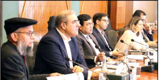
ISLAMABAD: The Central Development Working Party (CDWP) meeting held in Islamabad. The CDWP recommended two projects worth Rs. 609.45 billion to the Executive Committee of the National Economic Council (ECNEC) for consideration.

finance is OPEC Fund for International Development (US $30 million) Saudi Fund for Development (US$ 97.8 million) Kuwaiti Fund for Arab Economic Development (US$ 52.5 million) USAID (US$ 35.6 million grant). The main objective of the project was the construction of 108 MW hydropower project with an annual energy of about 476 GWh. The project was commissioned in 2019 and has generated a total of 730 million units till 28.02.2024. China Pakistan Economic Corridor (CPEC) Karakorum Highway Phase-I (Thakot to Raikot), a project related to transport and communication worth Rs. 567453.369 million (RMB 14775 million) recommended to ECNEC.