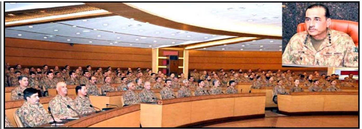
RAWALPINDI: Chief of Army Staff (COAS), General Syed Asim Munir presided over the 83rd Formation Commanders Conference held at General Headquarters (GHQ) in Rawalpindi.