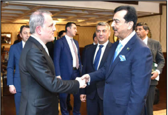
ISLAMABAD: Acting President Syed Yousuf Raza Gillani welcoming the Foreign Minister of Azerbaijan Jeyhun Bayramov at Aiwan-e-Sadr.

more closer. He called for boosting people-to-people contacts between the two nations, especially in the areas of tourism, business, and education. The visiting foreign minister said that cooperation between Pakistan and Azerbaijan was extremely important, which needed to be enhanced in the areas of economy, trade, and business. He said that increased connectivity and people-to-people contacts would help cement bilateral ties. Syed Yousuf Raza Gillani thanked the Government of Azerbaijan for its support to Pakistan on the issue of the Indian Illegally Occupied Jammu and Kashmir (IIOJK).