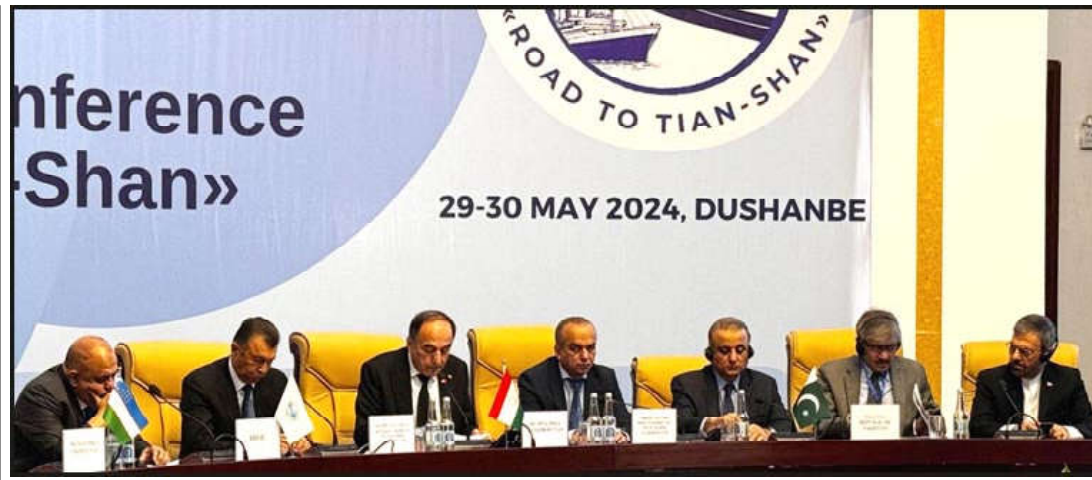
Federal Minister for Communications, Investment Board and Privatization, Abdul Aleem Khan addressing an International Conference in Dushanbe.

On the fiscal front, during July-March FY24, the revenue growth outpaced the growth in expenditures. Within revenues, both tax and non-tax collection grew significantly by 29.3 per cent and 90.7 per cent, respectively.