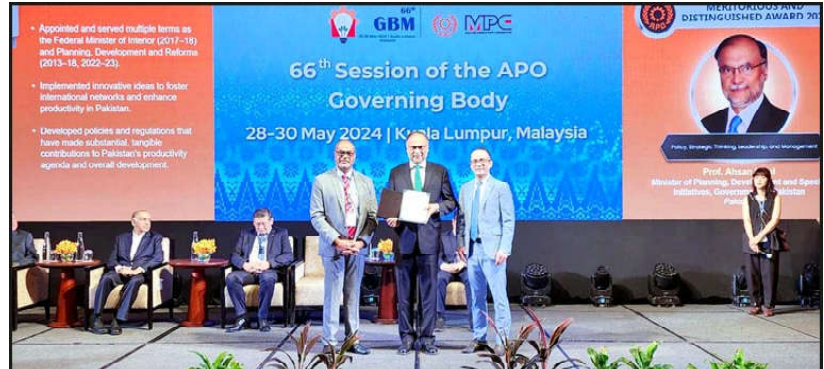
KUALALUMPUR: Planning Minister Prof. Ahsan Iqbal receiving the APO Meritorious and Distinguished Award 2024 by the Asian Productivity Organisation (APO) in Malaysia.

Stressing the need to raise awareness and educate