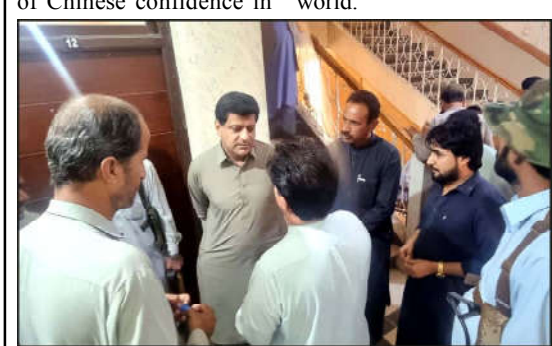
QUETTA: Provincial Minister for Planning and Development, Mir Zahoob Ahmed Baledi listening the problems of citizens, at Civil Secretariat.

The survey included 0.25 million mobile broadband tests, 45,000 calls and SMS tests, and 0.13 million Ookla speed tests using advanced QoS monitoring tools, ensuring compliance with NGMS licenses and the Cellular Mobile Network QoS Regulations 2021.