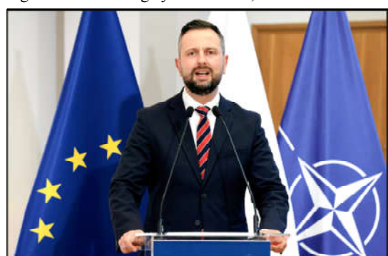
Polish Minister of Defence Wladyslaw Kosiniak-Kamysz presents details of "East Shield", a 10 billion zloty ($2.55 billion) program to beef up defenses along its eastern border with Belarus and Russia, in Warsaw, Poland.

Rafah residents said Israeli tanks had pushed into Tel Al-Sultan in the west and Yibna and near Shaboura in the centre before retreating towards a buffer zone on the border with Egypt, rather than staying put as they have in other offensives. "We received distress calls from residents in Tel Al-Sultan where drones targeted displaced citizens as they moved from areas where they were staying toward the safe areas," the deputy director of ambulance and emergency services in Rafah, Haitham al Hams, said. Palestinian health officials said 19 civilians had been killed in Israeli air strikes and shelling across Gaza. Israel accuses Hamas militants of hiding among civilians, which the militants deny.