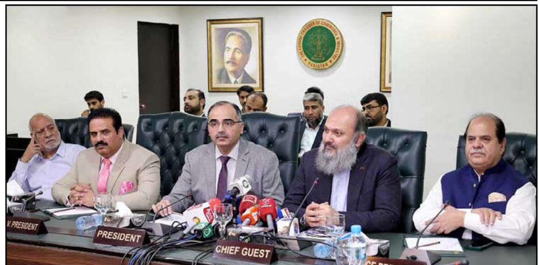
LAHORE: Federal Minister for Commerce Jam Kamal Khan addressing during his visit to Lahore Chamber of Commerce and Industry.