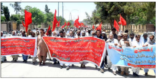
QUETTA: Activists of Balochistan Labour Federation hold protest rally.