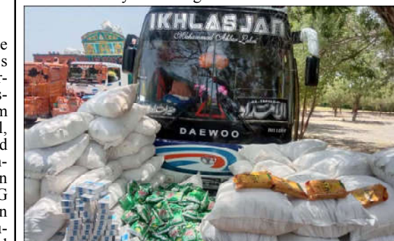
HUB: Pakistan Coast Guard Officials are exposing huge quantity of recovered Chew Tobacco and foreign cigarettes seized during routine check of passenger buses on Uthal Coast Guard Check Post, to media persons during a press conference.

Chairman KPT underscored KPT's historical commitment to serving the nation and the people of Karachi through various CSR initiatives. These include funding 6 schools for underprivileged students, operating a hospital for workers and nearby residents, maintaining a Fire Station with modern equipment available round the clock for Karachi.