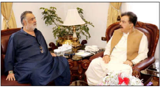
QUETTA: Senator Dostain Domki meeting with Balochistan Governor Sheikh Jaffar Khan Mandokhail.

Gandapur mentioned that ongoing discussions with the Federation concerning load shedding in KP have led us to meet and resolve the issue.