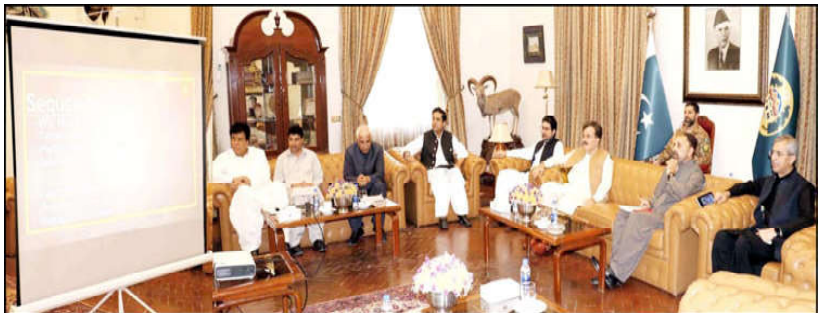
QUETTA: Balochistan Governor Sheikh Jaffar Khan Mandokhail being briefed about the Quetta Development Package.

He also vowed to implement the "key performance indicators" to review performance of the administrative officers.