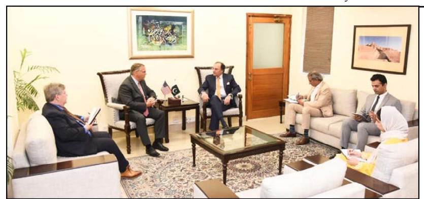
Federal Minister for Finance & Revenue Senator Muhammad Aurangzeb called on by the Ambassador of USA to Pakistan H.E. Mr. Donald Blome in Islamabad