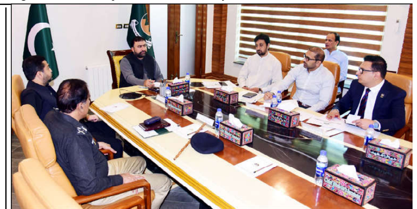
QUETTA: Balochistan Chief Minister Mir Sarfraz Ahmed Bugti presides over the meeting to review law and order situation and payment of compensation to those martyred in terrorism incidents.

Mir Sarfraz Ahmed Bugti prayed for the stability and survival of the country.