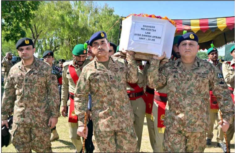
PESHAWAR: Chief of the Army Staff General Syed Asim Munir attending funeral prayers of soldiers who embraced Shahadat during an intense exchange of fire with terrorists at general area Bagh, Khyber district

Ph: 2841470/2841473 Vol: XIX No. 108, Zeeqad 19, 1445 AH Tuesday May 28, 2024, Pages 04, Price Rs.15