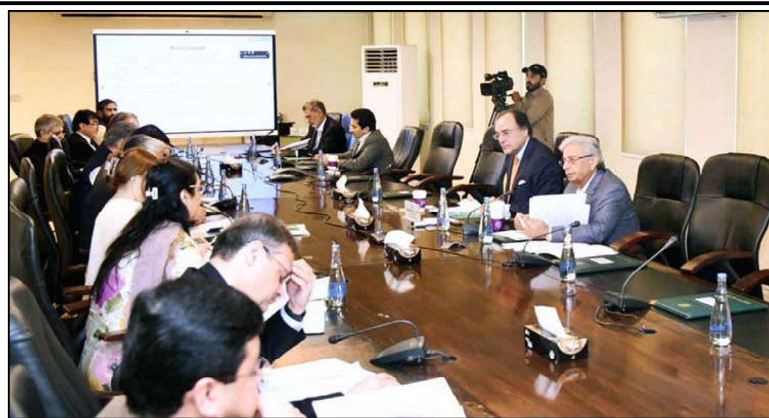
ISLAMABAD: Federal Minister for Finance & Revenue Senator Muhammad Aurangzeb presiding over a meeting of Economic Coordination Committee (ECC).

for Commerce, Jam Kamal Khan; Minister for Power, Sardar Awais Ahmad Khan Leghari; Minister for Petroleum, Musadik Masood Malik; Minister for Industries & Production, Rana Tanveer Hussain; Minister for Economic Affairs, Ahmad Khan Cheema; Minister of State for Finance & Revenue, Ali Pervez Malik; Governor SBP, Chairman SECP, Federal Secretaries, and other senior officials of the relevant ministries.