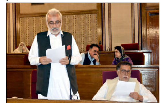
QUETTA: Provincial Minister for PHE Sardar Abdul Rehman Khetran presenting resolution about Youm-e-Takbeer Day at Balochistan Assembly session.

In the resolution, it was made pledge not to avoid from rendering any kind of sacrifice for stability, development and defence of the country and foil the internal and external conspiracies to be hatched against the stability of country and institutions.