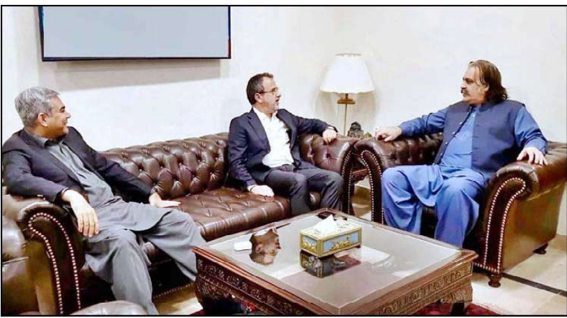
ISLAMABAD: Interior Minister Mohsin Naqvi and Federal Minister for Energy Sardar Awais Ahmad Khan Laghari in a meeting with Chief Minister Khyber Pakhtunkhwa Ali Amin Gandapur.