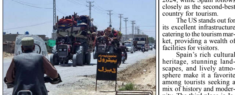
QUETTA: Nomadic families are moving to colder areas after the heat wave has increased in Sindh, at Western Bypass in Quetta.