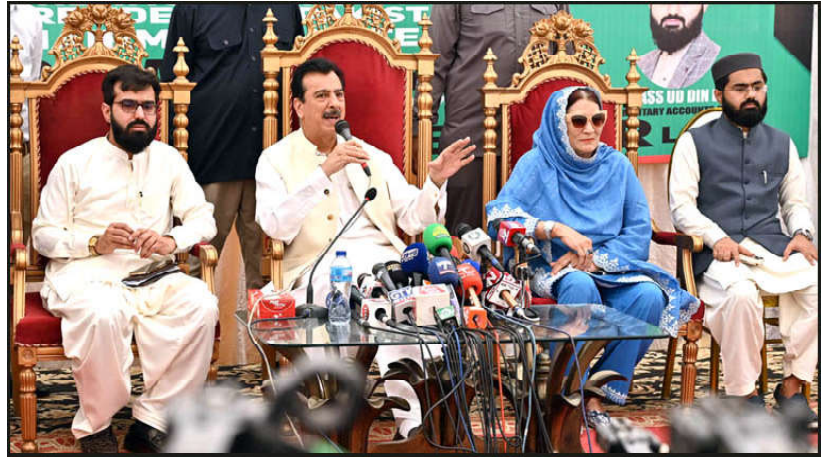
LAHORE: Acting President Syed Yousuf Raza Gilani addressing to media after inauguration of the Zaheer ud Din RO plant at Military Accounts Cooperative Housing Society.