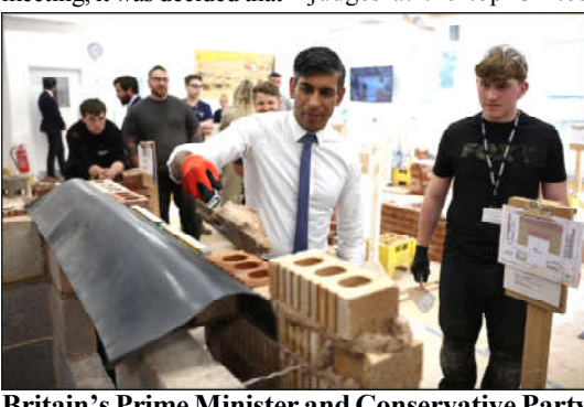
Britain's Prime Minister and Conservative Party leader Rishi Sunak lays a brick during a bricklaying workshop at Cannock College, in Cannock, Staffordshire, Britain.