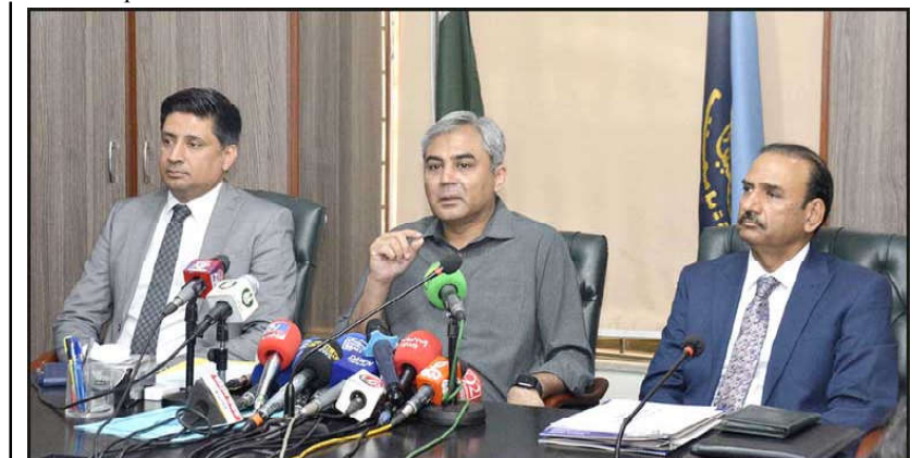
LAHORE: Interior Minister Mohsin Naqvi addressing a Press conference at FIA regional office.

Meanwhile, the Provincial Minister for Food, Noor Muhammad Durrani also expressed sorrow over the martyrdom of Captain Hussain Jahangir and Havildar Shafiqullah in the operation against terrorists in Hassan Khel area.