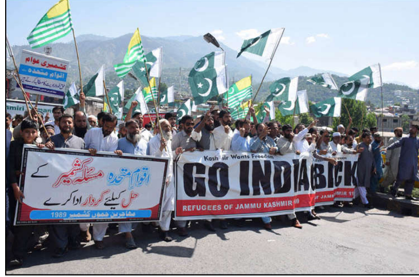
MUZAFFARABAD: Refugees protesting against Indian atrocities in Occupied Kashmir for the sake of independence by raising the flags of Pakistan and Kashmir at Azadi Chowk.