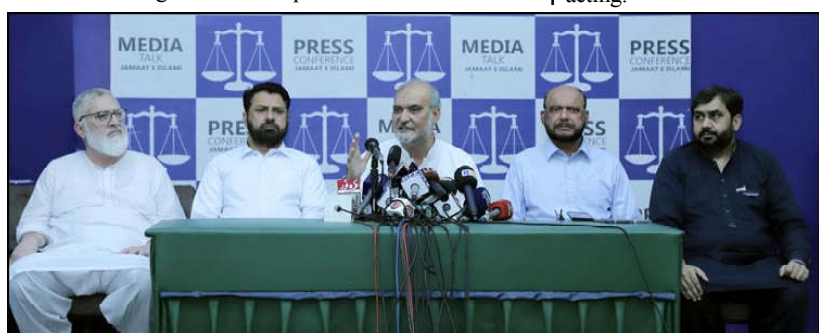
LAHORE: Amir Jamaat-e-Islami Hafiz Naemur Rehman addressing a Press conference.

QUETTA: The Chief Minister Sarfaraz Ahmed Bugti has expressed grief and sorrow over the death of renowned artist, Talat Hussain. In a condolence message issued here on Sunday, the Chief Minister paid tributes to the late Talat Hussain and said that he was very talented artist. He said that Talat Hussain promoted reformative process through his positive characters in the TV dramas. The Chief Minister also said that Talat Hussain was a worthy of love artist among the Pakistani people, who would always be remembered. He expressed heartfelt empathy and condolence with the bereaved family members.