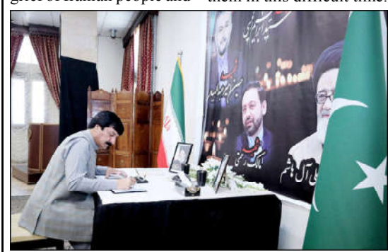
LAHORE: Governor Punjab, Sardar Saleem Haider writing his condolence remarks during his visit to Embassy of the Islamic Republic of Iran.