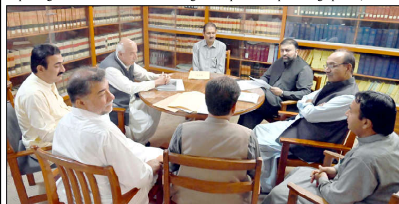
QUETTA: A delegation of National Party led by its President MPA Dr. Abdul Malik Baloch meeting with Chief Minister Balochistan Mir Sarfraz Ahmed Bugti during Assembly session.