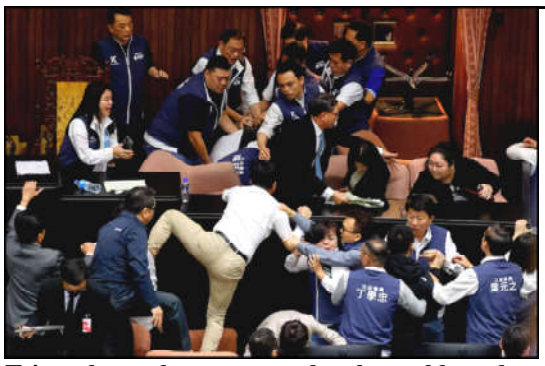
Taiwan lawmakers argue and exchange blows during a parliamentary session in Taipei, Taiwan.

national security, would still not be allowed to enlist. Separately, Zelenskyy signed a law increasing fines for draft dodgers to up to 8,500 hryvnias ($218), according to the parliament's website. The average monthly wage in Ukraine is about $560. The lack of manpower is seen by some military analysts as Ukraine's biggest problem. Weapons supplies that have been significantly delayed, particularly from Washington, are expected to reach the frontline soon. Ukraine has already lowered the draft mobilisation age from 27 to 25. The upper limit is 60. In tandem, the government has also temporarily suspended consular services for men of military age who reside abroad, complaining they were not helping the Ukrainian state fight for its survival.