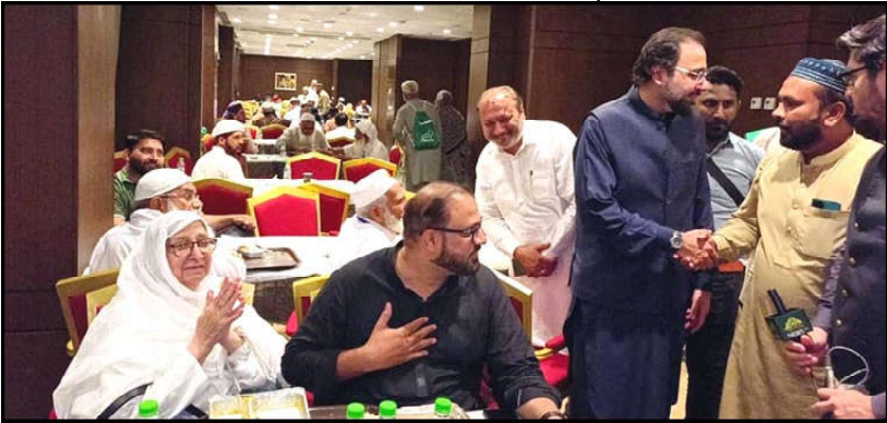
MADINAH: Federal Minister of Religious Affairs and Interfaith Harmony, Chaudhry Salik Hussain meeting with Pakistani pilgrims.

ISLAMABAD (APP): Member of the National Assembly Ali Pervaiz took the oath of the office of Minister of State here on Friday. President Asif Ali Zardari administered the oath to Ali Pervaiz in a ceremony held at the Aiwan-e-Sadr. The swearing-in ceremony was attended by Interior Minister Mohsin Naqvi, Finance Minister Muhammad Aurangzeb, parliamentarians, and notables from different walks of life. Ali Pervaiz was elected as MNA from NA-119 constituency of Lahore on the ticket of the Pakistan Muslim League-N in the recently held by-election.