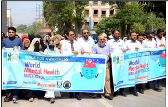
FAISALABAD: Participants hold a banner during awareness walk on the eve of World Mental Health at Allied Hospital in the city.

of pollution is grave which cannot be ignored. During the hearing of the case related to distribution of motorcycles to students scheme the court said in its remarks non-obtaining environmental NOC before project is criminal case. The court made the motorcycle distribution to students scheme conditional to NOC. The court ordered to submit report regarding restoration of 7 sports complex of LDA and cutting of tree.