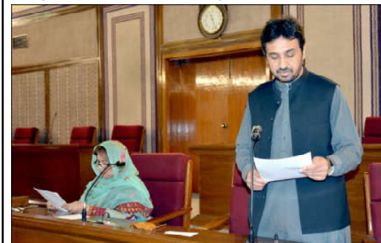
QUETTA: Provincial Finance Minister Mir Shoaib Nausherwani presenting a resolution in the Balochistan Assembly.

QUETTA (INP): In a crackdown on smuggling operations across various regions of Balochistan, the Frontier Corps (FC) Balochistan has successfully intercepted illegal goods valued at over Rs123 million during operations conducted from April 17 to May 17, 2024. The operations, carried out in areas including Dera Allah Yar, Barkhan, Pishin, Chaman, and Mastung, saw the confiscation of a substantial quantity of smuggled items. Among the seized goods were 76 metric tons of sugar, 671 tires, 159 cartons of cigarettes, and 82,900 liters of Iranian diesel. In addition to these items, authorities also recovered other contraband such as fertilizers, solar panels, and non-customs paid vehicles. These seized goods were promptly handed over to customs authorities for further action. The smugglers had been attempting to transport these illicit items through various means including trucks, passenger buses, and clandestine routes. However, the timely intervention of FC Balochistan foiled their attempts, preventing the illegal flow of goods across the region.