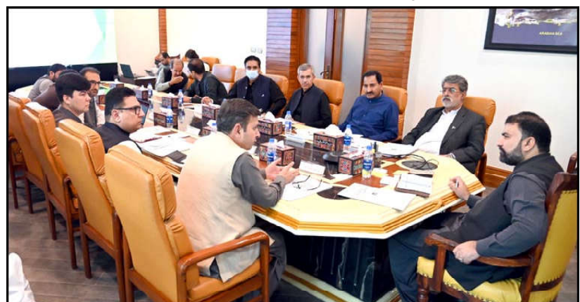
QUETTA: Chief Minister Balochistan Mir Sarfraz Ahmed Bugti chairing a review meeting about the Quetta Solid Waste Management

The report indicates that the Taliban provides these groups with financial support, arms, weapons, and secret hideouts.