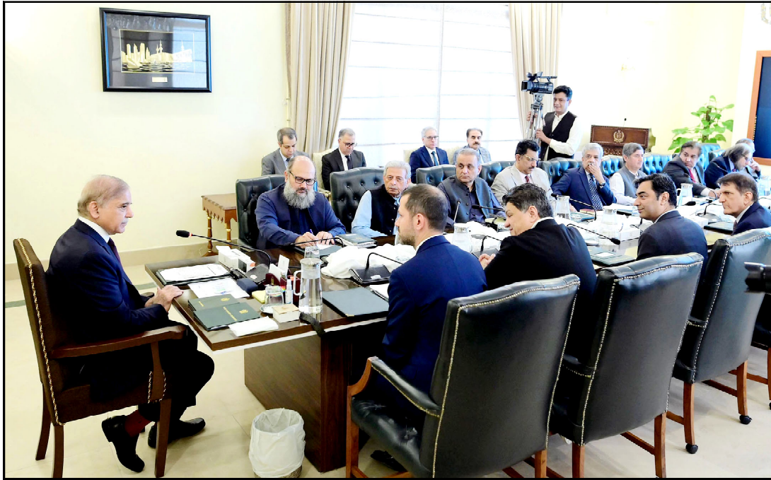
ISLAMABAD: A delegation of international beverages manufacturing companies met Prime Minister Shehbaz Sharif

Ph: 2841470/2841473 Vol: XIX No. 99, Zeeqad 09, 1445 AH Saturday May 18, 2024, Pages 04, Price Rs.15