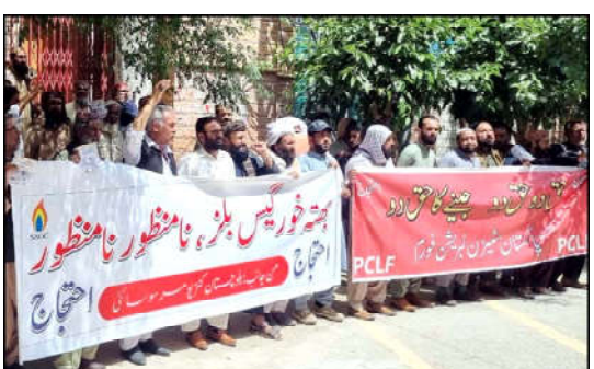
QUETTA: Members of Pakistan Citizen Liberation Forum are holding protest demonstration against price hike of essential commodities and inflation, at Quetta press club.