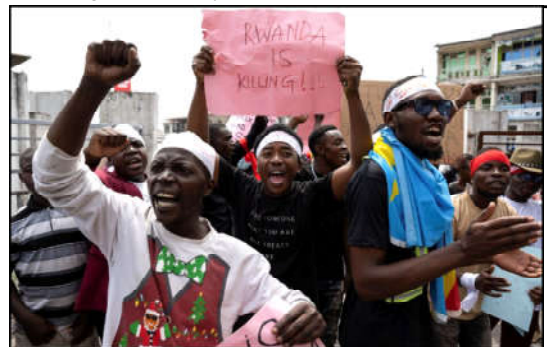
Congolese people react during the funeral of the nine victims, including seven children who were killed in a strike earlier this month at the Bulengo displaced persons camp (IDP), in Goma, North Kivu province, Democratic Republic of the Congo.