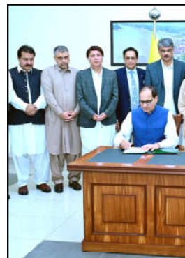
MUZZAFFARABAD: Prime Minister Muhammad Shehbaz Sharif witnesses the signing of a Memorandum of Understanding between the Government of Pakistan and the Government of Azad Jammu and Kashmir with regard to 960 MW Dudhnaal Hydropower Project.

They would also be able to start their earning and livelihood in a dignified manner by providing professional services and facilities to the livestock breeders. He said that at the time when world is heading towards the corporate farming, then we would also have to pay attention on the corporate farming. The Chief Minister assured the members of delegation to provide suitable opportunities to the youngsters for provision of other veterinary services by formulating effective policies in the province.