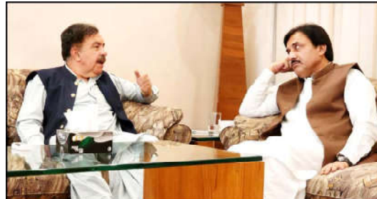
QUETTA: Deputy Chairman Senate Saydal Khan Nassar meeting with Governor Balochistan Sheikh Jaffar Khan Mandokhail

Independent Report QUETTA: The Governor Balochistan, Sheikh Jaffar Khan Mandokhail has stated that the importance of skills is equally increasing along with education in the ever changing world. Our youth can't benefit from the modern science and technology well without learning modern skills. The Governor said that unemployment can be brought down by making the technical and vocational institutions functional at the provincial level. The Governor was speaking to different delegations and personalities who called on him here at