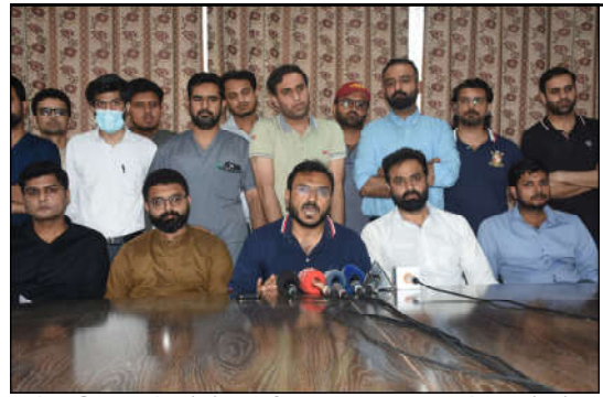
LAHORE: Activists of Young Doctors Association holding a press conference for their demands in the Provincial Capital.