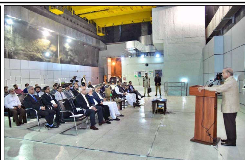
MUZAFFARABAD: Prime Minister Muhammad Shehbaz Sharif addresses a meeting at Neelum-Jhelum Hydro Power Project.

fixed. No more delay will be acceptable," he added. PM Shehbaz said it was a project of national significance in the power sector after Tarbela and Mangla dams with a huge cost and must remain functional for decades. He directed that the inquiry should be carried out by third party experts and not by the designer or contractor of the project. He also directed the Water and Power Development Authority (WAPDA) and NJHP Company to complete the repair work of the tunnel at the earliest and resume power generation. The prime minister appreciated the WAPDA chairman and his team for their efforts to repair the fault in the tunnel and resumption of generation last year.