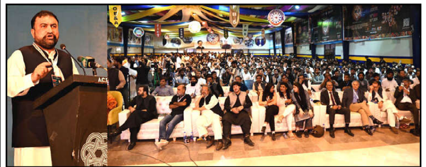
QUETTA: Balochistan Chief Minister Mir Sarfraz Bugti addressing participants of concluding ceremony of Pakistan Literary Festival at BUIITEMS

to work on and implement in future. He said that we have plan to send our talented youth to abroad for doing Ph.Ds and other higher education so that they are able to shoulder their future responsibilities after coming back to their country and province. He said that we would also be sending our youth to abroad after learning their different skills. Mir Sarfraz Bugti said that we destroyed our education system at our own by killing the teachers and professors, and so the governance in the province, no one came from Punjab or other areas to destroy the system. Now we have to mend our way and correct the affairs at our own, adding Chief Minister stressed.