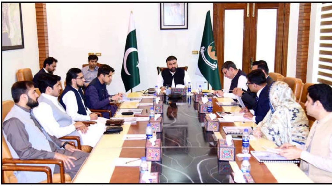
QUETTA: Balochistan Chief Minister Mir Sarfaraz Bugti presiding over a meeting regarding Balochistan Youth Policy 2024