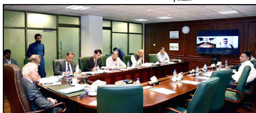
ISLAMABAD: Federal Minister for Maritime Affairs Qaiser Ahmed Sheikh chairs a meeting regarding the enhancement of Import at Gwadar Port.

as a key player of Pakistan's economic prosperity and emphasized the need for concerted efforts to enhance import operation and business activity. He reaffirmed the government's commitment to this cause, citing directives from the prime minister to take decisive measures to enhance import of government goods through Gwadar Port. Furthermore, the federal minister emphasized the significance of previous decisions made by the Economic Coordination Committee (ECC) and the directives of the prime minister in 2008 and 2022, respectively.