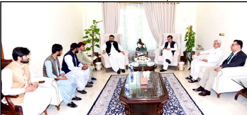
QUETTA: A representative delegation of Balochistan Veterinary Doctors Association meeting with Chief Minister Balochistan Mir Sarfaraz Bugti. Chief Secretary Shakeel Qadir Khan are also present

ISLAMABAD (INP): Pakistan witnessed 1,514 terror incidents in 2023, the interior ministry told National Assembly (NA) on Thursday. According to details, the interior ministry submitted a written in the National Assembly regarding law and order situation of Pakistan. The report stated that 572 security personnel were martyred and 1292 were injured in the terror incidents in 2023, while 358 citizens lost their lives and 700 sustained wounds. The report highlighted the worsening law and order situation in the country specially in KP, where 858 terror attacks were reported that claimed lives of 402 security personnel and 178 civilians. As many as 148 security personnel were martyred and 198 were injured in 626 terror attacks in Balochistan during the past year.