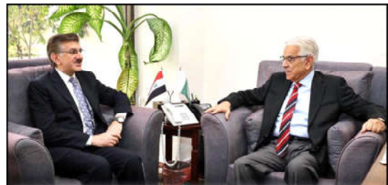
ISLAMABAD: H.E. Hamid Abbas Lafta, Ambassador of Iraq called on Minister for Defence & Defence Production Khawaja Muhammad Asif.

province, development projects. They expressed pledge to work together for the development of the province and the welfare of its people. Syedaal Khan said that the Upper House is determined to resolve the problems faced by the provinces and provide opportunities for development and prosperity to its citizens. He said the development and prosperity of Balochistan will ensure the economic stability of the country.