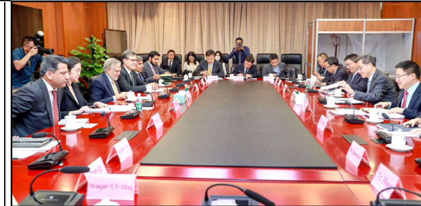
BEIJING: Deputy Prime Minister and Foreign Minister Senator Mohammad Ishaq Dar meets with the Minister of Finance of the People's Republic of China Lan Fo'an.

formulated, were intended to develop and it is our responsibility to establish safe and sustainable development for future generations, he said. He said that "We want to retain a better country for future generations". The minister said that sustainable development goals are included in Pakistan's 2025 agenda. Today, all the stakeholders, civil society and private sector can also play a role in achieving sustainable development goals, he stressed.