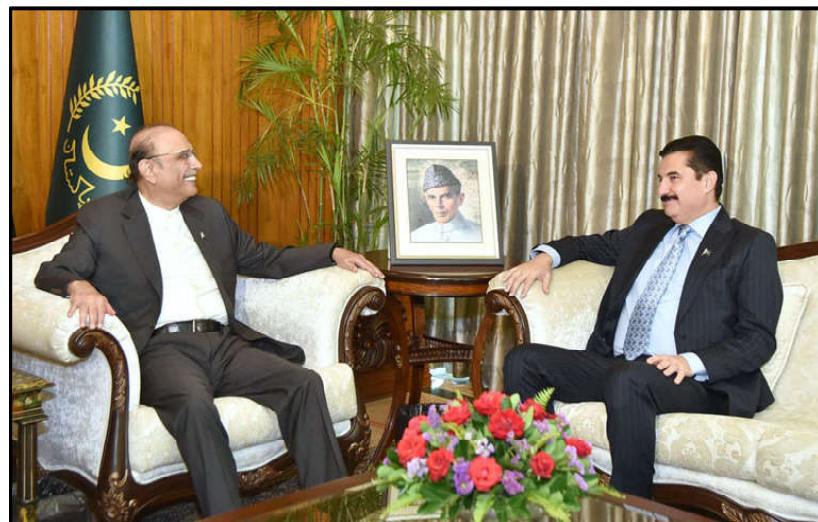
ISLAMABAD: Governor Khyber Pakhtunkhwa Faisal Karim Kundi called on President Asif Ali Zardari at Aiwan-e-Sadr.