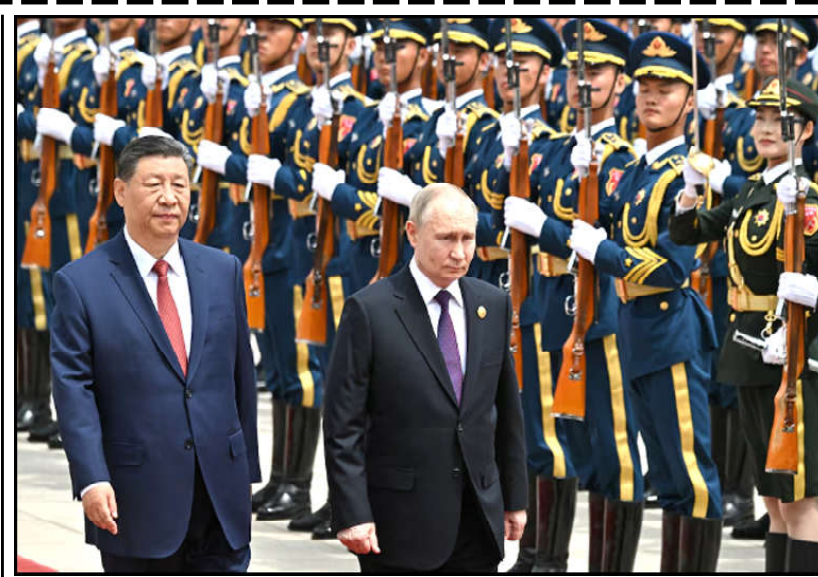
Russian President Vladimir Putin and Chinese President Xi Jinping attend an official welcoming ceremony in Beijing, China.

Monitoring Desk BEIJING: Russian President Vladimir Putin and Chinese leader Xi Jinping on Thursday reaffirmed their "no-limits" partnership that has deepened as both countries face rising tensions with the West, and they criticized U.S. military alliances in Asia and the Pacific region. At their summit in Beijing, Putin thanked China's proposals for ending the war in Ukraine, which have been rejected by Ukraine and its Western supporters as largely following the Kremlin's line. China claims to take a neutral position in the conflict, but it has backed the Kremlin's contentions that Russia was provoked into attacking Ukraine by the West, and it continues to supply key components needed by Moscow for weapons production. China, which has not criticized the invasion, proposed a broadly worded peace plan in 2023, calling for a cease-fire and for direct talks between Moscow and Kyiv. The plan was rejected by both Ukraine and the West for failing to call for Russia to leave occupied parts of Ukraine. China also gave a rhetorical nod to Russia's narrative about Nazism in Ukraine, with a joint statement Thursday that said Moscow and Beijing should defend the post-World War II order and "severely condemn the glorification of or even attempts to revive Nazism and militarism."