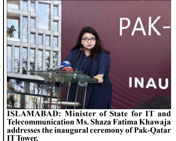
ISLAMABAD: Minister of State for IT and Telecommunication Ms. Shaza Fatima Khawaja addresses the inaugural ceremony of Pak-Qatar IT Tower.

Finance Minister Muhammad Aurangzeb, Commerce Minister Jam Kamal Khan and Advisor to Prime Minister Rana Ehsan Afzal attended the meeting, where as federal secretaries and Chairman Securities and Exchange Commission of Pakistan were also present in the meeting, said a press release. Aleem Khan said that all the four provinces and their chief ministers would also be taken into confidence in this regard, adding that ease of doing business would provide a clear road map for the promotion of business in the country while its related proposals, legislation and other important issues would be finalized soon.