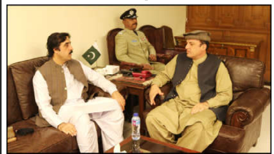
QUETTA: Provincial Food Minister Haji Noor Muhammad Dumar meeting with Speaker Balochistan Assembly Captain (ret) Abdul Khaliq Achakzai.

coastline. During the operation, 12,970 kg of supari, 3,049 packets of gutka mix, 1,524 packets of cigarettes, 1,543 kg of cloth mix, and 206 bundles of net cloth, dairy and bakery products, grocery items, dry fruits, makeup accessories, cooking oil, crockery, electronic devices, speed boats, various vehicles, engine oil, Iranian petrol and diesel were seized.