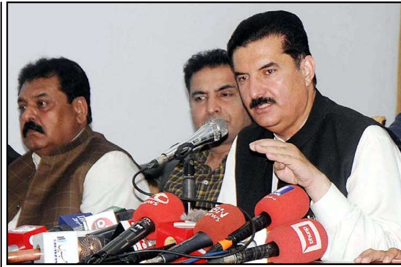
MULTAN: Khyber Pakhtunkhwa Governor, Faisal Karim Kundi addresses to media persons during Meet the Press program held at Multan press club.

In response to queries regarding political difference with CM KP, the governor emphasized his primary focus on forging coordination and collaboration with the provincial government for the welfare of the masses. He extended a goodwill gesture to the Chief Minister of KP, inviting him to the Governor's office to prioritize the uplift of the province, and setting aside political differences. Acknowledging his political mentors, Shaheed Benazir Bhutto and Asif Ali Zardari.