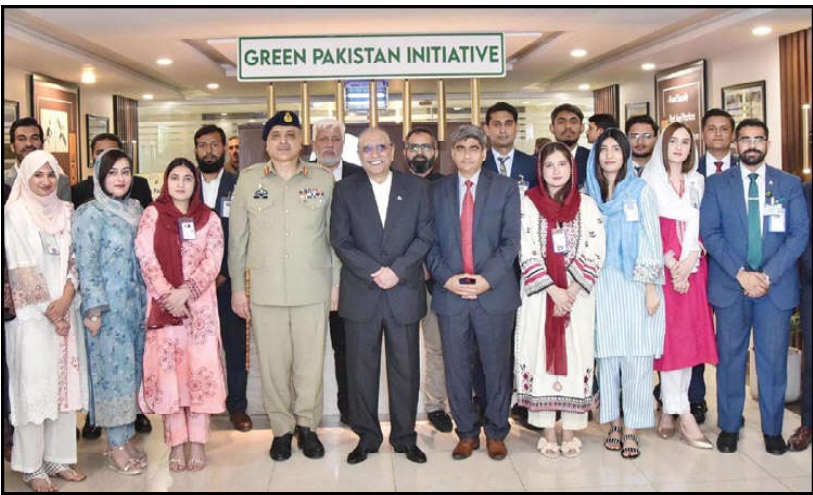
RAWALPINDI: President Asif Ali Zardari in a group photo with officials of the Green Pakistan Initiative during his visit to its headquarters