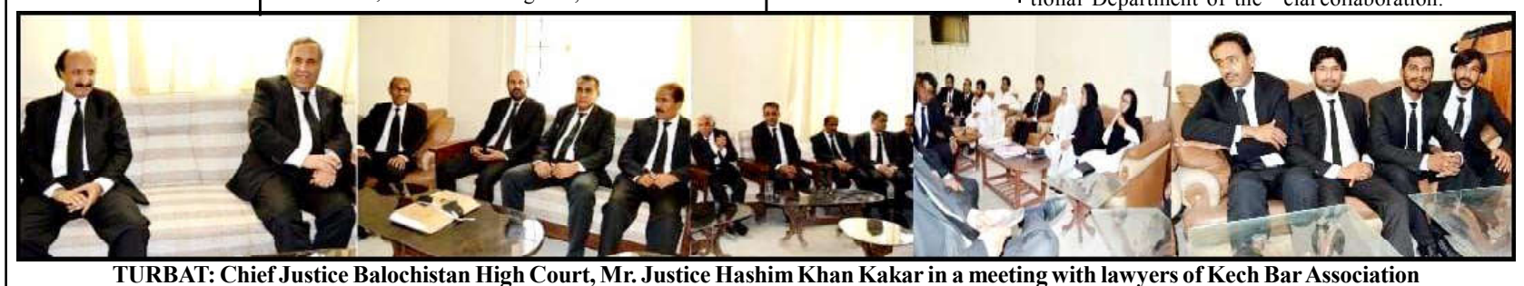
TURBAT: Chief Justice Balochistan High Court, Mr. Justice Hashim Khan Kakar in a meeting with lawyers of Kech Bar Association

BEIJING (APP): Pakistan and China on Tuesday expressed joint determination to accelerate progress on all projects of the China-Pakistan Economic Corridor (CPEC) including ML-1 upgradation, Gwadar Port, and realignment of Karakorum Highway. The bilateral ties and cooperation were discussed in a meeting between Deputy Prime Minister and Foreign Minister Senator Mohammad Ishaq Dar and Minister of the International Department of the Communist Party of China (IDCPC), Liu Jianchao here. The deputy prime minister is on a four-day visit to China mainly to co-chair the Fifth Pakistan-China Foreign Ministers' Strategic Dialogue with Chinese Foreign Minister Wang Yi. In the meeting, the two leaders also reaffirmed the importance of the All-Weather Strategic Cooperative Partnership between Pakistan and China and to further reinforce mutually beneficial collaboration.