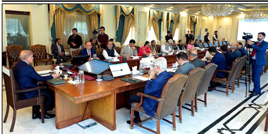
ISLAMABAD: Prime Minister Muhammad Shehbaz Sharif chairs a review meeting on the matters related to Ministry of Privatisation and Privatisation Commission.

ISLAMABAD (APP): First meeting of the South Asian Telecommunication Regulators' Council (SATRC) on Policy Regulation and Services commenced on Tuesday.