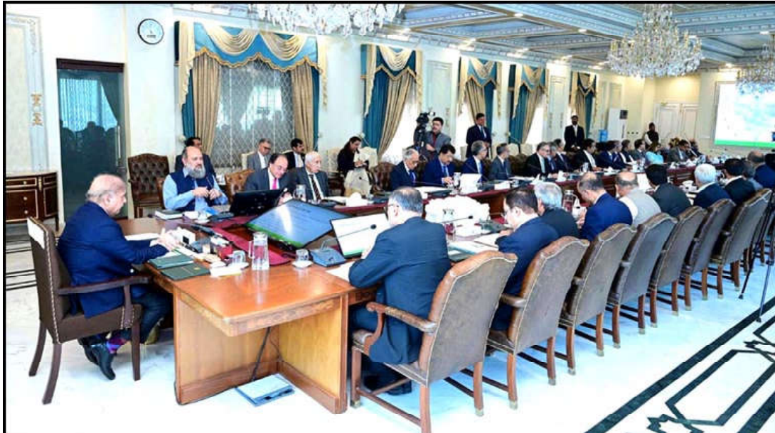
ISLAMABAD: Prime Minister Muhammad Shehbaz Sharif chairs a meeting regarding CPEC Phase II and other projects under Chinese investment in Pakistan.

Ph: 2841470/2841473 Vol: XIX No. 96, Zeeqad 06, 1445 AH Wednesday May 15, 2024, Pages 04, Price Rs.15