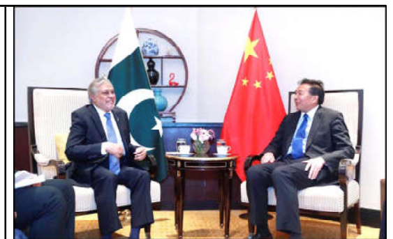
BEIJING: Deputy Prime Minister and Foreign Minister, Senator Mohammad Ishaq Dar holds a luncheon meeting with Chairman of China International Development Cooperation Agency (CIDCA) Luo Zhaohui.