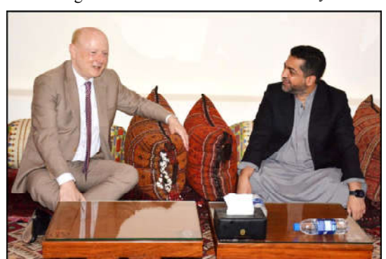
QUETTA: Consul General of Germany Dr. Rudiger Lotz meeting with Home Minister Mir Ziaullah Lango

measures for restoration of electricity in the province on behalf of the provincial government. The Federal Minister Energy Owais Ahmed Leghari requested the Government of Balochistan to work together for prevention of the power pilferage. Mir Sarfraz Ahmed Bugti invited Federal Minister Energy to visit Balochistan and assured him of best cooperation in this regard. The Chief Minister assured that the campaign would be started afresh against prevention of theft of electricity in the province.