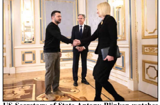
US Secretary of State Antony Blinken watches Ukraine's President Volodymyr Zelenskyy greet US Ambassador to Ukraine Bridget Brink prior to their meeting in Kyiv.

Monitoring Desk WASHINGTON: US national security adviser Jake Sullivan said on Monday that President Joe Biden's administration did not view the killings of Palestinians in Gaza by Israel as genocide. Sullivan, speaking to reporters at the White House, said the United States wants to see Hamas defeated, that Palestinians facing the brunt of Israeli onslaught were in "hell", and that a major military operation by Israel in Rafah would be a mistake. "We do not believe what is happening in Gaza is a genocide. We have been firmly on record rejecting that proposition," Sullivan said. Biden, who is running for re-election this year, has faced heavy criticism from his own supporters domestically for his support of Israel; some of those critics have accused Israel of committing genocide. Reiterating a comment Biden made on Saturday, Sullivan said there could be a ceasefire in Gaza now if Hamas would release prisoners. The world should be calling on Hamas to return to the negotiating table and accept a deal, Sullivan said. The United States is working urgently for a ceasefire and prisoner release deal, Sullivan said. He said he could not predict when or if such a deal would be sealed.