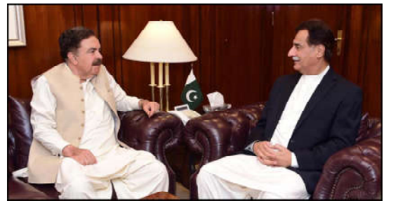
ISLAMABAD: Governor Balochistan Sheikh Jaffar Khan Mandokhail called on Speaker National Assembly Sardar Ayaz Sadiq at Parliament House.

Independent Report QUETTA: The Government of Balochistan has decided to initiate the Chief Minister Initiative of Health on Wheels in order to provide healthcare facilities in remote areas of the province. The CM Initiative of Health on Wheel service would be started from the native district of Chief Minister (Dera Bugti) in collaboration with the Indus Hospital. The decision to this effect was made during meeting of a delegation of Indus Hospital with the