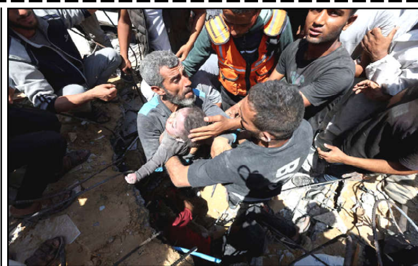
Palestinians carry the dead body of a child recovered from under the rubble of a house hit in an Israeli strike, amid the ongoing conflict between Israel and the Palestinian Islamist group Hamas, in Nuseirat refugee camp in the central Gaza Strip.

Palestinians killed in overnight airstrikes. "We don't know where to go. We have been displaced from one place to the next... We are running in the streets. I saw it with my own eyes. I saw the tank and the bulldozer. It is on that street," said one woman, who did not give her name. Attending a Memorial Day ceremony to mark Israel's fallen soldiers in Jerusalem on Monday, Prime Minister Benjamin Netanyahu said the war against Hamas is a struggle to secure Israel's "existence, liberty, security and prosperity." In Rafah, Israel stepped up aerial and ground bombardments on the eastern areas of the city, killing people in an airstrike on a house.