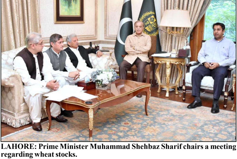
regarding wheat stocks.

compared 741,196,400 shares valuing Rs 25.268 billion the last day. Some 387 companies transacted their shares in the stock market; 241 of them recorded gains and 120 sustained losses, whereas the prices of 26 remained unchanged.