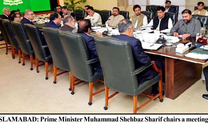
ISLAMABAD: Prime Minister Muhammad Shehbaz Sharif chairs a meeting on the matters related to Balochistan province.

The officials of NAB were occupied in the investigation of corruption amounting to billions of rupees within the food department while, the case of thousands of sacks of wheat being stolen was also under came under investigation