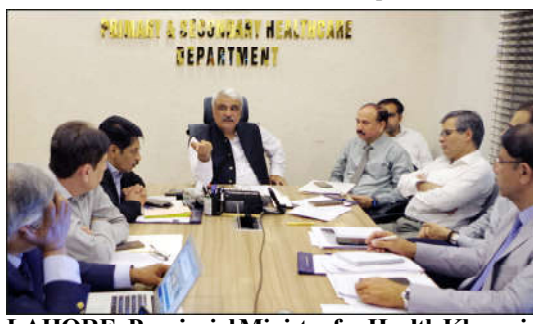
LAHORE: Provincial Minister for Health Khawaia Salman Rafique presides over the 2<sup>nd</sup> meeting of Health Insurance working group Sub Committee.

While issuing policy directives about new ADP, the CM directed the high ups of these departments to give top priority to the Khan, Minister for completion in the allocation & of developmental funds.