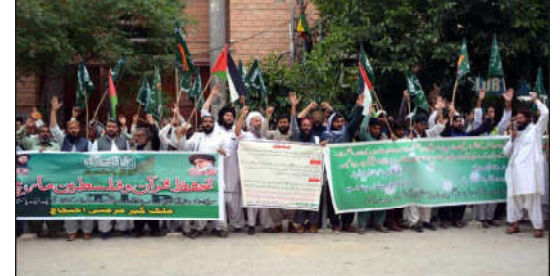
QUETTA: Activists of Tehreek-e-Labbaik (TLP) are holding protest demonstration against desecration of Holy Quran in Sweden, at Quetta press club.

launched in 2019, has so far been implemented in five stan, Malaysia, Indonesia Morocco and Bangladesh.