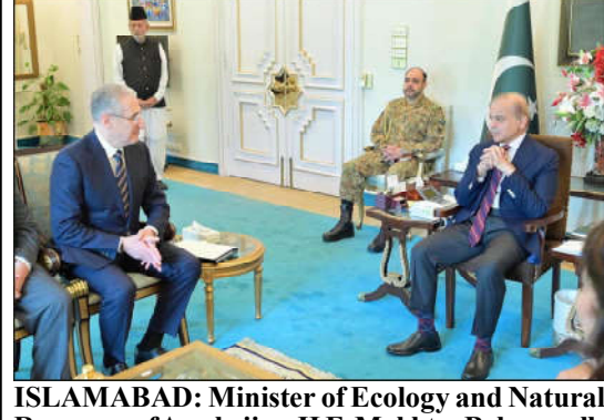
Resources of Azerbaijan, H.E. Mukhtar Babyev calls on Prime Minister Muhammad Shehbaz Sharif.

On this occasion se nior officers of the district administration and police, public personalities were