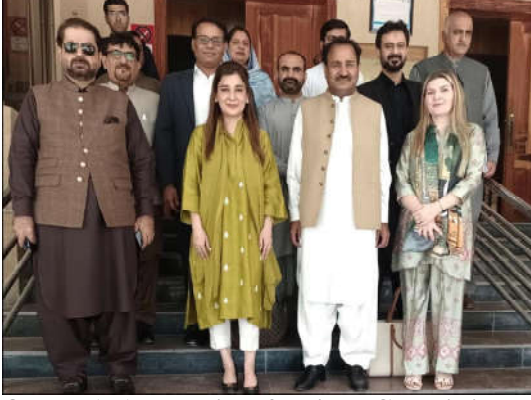
QUETTA: A delegation of National Commission on the Rights of Child (NCRC) led by its Chairperson Ayesha Raza Farooq in a group photo with Secretary Local Government Abdul Rauf Baloch after a meeting

be made to leave no stone unturned in the service of the public. The Deputy Commissioner specially instructed the officers to pay attention to the cleanliness of the cities and to make special arrangements for cleanliness in markets and other public places in all concerned cities to keep the area clean. While instructing the Xens, he said that the quality of ongoing development projects across the district should not only be ensured, but prioritized for their completion so that people would get ben-