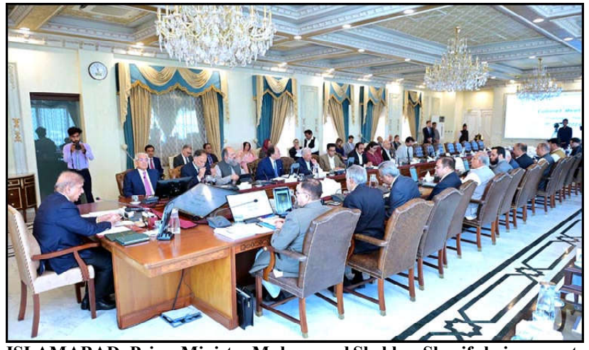
ISLAMABAD: Prime Minister Muhammad Shehbaz Sharif chairs a meeting of the Federal Cabinet.