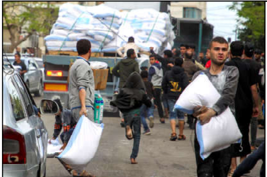
People grab flour bags from a truck after the Israeli military began evacuating Palestinian civilians ahead of a threatened assault on Rafah in the southern Gaza Strip.

Monitoring Desk JERUSALEM: The head of the United Nations' atomic watchdog traveled Monday to Iran, where his agency faces increasing difficulty in monitoring the Islamic Republic's rapidly advancing nuclear program as tensions remain high in the wider Middle East over the Israel-Hamas war. Rafael Mariano Grossi already has warned Tehran has enough uranium enriched to near-weapons-grade levels to make "several" nuclear bombs if it chose to do so. He has acknowledged the agency can't guarantee that none of Iran's centrifuges may have been peeled away for clandestine enrichment. Those challenges now find themselves entangled in attacks between Israel and Iran, with the city of Isfahan apparently coming under Israeli fire in recent weeks despite it being surrounded by sensitive nuclear sites. Grossi is likely to attend an Iranian nuclear conference there while on his two-day trip to Iran. "Problems will not disappear," Grossi told an International Atomic Energy Agency Board of Governors' meeting in March. "They will only get worse. So, we need to address this in a serious way." In Tehran, Grossi and Iranian Foreign Minister Hossein Amirabdollahian shook hands in front of journalists before going into a meeting. Authorities offered no immediate comment on their discussions. Tensions have grown between Iran and the IAEA since then-President Donald Trump in 2018 unilaterally withdrew America from Tehran's nuclear deal with world powers.