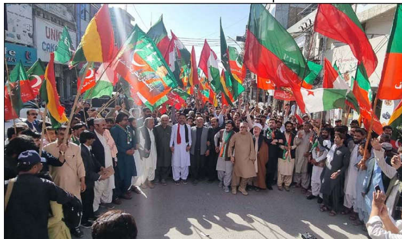
QUETTA: Activists of different Political Parties are holding protest rally for acceptance of their demands, at Mannan Chowk.