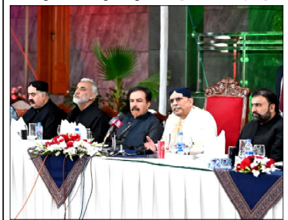
QUETTA: President Asif Ali Zardari addressing the banquet hosted by the Chief Minister of Balochistan Mir Sarfraz Ahmed Bugti. Governor Balochistan Sheikh Jaffar Khan Mandokhail is also present

Among those who received the President were included: Governor Balochistan, Sheikh Jaffar Khan Mandokhail, Chief Minister, Mir Sarfraz Ahmed Bugti, provincial ministers, members of provincial assembly and leaders of Pakistan Peoples Party (PPP) including its president and Senator, Mir Changez Jamali, former Chief Minister Nawab Sanaulah Zehri besides other provincial high ups.