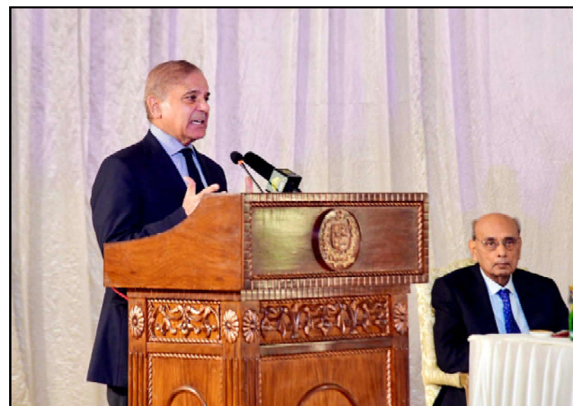
Prime Minister Muhammad Shehbaz Sharif addresses a banquet organized in honor of the delegation of businessmen and investors led by the Saudi Deputy Investment Minister Ibrahim Al-Mubarak, in Islamabad