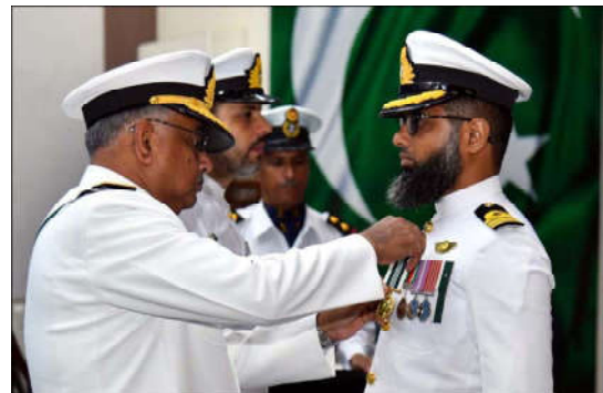
KARACHI: Chief of the Naval Staff, Admiral Naveed Ashraf awarding medal to an officer during Pakistan Navy Investiture Ceremony held in Karachi.