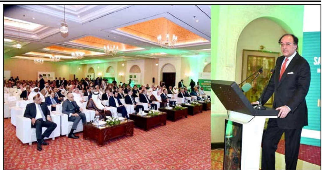
ISLAMABAD: Muhammad Aurangzeb, Federal Minister for Finance addressing the Saudi Arabia-Pakistan Investment Forum 2024.

The IMF has said accelerating reforms was more important than the size of a new program, which would be guided by a package of reforms and balance of payments needs.