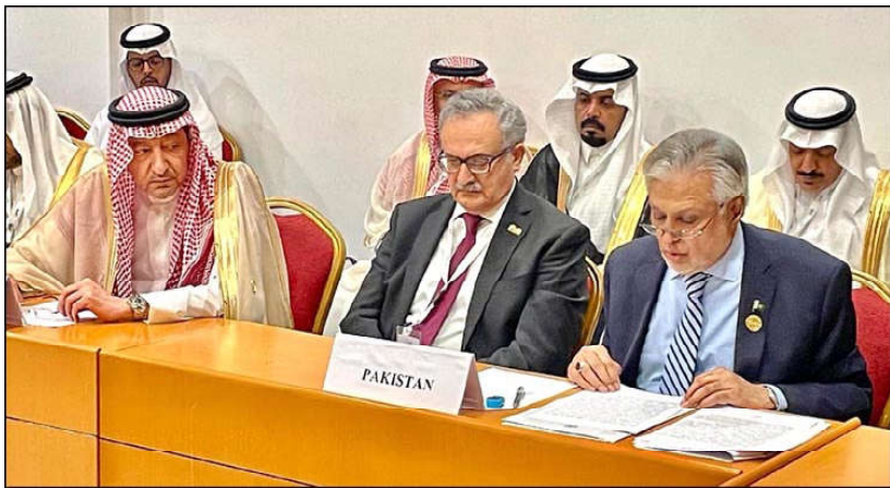
GAMBIA: Deputy Prime Minister and Foreign Minister Senator Mohammad Ishaq Dar briefed the OIC Contact Group on Jammu and Kashmir, on the sidelines of the 15th OIC Islamic Summit Conference, in Banjul, the Gambia.