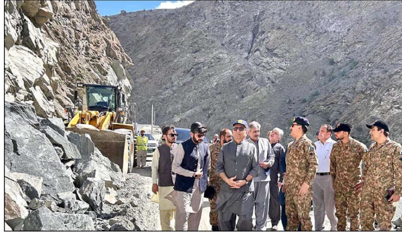
SKARDU: Federal Minister for Communications, Privatization & Board of Investment, Abdul Aleem Khan inspecting land slide in Skardu.