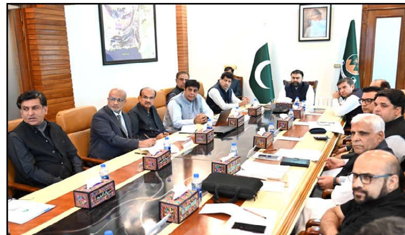
QUETTA: Chief Minister Balochistan Mir Sarfraz Ahmed Bugti being briefed about Communication Department

The prime minister expressed his satisfaction over the solid and tangible progress achieved during the delegation's interaction with the Pakistani counterparts.