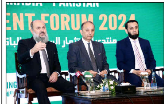
ISLAMABAD: Federal Minister for Commerce, Jam Kamal Khan, Information & Broadcasting Minister Attaullah Tarar and Minister for Petroleum Musadiq Masood Malik addressing the media regarding the Saudi Arabia-Pakistan Investment Forum 2024.

This new approach had already yielded positive results, with Saudi investors expressing confidence in the government's commitments, the minister added. The minister attributed this trust to the government's consistent follow-through on its promises, demonstrated by the frequent meetings between Prime Minister Shehbaz Sharif and the Saudi Crown Prince, Mohammed bin Salman Al Saud and meetings of ministers of both the countries during past two months.