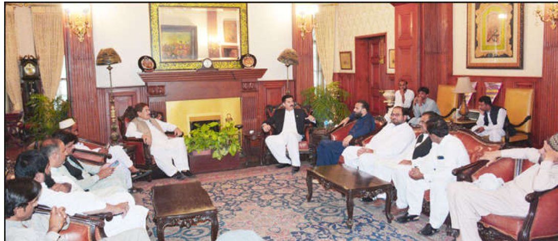
PESHAWAR: Delegation from different walks of life meeting with Khyber Pakhtunkhwa Governor Faisal Karim Kundi.

The law minister maintained that participating in a ceremony of this important welfare institution of his native district as chief guest was a matter of great honor and pride for him, for which he was personally grateful to its organizers.