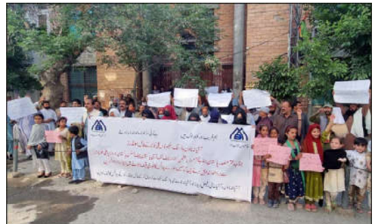
QUETTA: Affected victims of Ashiana Builders and Developers Project are holding protest demonstration for acceptance of their demands, at Quetta press club.

Saudi delegation, PTI has always impeded the path of progress. Every conspiracy of the PTI founder against the country is failing," he added. "The PTI founder has launched an attack on the national institutions on please his foreign masters," said Rana Tanveer. Talking about the wheat crisis, he urged the federal and Punjab governments to resolve the issue of farmers.