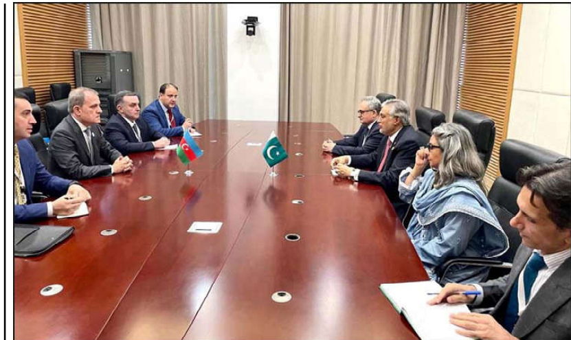
BANJUL: Deputy Prime Minister and Foreign Minister Senator Mohammad Ishaq Dar held a bilateral meeting with Foreign Minister of Republic of Azerbaijan Jeyhun Bayramov, on the sidelines of the 15th OIC Islamic Summit Conference.

ISLAMABAD (INP): Jamaat-e-Islami emir Hafiz Naeem Rehman on Sunday held a meeting with Iranian ambassador Reza Amiri-Moghaddam in Islamabad. Pak-Iran relations, the Palestine issue and matters of mutual interest were discussed during the meeting. The Iranian diplomat congratulated Rehman on assuming the office of JI emir and extended his warm wishes. The ambassador lauded the JI's intra-party election and termed it truly democratic. He also extended an invitation to JI emir to visit Iran. The meeting was also