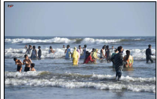
KARACHI: People enjoy bathing at the Sea View picnic point after the heat increases in the city.

ISLAMABAD (INP): The federal government has decided to keep at least one passport office open 24/7 in both Lahore and Karachi to provide ease to the people, Interior Minister Mohsin Naqvi said on Sunday. "This will make it easier for everyone to access passport services anytime," he said in a social media post on X. With the implementation of this measure, individuals residing in Lahore and Karachi will have the flexibility to access passport services outside of regular business hours, accommodating diverse schedules and minimizing any inconvenience caused by time constraints.