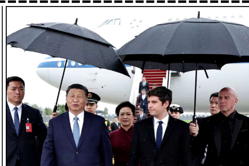
France's Prime Minister Gabriel Attal, China's President Xi Jinping and his wife Peng Liyuan walk under umbrellas upon their arrival for an official two-day state visit, at Orly airport, south of Paris.

On Tuesday, Russian officials said Ukraine had attacked Crimea with ATACMS in an attempt to pierce Russian air defences of the annexed peninsula but that six had been shot down.