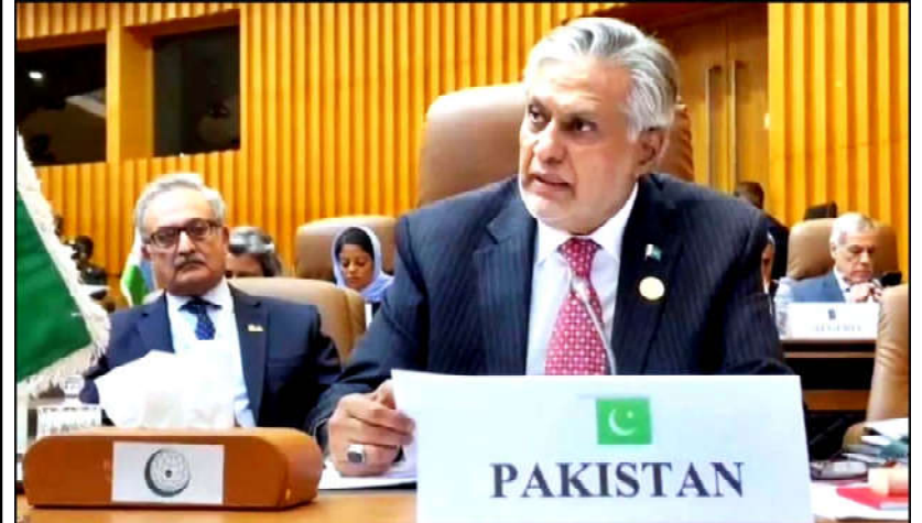
BANJUL: Deputy Prime Minister and Finance Minister Senator Muhammad Ishaq Dar addressing 15th OIC Islamic Summit Conference.

Condemning the rising trend of Islamophobia and discrimination against Muslims in various parts of the world, the deputy prime minister and foreign minister urged the OIC to formulate a joint strategy to work with global social media platforms to harmonize their application of content regulation policies for blasphemous, anti-Islamic and Islamophobic content.