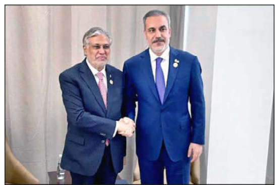
BANJUL: Deputy Prime Minister and Foreign Minister Senator Mohammad Ishaq Dar met with Turkish Foreign Minister Hakan Fidan, on the sidelines of the 15th OIC Islamic Summit Conference.

press release said. The summit is being held in light of the dangerous and unprecedented developments taking place in the Palestinian cause, especially the crimes of the brutal Israeli military aggression against the Palestinian people. The OIC secretary general announced the establishment of a media observatory at the OIC General Secretariat to document and highlight, within the media, the numbers of martyrs, wounded, detainees, and various crimes of the Israeli occupation. The OIC is also concurrently working towards activating the Legal Observatory to document Israeli crimes, in line with the decision of the recent Arab-Islamic Summit in Riyadh. Furthermore, the secretary general reaffirmed the OIC's commitment to addressing pressing political and humanitarian challenges facing the OIC Member States.