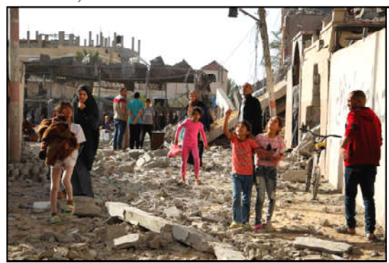
Palestinian children look up as they walk at the site of an Israeli strike on a house, amid the ongoing conflict between Israel and Hamas, in Rafah, in the southern Gaza Strip.

In addition to the tens of thousands forced from their homes, Brazil's civil defence agency said more than a million people lacked access to drinking water and it described the damage as incalculable. Some 15,000 people are now living in shelters.