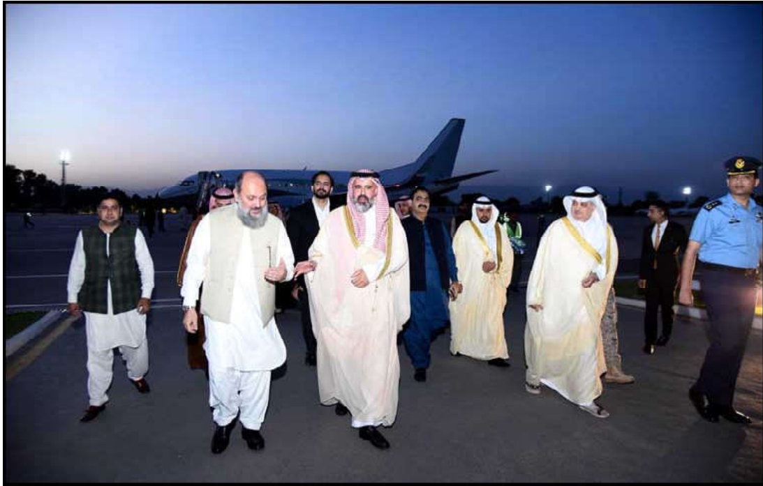
Federal Minister Jam Kamal Khan receiving a high-level Saudi business delegation upon its arrival.

Ph: 2841470/2841473 Vol: XIX No. 88, Shawwal 27, 1445 AH Monday May 06, 2024, Pages 04, Price Rs.15