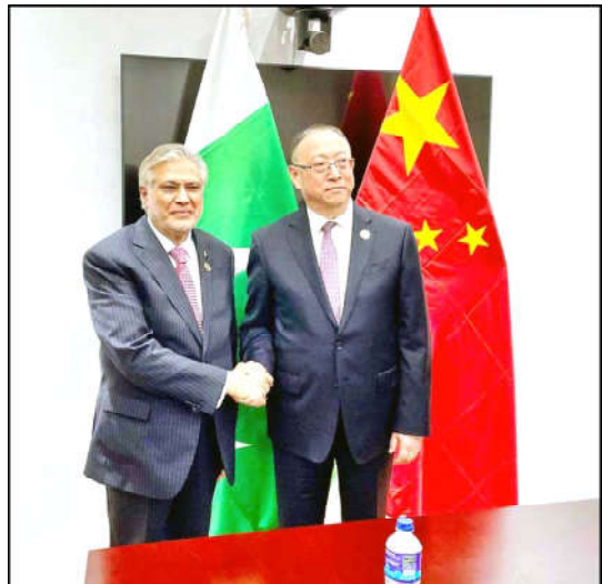
BANJUL: Deputy Prime Minister and Foreign Minister Senator Mohammad Ishaq Dar met with Vice Chairman of the Standing Committee of the National People's Congress of China Zheng Jianbang, on the sidelines of the 15th OIC Islamic Summit Conference.

Balochistan must also urgently enact laws protecting journalists' safety and establish a safety commission to ensure that perpetrators of such attacks are held to account, it maintained.