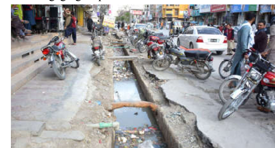
QUETTA: A view of the open sewerage nullah in front of shop may cause any mishap that need the attention of concerned authorities.