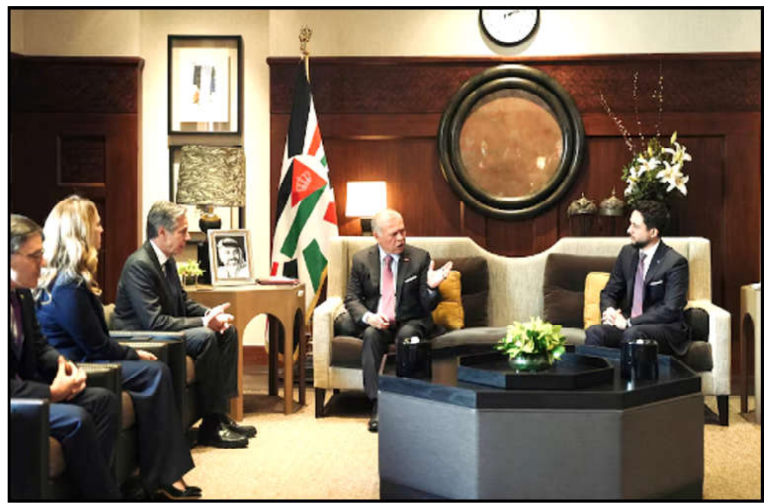
U.S. Secretary of State Antony Blinken meets with Jordan's King Abdullah II and Jordan's Crown Prince Hussein in Amman, Jordan

trary: we are working day and night for a two-state solution," the ministry said. "We are the largest donor of humanitarian aid to the Palestinians. We are working to ensure that aid reaches the people in Gaza." But it added that Israel has the right to defend itself and said more than 100 hostages are still being held by Hamas, "which is abusing the people of Gaza as shields." The court noted that Germany had granted only four export licenses to Israel for weapons of war since the start of the conflict, two for training ammunition and one for test purposes, as well as one consignment of "3,000 portable anti-tank weapons."