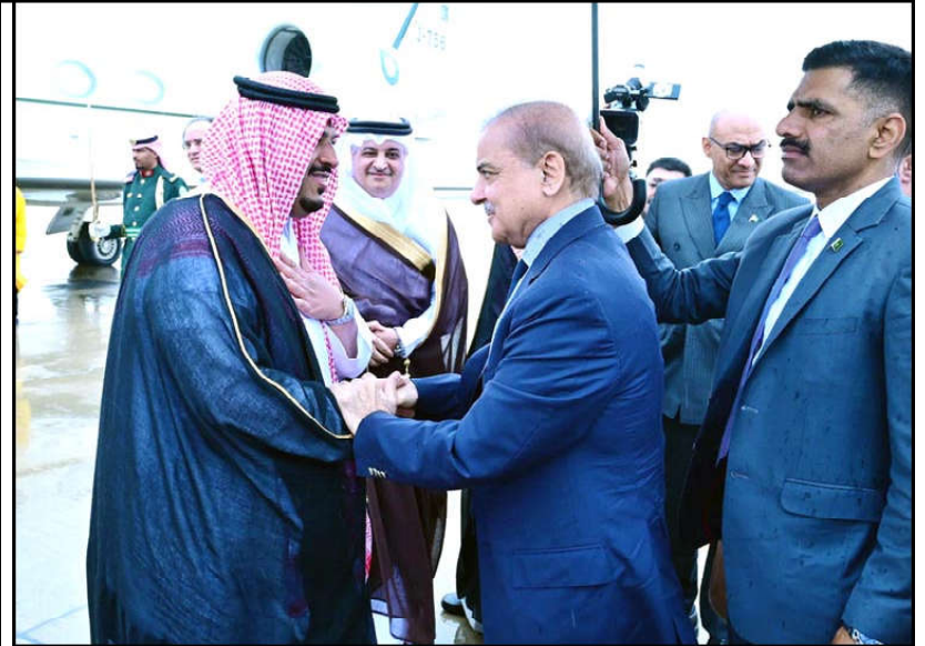
RIYADH: Prime Minister Muhammad Shehbaz Sharif departs for Pakistan after participating in a special meeting of the World Economic Forum.

justice, the bureaucracy is very weak and has very limited room or choices to deal with interference. However, it isn't the case with judiciary which enjoys all the necessary powers and the tools to exercise the same. Other powers will grow stronger, if the parliament isn't made powerful, the chief justice warned and mentioned that it was a natural consequence of forming JITs (joint investigation teams) and appointment of monitoring judges. The country's top judge during the hearing also stopped the attorney general from mentioning the Supreme Judicial Council (SJC), saying the Supreme Court and the SJC were two different entities.