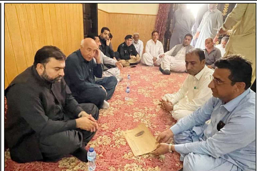
TURBAT: A delegation of Anjuman-e-Tajiranj District Kech meeting with Balochistan Chief Minister Mir Sarfraz Ahmed Bugti.

A total of 560,552,783 shares valuing Rs 25,730 billion were traded during the day as compared to 613,314,754 shares valuing Rs 26,314 billion the last day.