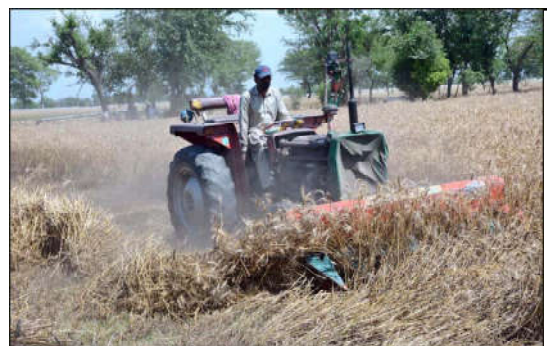
FAISALABAD: Farmer busy in cutting wheat crop with the help of tractor in his field.

He expressed his gratitude to the Development Director of the British High Commission in Pakistan for the continued support and assistance provided to the people of Pakistan.