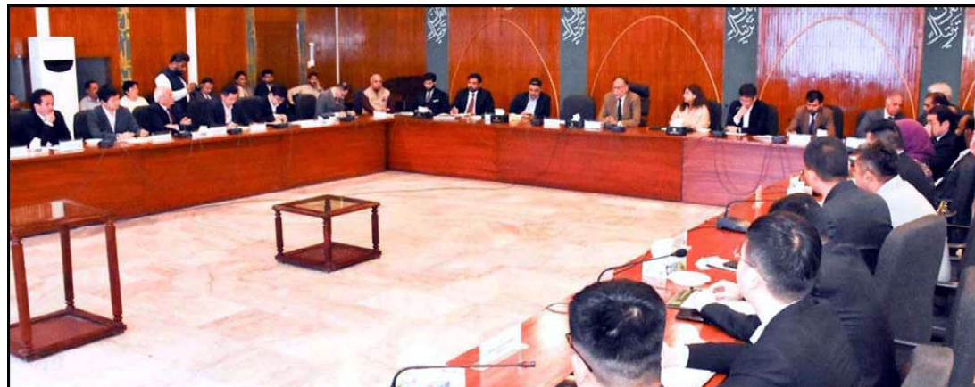
ISLAMABAD: Federal Minister for Planning, Development & Special Initiatives, Ahsan Iqbal chairs a meeting with Chinese enterprises working in Pakistan to discuss their challenges and recommendations for CPEC Phase II projects.

He said that the labourers have key role and status in economic development of any society and country. He said that the role of labourers can't be ignored in development and industrialization of the countries. He said that the skilled human resource would also put us on path of development. The Chief Minister said that the government is fully aware of the importance of technical education and training.