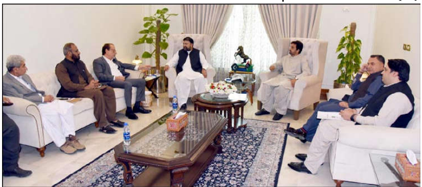
QUETTA: President Arts Council Karachi Ahmed Shah meeting with Chief Minister Balochistan Mir Sarfaraz Ahmed Bugti. Provincial Finance Minister Mir Shoaib Naushwari is also present.

A total of 73 solar-powered street lights have been installed at various locations where public activities are concentrated.