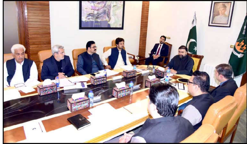
QUETTA: Chief Minister Balochistan Mir Sarfraz Ahmed Bugti presiding over a meeting of Livestock & Dairy Development Department

the issue of missing persons in the Parliament. The Chief Minister strongly believes that not a single citizen should be disappeared. He said that there is a dispute on the number of missing persons. The Chief Minister said that the present parliament would take political responsibility. However, the Parliament may prepare recommendations for resolving the issues of Balochistan, he pleaded. In this regard, he proposed to prepare course of action by forming a think tank. The Chief Minister on the occasion made it clear that no operation is going on in the province. However, smart targeted action would be taken against the terrorists where needed so.