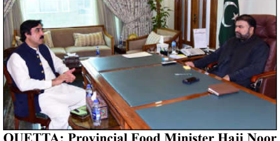
QUETTA: Provincial Food Minister Haji Noor Muhammad Dumar meeting with Chief Minister Balochistan Mir Sarfaraz Ahmed Bugti

He noted that the farmers were coerced to sell wheat in the open market at a much lower than the officially fixed rate owing to the inept and incompetent imposed government's faulty and anti-poor policies with regard to the procurement of wheat.