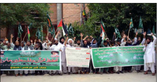
QUETTA: Activists of Tehreek-e-Labbaik (TLP) are holding protest demonstration against desecration of Holy Quran in Sweden, at Quetta press club.

launched in 2019, has so far been implemented in five countries including Pakistan, Malaysia, Indonesia, Morocco and Bangladesh.