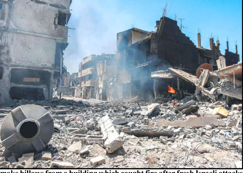
Smoke billows from a building which caught fire after fresh Israeli attacks in the Zaytoun neighbourhood of Gaza City.

they go into Rafah, ... I'm not supplying the weap-ons," Biden told CNN in an interview on Wednesday.