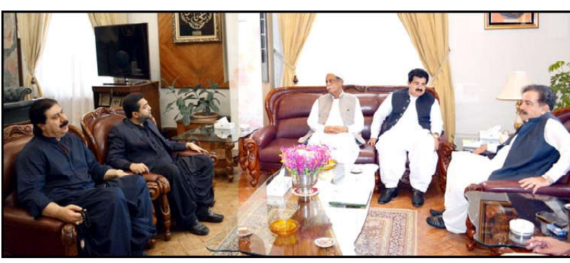
QUETTA: Former Chairman Senate, MPA Muhammad Sadiq Sanjrani, Senator Manzoor Khan Kakar, Provincial Minister Ziaullah Lango and former Speaker Balochistan Assembly Mir Jan Muhammad Jamali meeting with Governor Balochistan Sheikh Jaffar Khan Mandokhail

The suspended women MPAs include sion of Pakistan (ECP) had rejected the party's plea depriving it of reserved