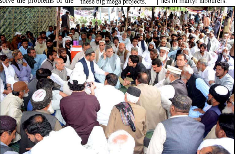
QUETTA: Deputy Commissioner, Saad Bin Asad listening the problems and demands of Zamindar Action Committee during their protest, outside Balochistan Assembly in Quetta.

role of labourers in development of any civilized society. The killing of a person means killing of a bread earner of a family, he added. The Governor directed the law enforcement agencies to arrest the elements involved in the incident and taken them to task. e expressed condolence and solidarity with the bereaved famithese big mega projects.