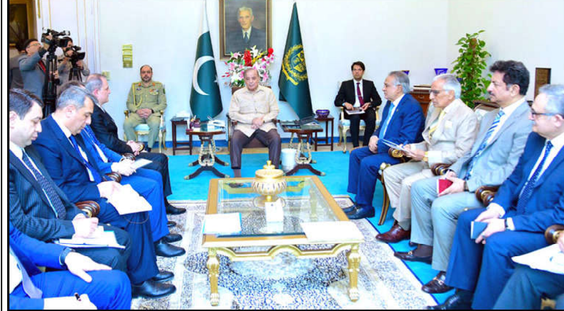
ISLAMABAD: Minister of Foreign Affairs of Azerbaijan Jeyhun Bayramov calls on Prime Minister Muhammad Shehbaz Sharif.

It, however, noted that try, and that without swift and transparent dispensation of justice to the culprits and establishing the rule of law, stability in Pakistan would ever remain hostage to the machinations of such elements. The conference was attended by Corps Commanders, Principal Staff Officers, and all For-mation Commanders of Pakistan Army.