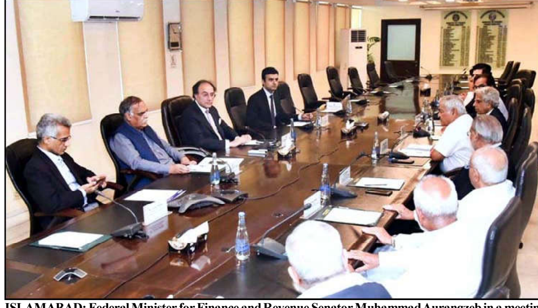
ISLAMABAD: Federal Minister for Finance and Revenue Senator Muhammad Aurangzeb in a meeting with the representatives from Pakistan Association of Large Steel Producers (PALSP), Pakistan Steel Melters Association (PSMA), Pakistan Steel Re-Rolling Mills Association (PSRMA) and Pakistan Steel Pipelines Association (PSPA).