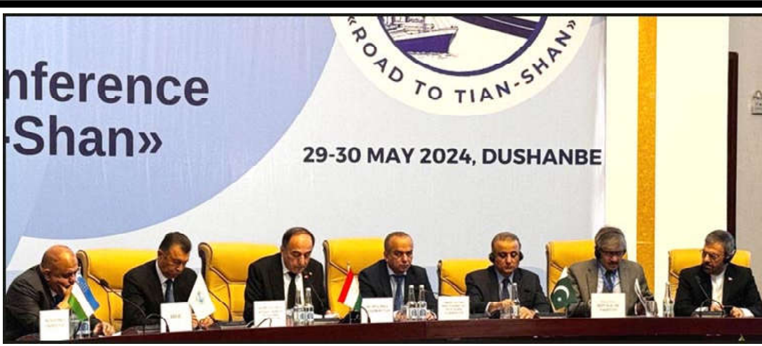
Federal Minister for Communications, Investment Board and Privatization, Abdul Aleem Khan addressing an International Conference in Dushanbe.