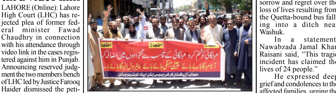
QUETTA: APCA Balochistan activates hold protest rally in favor of their demands.