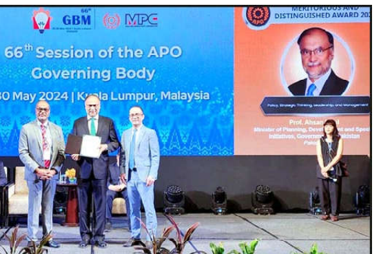
KUALALUMPUR: Planning Minister Prof. Ahsan Iqbal receiving the APO Meritorious and Distinguished Award 2024 by the Asian Productivity Organisation (APO) in Malaysia.

ISLAMABAD (APP): As the fiscal year 2023-24 is nearing a close, the economy of the country has been showing signs of resilience and growth as indicated by key economic indicators, the finance ministry said in a recent report released here Wednesday.