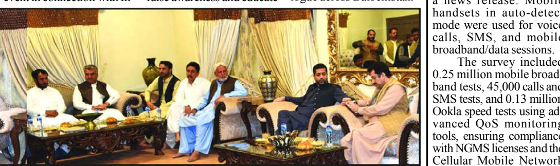
KALAT: Home Minister Mir Ziaullah Langi presiding over a meeting regarding development projects and law and order situation

QUETTA (APP): Speakers on Wednesday highlighted critical role of improved Menstrual Hygiene Management (MHM) in enhancing women's and girls' well-being and they asserted on the collaborative efforts to improve the lives of millions of women and girls of Balochistan.