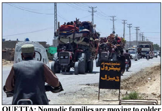
OUETTA: Nomadic families are moving to colder areas after the heat wave has increased in Sindh, at Western Bypass in Quetta.

that the border should remain open at Mir Jawa, Taftan, Gabd and Raimdan so that the people may benefit from the border trade.