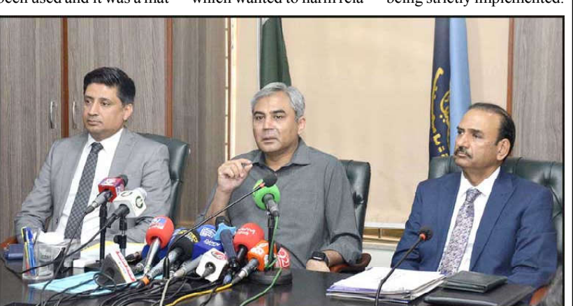
LAHORE: Interior Minister Mohsin Naqvi addressing a Press conference at FIA regional office.

accused of the incident had been arrested, he said. He said that Chinese security was very important and new standard operating procedures (SOPs) had been made in this regard and were being strictly implemented