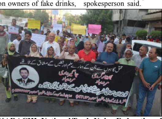
KARACHI: National Trade Union Federation of Pakistan protesting for the arrest of the killers of Nasrullah Gadani.