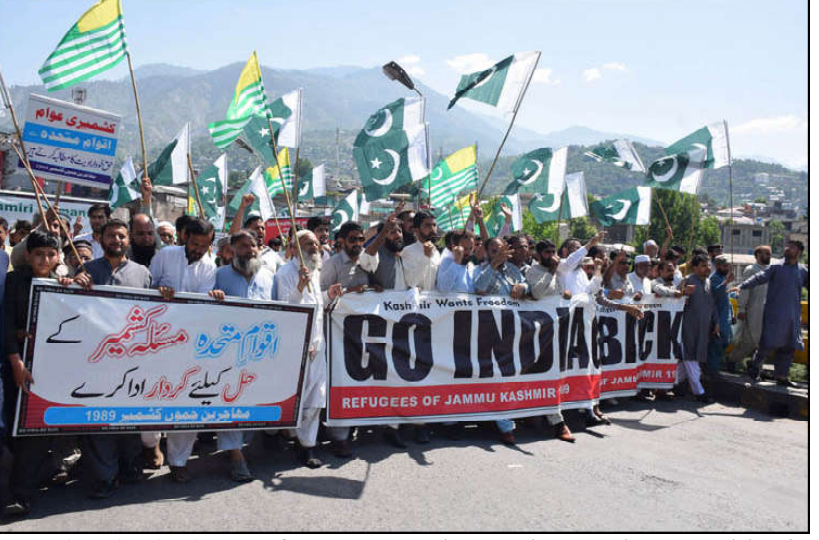
MUZAFFARABAD: Refugees protesting against Indian atrocities in Occupied Kashmir for the sake of independence by raising the flags of Pakistan and Kashmir at Azadi Chowk.

The organization and harmony in the universe exemplify these principles. By adopting these principles of organization and mutual cooperation, society can achieve peace and progress, he added.