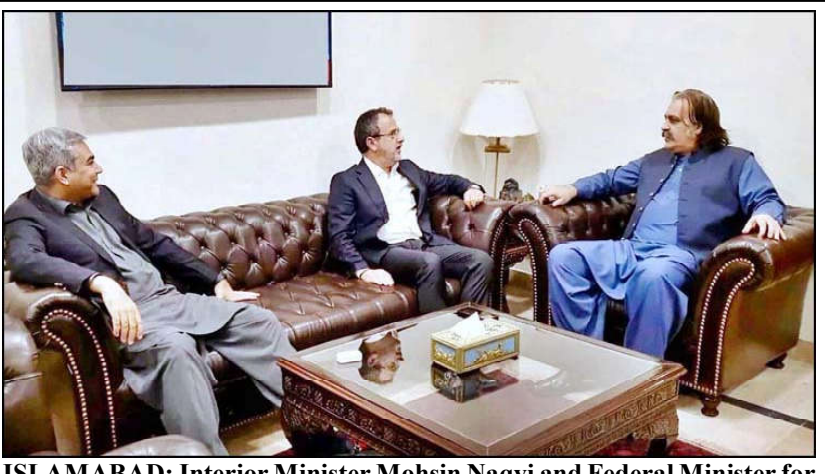
ISLAMABAD: Interior Minister Mohsin Naqvi and Federal Minister for Energy Sardar Awais Ahmad Khan Laghari in a meeting with Chief Minister Khyber Pakhtunkhwa Ali Amin Gandapur.

facilities for visitors. Spain's rich cultural heritage, stunning landscapes, and lively atmosaid that through the MNCH sphere make it a favorite among tourists seeking a program, despite the limited resources, doctors, nurses, lady mix of history and moderhealth workers, community nity. The third place is Japan, the only Asian counmidwives have been deployed in the maternity and child detry to make it into the top partments.