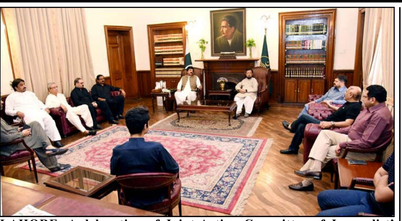
LAHORE: A delegation of Joint Action Committee of Journalist Organizations called on Punjab Governor, Sardar Saleem Haider Khan at Governor House.