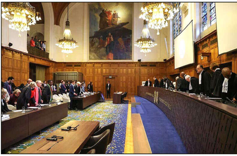
Delegates attend a ruling on South Africa's request to order a halt to Israel's Rafah offensive in Gaza as part of a larger case accusing Israel of genocide at the International Court of Justice in The Hague.

TUNIS: Hundreds of people demonstrated in Tunis on Sunday in support of President Kais Saied amid widespread criticism at home and abroad after a wave of arrests that included journalists, activists and lawyers. The European Union, France and the UN High Commissioner for Human Rights expressed concern at the arrests and at a police raid on the headquarters of the bar association this month in which two lawyers critical of the president were detained. Police this month arrested 10 people, including journalists, lawyers and officials of civil society groups, in what was described as crackdown by Amnesty International and Human Rights Watch.