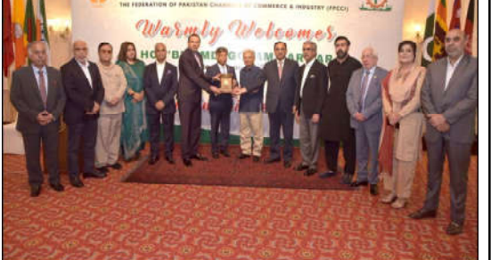
After assuming the Chair of SG, SAARC in SAARC Secretariat Kathmandu Nepal, Excellency, lauded the commendable efforts of the SAARC Apex and recognized bodies in taking regional agenda forward. He pledged relentless efforts to fortify cooperation among Member States,