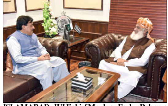
ISLAMABAD: JUI F chief Maulana Fazlur Rehman met with deputy chairman senate Syedaal khan Nasir and discussed overall political situation, in the Federal Capital.

ISLAMABAD (INP): The Election Commission of Pakistan (ECP) decided to give three salaries as bonus to its officers and employees. According to letters dispatched to the provincial election commissioners, the ECP has informed that employees and officers will get three basic salaries as bonus. Those who are facing departmental inquiries and moved to services tribunals or judiciary will not be eligible for the bonus, the ECP letter stated. The ECP has already given two salary bonuses to its employees in March after conducting the general elections in February.