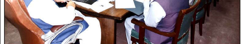
ZIARAT: Chief Minister Balochistan Mir Sarfraz Ahmed Bugti presiding over meeting of Governing Body of Ziarat Development Authority

The court's president, Nawaf Salam, read out the ruling, as a small group of pro-Palestinian protesters demonstrated outside.