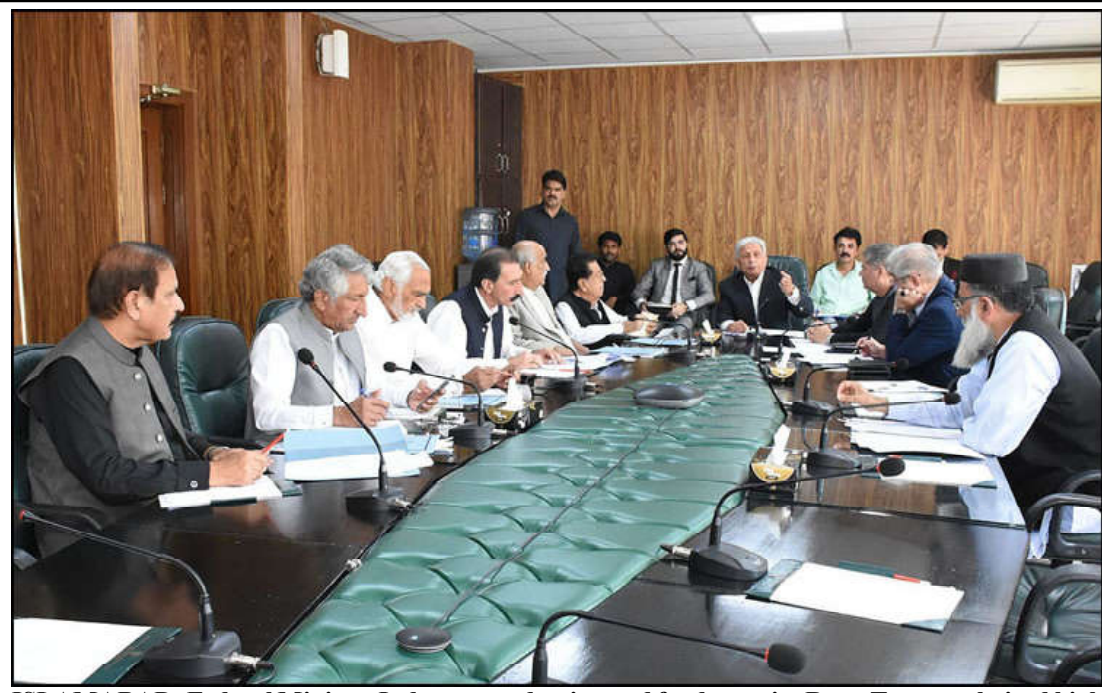
ISLAMABAD: Federal Minister Industry production and food security Rana Tanveer chaired high level meeting regarding supply chain and prices of fertilizer.