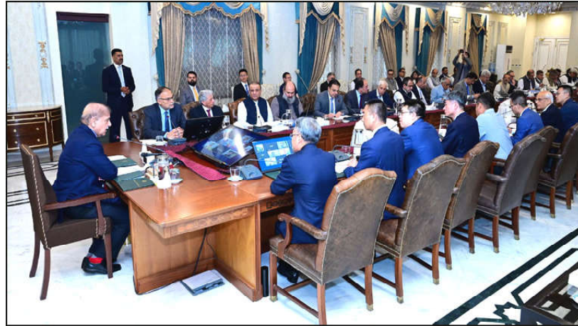
ISLAMABAD: A delegation of representatives from Chinese companies in Pakistan meeting with Prime Minister Shehbaz Sharif.

He desired that Gwadar Port Authority would become functional as soon as possible to attract national and international investors to Balochistan. The chairman stated that they have presented their stance on the Gwadar Shipyard master plan on the relevant forum and, in that regard, the Chief Minister Balochistan had sought a report from the Gwadar administration officials.