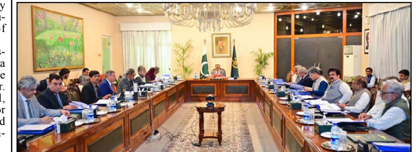
Deputy Prime Minister Senator Mohammad Ishaq Dar Chairs the First meeting of the Committee on Medical Education at Ministry of Foreign Affairs Islamabad.

ISLAMABAD (INP): The Election Commission of Pakistan (ECP) decided to give three salaries as bonus to its officers and employees. According to letters dispatched to the provincial election commissioners, the ECP has informed that employees and officers will get three basic salaries as bonus. Those who are facing departmental inquiries and moved to services tribunals or judiciary will not be eligible for the bonus, the ECP letter stated. The ECP has already given two salary bonuses to its employees in March after conducting the general elections in February.