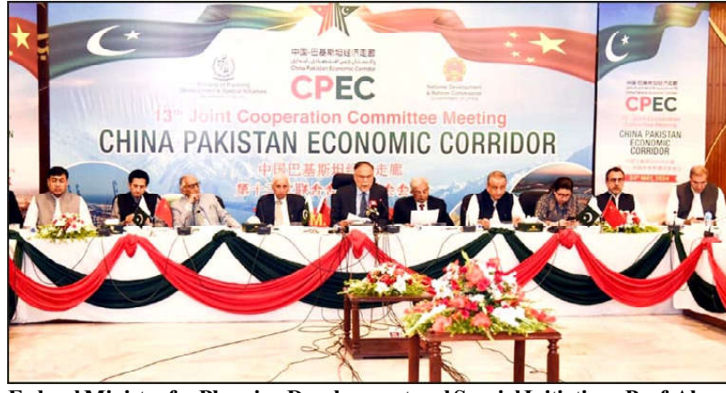
Federal Minister for Planning Development and Special Initiatives, Prof. Ahsan Iqbal co-chairing the 13th JCC meeting with China on CPEC in Islamabad.

lions. "In view of the last notice dated May 10, the action is in accordance with the law," the minister said. He elaborated that he had talked to the chairman of the Capital Development Authority (CDA), who confirmed that the process had been ongoing for the past four years due to the violations. The final notice was issued to ensure compliance with CDA directions, he added. The minister further explained that reminders were issued to the political party regarding two floors constructed without CDA approval and the misuse of a public place for parking containers.