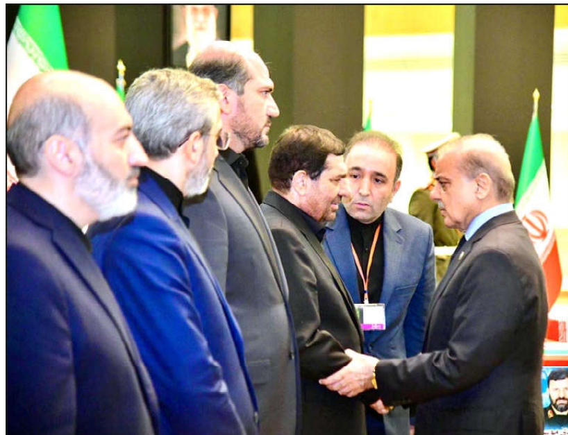
TEHRAN: Prime Minister Muhammad Shehbaz Sharif meets Acting President of Islamic Republic of Iran, Dr. Mohammad Mokhbar and offers condolence over the sad demise of Iranian President Dr. Seyyed Ebrahim Raisi and his companions.