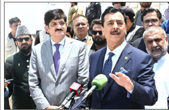
KARACHI: Acting President Syed Yusuf Raza Gillani talking to media persons during his visit at Mausoleum of Quaid-e-Azam Muhammad Ali Jinnah.