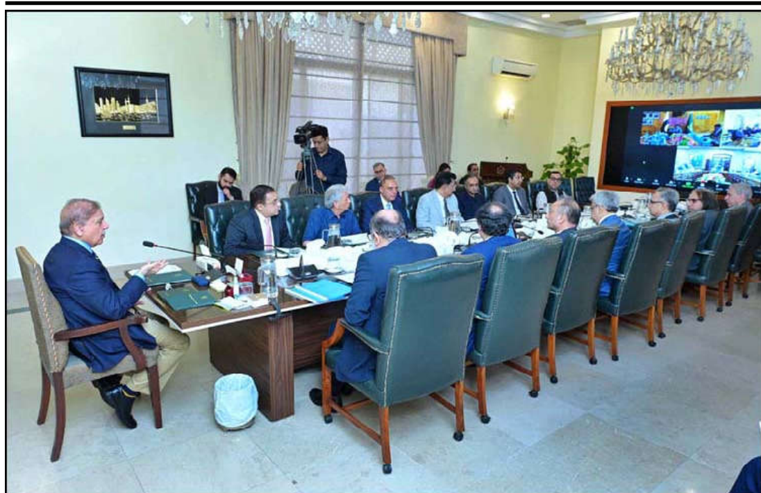
ISLAMABAD: Prime Minister Muhammad Shehbaz Sharif chairs a meeting on Gemstones.