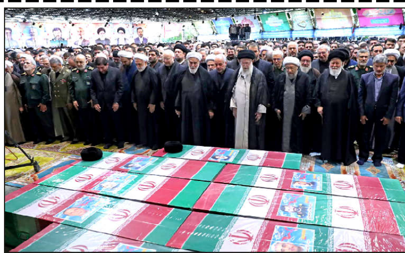
Iran's Supreme Leader Ayatollah Ali Khamenei performs prayer at a funeral for victims of helicopter crash that killed Iran's President Ebrahim Raisi, Foreign Minister Hossein Abdollahian and others, in Tehran, Iran.