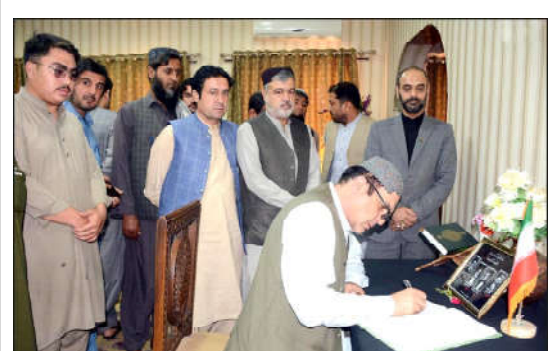
QUETTA: Balochistan Assembly's Speaker, Abdul Khaliq Achakzai pen message in a condolence book placed at Consulate General of the Islamic Republic Iran following the death of Iranian President Ebrahim Raisi.

operations, during an intelligence based operation on May 14, Major Babar Khan also embraced, Shahadat, while fighting gallantly. "Pakistan's Security Forces are determined and remain committed to secure the borders and ensure safety of its citizens against the scourge of terrorism," the ISPR said. It added that Pakistan has consistently been asking Interim Afghan Government to ensure effective border management on their side of border. "Interim Afghan Government is expected to fulfill its obligations and deny the use of Afghan soil by terrorists for perpetuating acts of terrorism against Pakistan," the ISPR said.