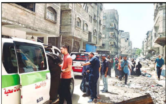
Palestinians evacuate Kamal Adwan hospital following an Israeli strike in Beit Lahia, the northern Gaza Strip.

Monitoring Desk KINSHASA: The DR Congo military on Sunday thwarted an attempted coup near the offices of President Felix Tshisekedi in Kinshasa involving "foreigners and Congolese", the army spokesperson said. The coup bid took place in the early hours of the morning outside the residence of economy minister Vital Kamerhe, in the Gombe area in the north of the capital, near the Palais de la Nation which houses the president's offices. "An attempted coup d'etat has been stopped by the defence and security forces."