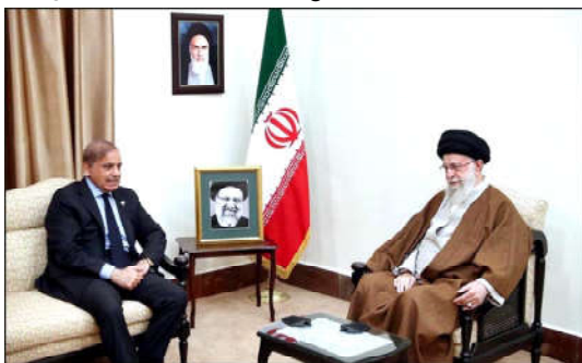
TEHRAN: Prime Minister Muhammad Shehbaz Sharif meets the Supreme Leader of Iran, Ayatollah Seyyed Ali Khamenei, the Leader of Islamic Revolution.

adding that Pakistan will always stand with China and safeguard China's core interests. Commenting on the development of Gwadar Port, a starting point of the China-Pakistan Economic Corridor (CPEC), Zardari said a lot of work had been done at the Gwadar Port since the launch of the CPEC 11 years ago, noting that the Port would always welcome investors from all over the world. Zardari said Pakistan is encouraging more schools to adopt the Chinese language into their compulsory curriculum.