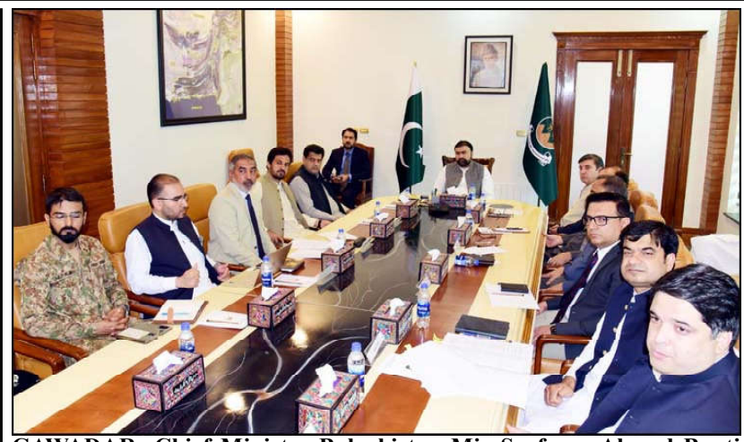
GAWADAR: Chief Minister Balochistan Mir Sarfaraz Ahmed Bugti presiding over a meeting regarding Gwadar Shipyard.