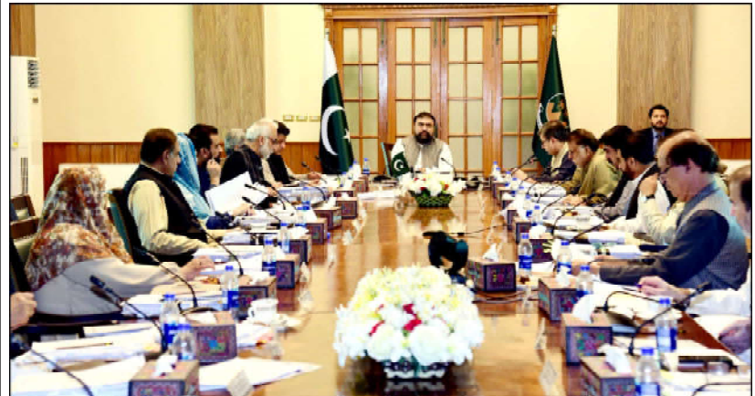
QUETTA: Chief Minister Balochistan Mir Sarfraz Ahmed Bugti chairing Provincial Cabinet meeting