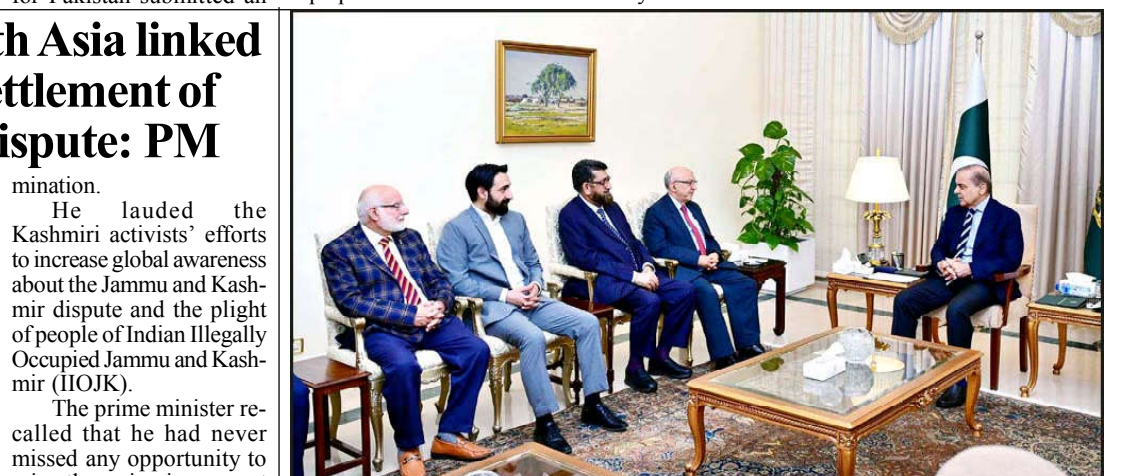
ISLAMABAD: A delegation of Kashmiri Diaspora activists calls on Prime Minister Muhammad Shehbaz Sharif.

It may be mentioned here that the government of Balochistan declared Tuesday, 21st as a day of national mourning in the province, in expression of fraternal solidarity on behalf of the government and people of province with the government and people of Iran on the sad demise of Iranian President and other dignitaries.