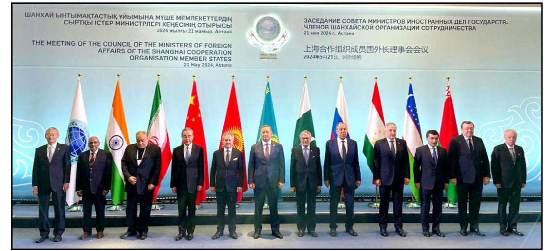
ASTANA: Official Group Photo of the Foreign Ministers attending the SCO Council of Foreign Ministers taking place at Astana, Kazakhstan. Deputy Prime Minister and Foreign Minister Senator Mohammad Ishaq Dar is leading the Pakistan delegation.

He explained Pakistan's priorities as the current Chair of SCO Council of Heads of Government (CHG) which included promoting connectivity, transport links, youth empowerment, poverty alleviation, and enhanced practical cooperation among SCO member states. The deputy prime minister called for upholding international law and the UN Charter, emphasizing the people's right to self-determination and peaceful settlement of longstanding disputes in accordance with the relevant UN Security Council resolutions. He stressed the need to combat the menace of terrorism through collective and cooperative approaches including by addressing its root causes. He urged the rejection of myopic and self-serving interests to use the mantra of terrorism for political gains. Ishaq Dar strongly condemned the barbaric Israeli onslaught in Gaza, which had resulted in the killings of over 35,000 innocent civilians, mostly women and children. He reiterated Pakistan's firm call for an unconditional and urgent ceasefire and unhindered provision of humanitarian assistance. He also emphasized the need to realize the two-state solution for durable peace and stability. On the Afghanistan situation, he called on the international community to meaningfully engage with the Interim Afghan Government (IAG) for the genuine economic and development needs of Afghanistan and urged the IAG to ensure that Afghan soil was not used for terrorism against any country.