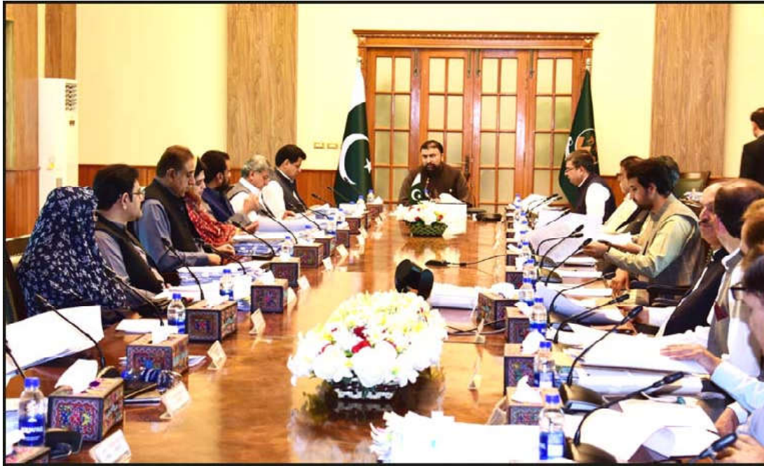
QUETTA: Chief Minister Balochistan Mir Sarfraz Ahmed Bugti chairing meeting of Provincial Cabinet

Ph: 2841470/2841473 Vol: XIX No. 327, Zeeqad 13, 1445 AH Wednesday May 22, 2024, Pages 04, Price Rs.15