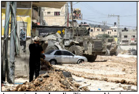
A man stands as Israeli military machineries operate in Jenin, in the Israeli-occupied West Bank.

ICC prosecutor Karim Khan said in a statement issued after more than seven months of war in Gaza that he had reasonable grounds to believe the five men "bear criminal responsibility" for alleged war crimes and crimes against humanity. US President Joe Biden called the legal step "outrageous", while Secretary of State Antony Blinken said it could jeopardize negotiations on a hostage deal