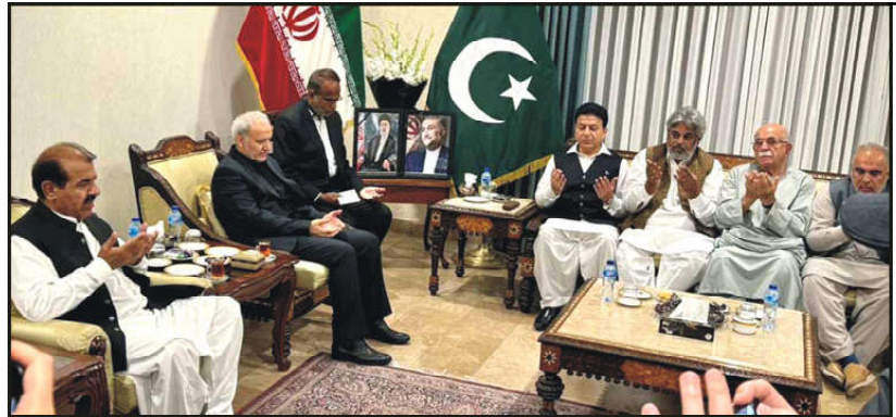
ISLAMABAD: Chief of Tehreek Tahafuz Ain-e-Pakistan Mehmoond Khan Achakzai along with a delegation offering fatiha for departed soul of Iranian President Dr. Seyyed Ebrahim Raisi at Iranian Embassy.