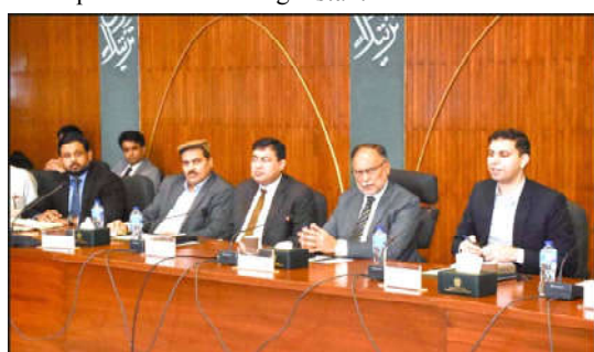
ISLAMABAD: Federal Minister for Planning, Development and Special Initiatives Ahsan Iqbal chairing a review meeting on CPEC Phase 2 and the 13th Joint Cooperation Committee (JCC) at the Ministry of Planning, Development & Special Initiatives.

Addressing the security concerns for Chinese personnel, Federal Minister Ahsan Iqbal asserted that ensuring the protection and safety of Chinese personnel, projects, and programs is a top priority for the Government of Pakistan.