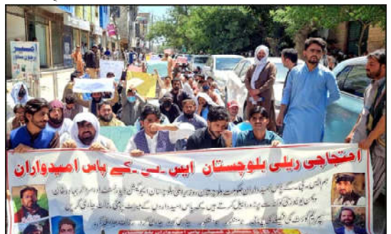
QUETTA: Passed candidates of S-B-K Central Committee are holding protest demonstration for appointment letters, at Quetta press club.