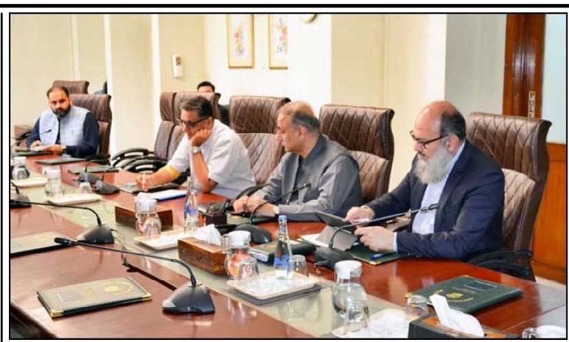
ISLAMABAD: Federal Minister for Commerce, Jam Kamal Khan and Federal Minister for Communication, Abdul Aleem Khan, jointly chairing a cabinet committee dedicated to promoting Pakistani enterprises in global markets.

Khawaja Asif quoted ex Chairman FBR Shabbir Zaidi that during his tenure when FBR planned to implement tax on the cigarette industry, at that time Speaker National Assembly Asad Qaiser pressurized Shabbir Zaidi not to implement taxes on the cigarette industry. The NUST research report on the tobacco sector revealed that Pakistan is losing 310 billion rupees annually due to tax evasion in the tobacco sector.