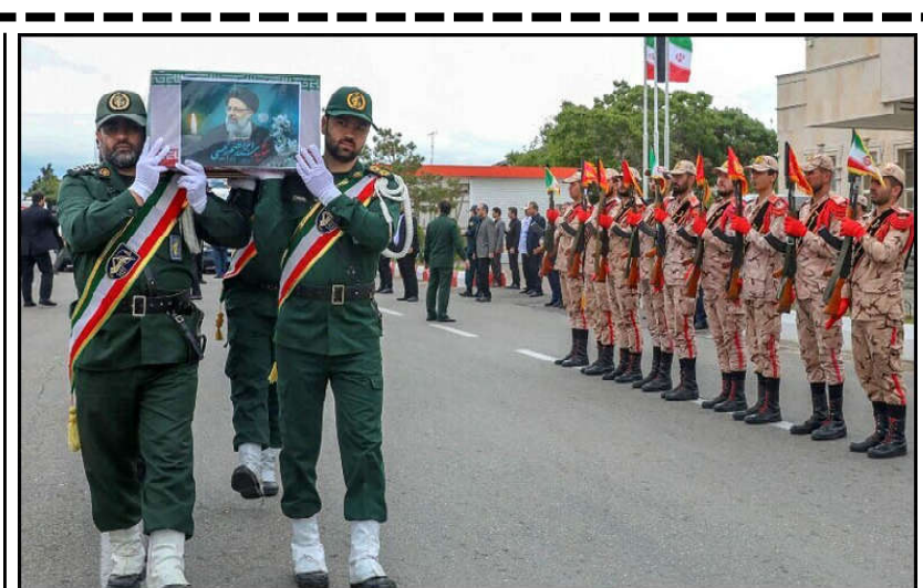
This handout picture provided by the Iranian president's office shows honour guards carrying the coffin of late president Ebrahim Raisi during a funeral procession in Tabriz, the capital of Iran's East Azerbaijan province.

They walked behind a lorry carrying the coffins of Raisi and those who died with him, who also included foreign minister Hossein Amir-Abdollahian. "We, the members of the government, who had the honour to serve this beloved president, the hardworking president, pledge to our dear