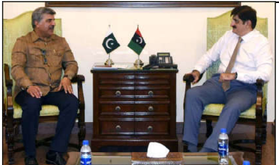
KARACHI: Sindh Chief Minister, Syed Murad Ali Shah exchanges views with Deputy Speaker National Assembly, Syed Ghulam Mustafa Shah during meeting held at CM House in Karachi.

He further said that public issues will be solved on priority basis. Transparency and merit are being prioritized in the Revenue and Estate Department while accountability will be ensured adding that decisions will be made in the department only on merit.