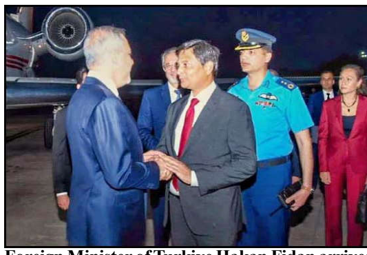
Foreign Minister of Turkiye Hakan Fidan arrives in Islamabad. He was received by Additional Foreign Secretary (Afghanistan & West Asia) Ambassador Ahmed Naseem Warraich at Nur Khan Airbase.

The ambassador of Pakistan Zaigham apprised the prime minister of his meeting with the Kyrgyz deputy foreign minister. According to Kyrgyz authorities, the situation was under control and no new incident of violence took place in the last two days. Security measures had been enhanced and the foreign students including Paki-