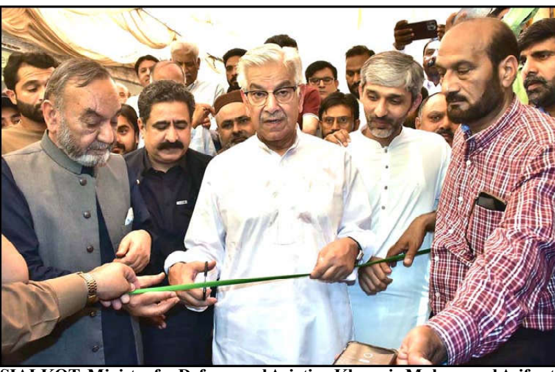
SIALKOT: Minister for Defense and Aviation Khawaja Muhammad Asif cutting ribbon to inaugurate "Chief Minister Punjab Special Initiative Clinic on Wheel".

'Likewise, the establishment of the instrument of Special Drawing Rights (SDRs) of $650 billion by the IMF led to the provision of additional resources to the developing countries in navigating the economic challenges," the Pakistani