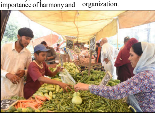
LAHORE: Consumers buying vegetables and fruits at Shadman Sunday market in the provincial capital.

He reaffirmed the management's commitment to resolving workers' chief guest at the highlighting that employees ceremony, emphasized the are the backbone of the