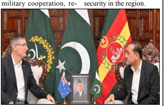
RAWALPINDI: Chief of Defence Forces Australia General Angus J. Campbell meeting with Chief of Army Staff (COAS) General Syed Asim Munir

The ISPR added that the meeting concluded with both leaders reaffirming their dedication to continuing collaboration on various defence-related initiatives. aiming to bolster peace and security in the region.