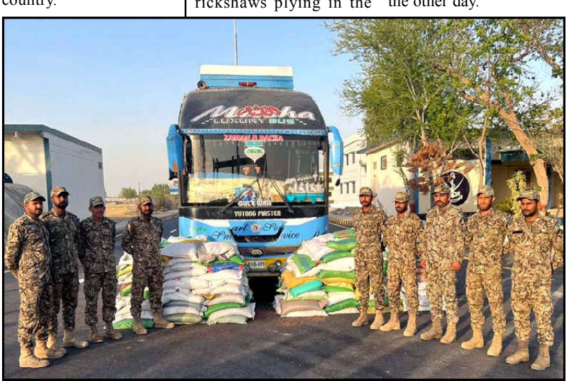
HUB: Pakistan Coast Guard Officials are exposing huge quantity of recovered Chew Tobacco and betel nuts (Supari/Chaliya) seized during checking of passenger buses on Uthal Coast Guard Check Post, to media persons.

Besides, the ban has been imposed on new rickshaws in the Quetta division by the Commissioner, it was mentioned in the official hand out issued here the other day.