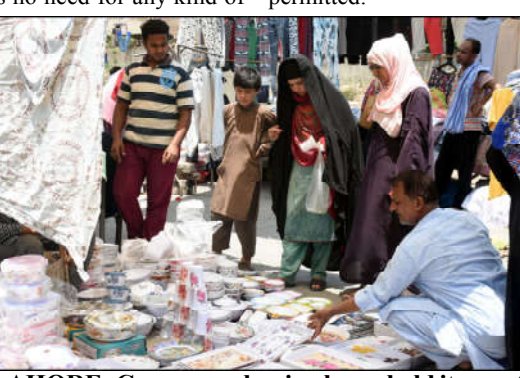
LAHORE: Consumers buying household items at Shadman Sunday market in the provincial capital.

also clarified that some transportation of wheat elements are linking a letter written by the federal government to prevent smuggling of various items with the transportation of wheat, which is based on a complete misunderstanding. He said that in the light of the instructions of the federal government and the Punjab home department, letters were written for the appointment of vigilant and honest staff at all check posts to stop smuggling of various items. However, delivery, purchase and sale of wheat and interprovincial and inter-district transport are fully permitted