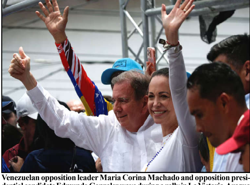
dential candidate Edmundo Gonzalez wave during a rally in La Victoria, Aragua

The main opposition CHP party, which made strong gains in municipal elections in late March, has long asked for the generals to be freed. Party leader Ozgur Ozel said on X, formerly Twitter, the decision was "late