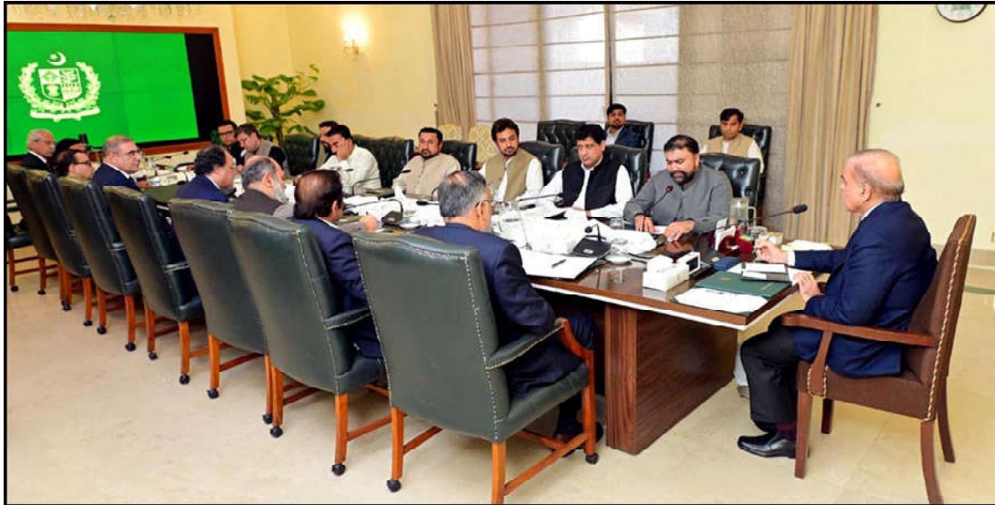
ISLAMABAD: Prime Minister Muhammad Shehbaz Sharif chairs a meeting on the matters related to Balochistan province.

Ph: 2841470/2841473 Vol: XIX No. 320, Zeeqad 05, 1445 AH Tuesday May 14, 2024, Pages 04, Price Rs.15