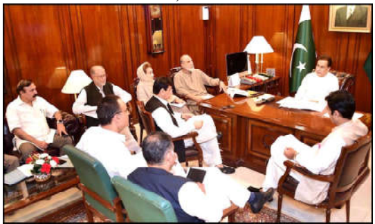
ISLAMABAD: Speaker National Assembly Sardar Ayaz Sadiq presiding the meeting to discuss matters related to present and upcoming Budget Session of National Assembly at Parliament House.

Pakistani and US senior officials emphasized the importance of expanded counter-terrorism collaboration and capacity building, including exchanges of technical expertise and best practices, investigative and prosecutorial assistance, provision of border security infrastructure and training, including the United States training of more than 300 police and frontline responders since the last Pakistan-US counter-terrorism dialogue in March 2023, and strengthening multilateral engagement such as in the UN and the Global counter-terrorism forum.