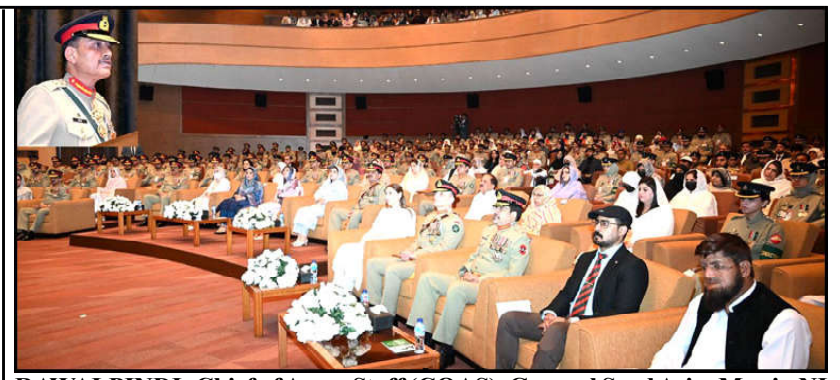
RAWALPINDI: Chief of Army Staff (COAS), General Syed Asim Munir, NI (M), addressing GHQ Investiture ceremony held at General Headquarters Rawalpindi.

Khawaja Asif said that Pakistan has faced challenges from that period onwards, indicating that democracy has struggled to take root in the country. He asserted that leaders engaged in unlawful activities must face justice. The minister accused the opposition leader in the NA of consistently supporting dictatorship and unlawful actions, mentioning that his party had previously apologized for supporting General Zia-ul-Haq and now seeks the same from opposition members. He said that the respect of all individuals associated with building a stable and developed Pakistan is crucial, and those working against the country's interests will be held accountable by the law.