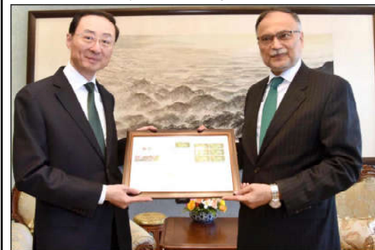
BEIJING: Federal Minister for Planning, Development and Special Initiatives Prof. Ahsan Iqbal presenting commemorative coin and postage stamp which launched to celebrate the "Decade of CPEC" to Vice Foreign Minister of China H.E. Sun Weidong at Ministry of Foreign Affairs.