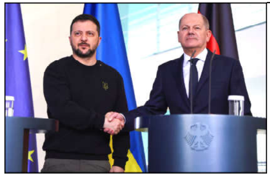
German Chancellor Olaf Scholz and Ukraine's President Volodymyr Zelenskyy shake hands at a press conference in Berlin, Germany.

Monitoring Desk KYIV: Russian forces unleashed a nighttime barrage of more than 50 cruise missiles and explosive drones at Ukraine's power grid Wednesday, targeting a wide area in what President Volodymyr Zelenskyy called a "massive" attack on the day the country celebrates the defeat of Nazism in World War II. The bombardment blasted targets in seven Ukrainian regions, including the Kyiv area and parts of the south and west, damaging homes and the country's rail network, authorities said. Three people, including an 8-year-old girl, were injured, according to officials. Russia has repeatedly pounded Ukraine's energy infrastructure during the war that is stretching into its third year and has claimed thousands of lives. By taking out the power, the