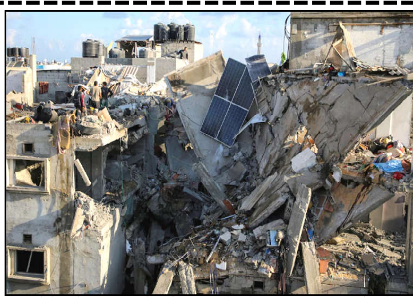
Palestinians inspect the site of an Israeli strike on a house in Rafah, in the southern Gaza Strip.

in the carefully choreographed inauguration. The West and his opponents (who are mainly in jail or abroad) cast this as 'a fig leaf of democracy', 'covering a corrupt Russian autocracy'. As the Russian elite waited in the Hall of Saint Andrew within the Grand Kremlin Palace (where the imperial throne once sat), Putin dissected documents in his office. After this, he walked down the corridors of the Kremlin saluting guards and even stopped to 'leisurely' study a picture on the wall. "We do not refuse dialogue with Western states" Putin stated after being sworn in. He added that he was ready for talks on 'security and strategic stability' but only on the condition that there was no "arrogance" on the part of the United States and its allies. Russia's chief (of more than 24 years) promised 'victory' and said all Russians were now "answerable to our thousand-year history and our ancestors." He departed from the ceremony to the music "Hail" from Mikhail Glinka's opera "A Life for the Tsar". The words "Hail, hail, my Rus! Hail you are my Russian land" rang out in the Kremlin. The original words are "Hail, hail, our Russian tsar!". "The authority of our president is higher than ever, higher than the American president, higher even than the Russian tsar. So much depends on our president" said Gennady Zyuganov (a leader of the Communist Party).