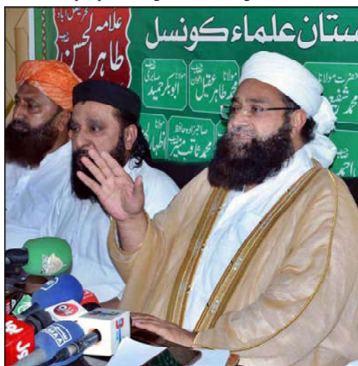
FAISALABAD: Chairman Ulema Council Hafiz Muhammad Tahir Mehmood Ashrafi addressing a press conference.

LAHORE (APP): Punjab Chief Minister Maryam Nawaz Sharif presided over a special meeting to review health reforms, here on Wednesday. The chief minister expressed her dismay over the previous government not paying any attention to the public health issues. She expressed her severe indignation over the loss of Rs. 4 billion caused to the government exchequer in the Murree hospital project. The meeting decided that legal action would be taken against those who caused huge losses to the government exchequer by delaying the project. The CM said it was highly heart-rending and deplorable to impede provision of health facilities to people during the