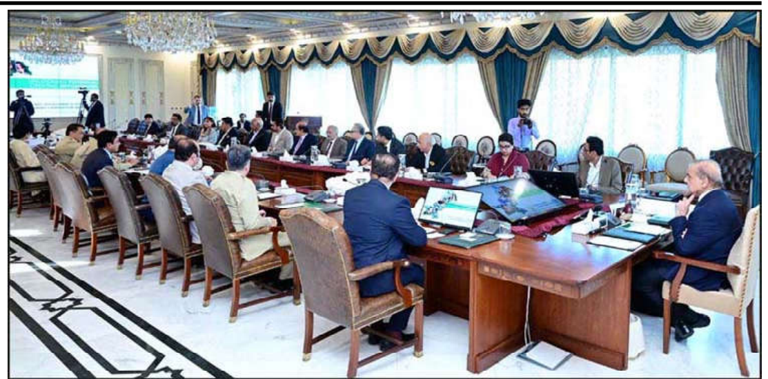
ISLAMABAD: Prime Minister Muhammad Shehbaz Sharif chairs a sectoral briefing regarding NAVTC and Ministry of Overseas Pakistanis and Human Resource Development.

elevate the quality of Pakistan's technical manpower and human resource development. He called for establishing an integrated system of regulating the manpower equipped with the best and world-class professional technical skills. Besides, in coordination with NADRA,