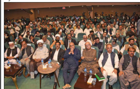
ISLAMABAD: Participants attending a seminar titled "Tahafuz e Ain e Pakistan kesy aur kiun" under the auspices of Tehreek Tahafuz Pakistan in the Federal Capital.

He said that those took part in the nefarious conspiracy on May 9 by attacking the national installations and monuments were actually the enemies of Pakistan and nation.