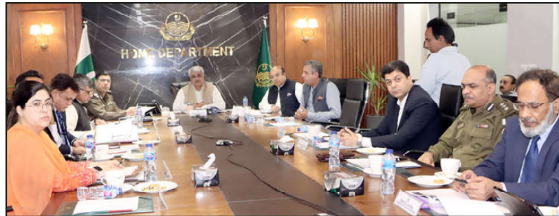
LAHORE: Punjab Health Minister Khawaja Salman Rafique chairing the fourth meeting of the Sub-Cabinet Committee on Law and Order, held at the home department.

facilities to them. "Farmers are hardworking people so their welfare and provision of facilities to them was among our priorities," he said. He emphasized that transparency and quality assurance as core principles of the procurement process and in this regard, he added, effective measures had been made. "Not buying wheat from Pakistan Agricultural Storage & Services Corporation Limited (PASSCO) resulted in a benefit of Rs 12 billion which would be utilized in the construction and maintenance of warehouses," he said.