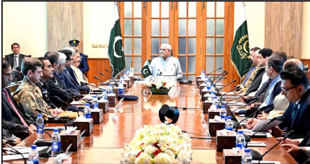
President Asif Ali Zardari being briefed about the law and order situation and the ongoing development projects in Balochistan, Quetta.

Ph: 2841470/2841473 Vol: XIX No. 315, Shawwal 29, 1445 AH Wednesday May 08, 2024, Pages 04, Price Rs.15