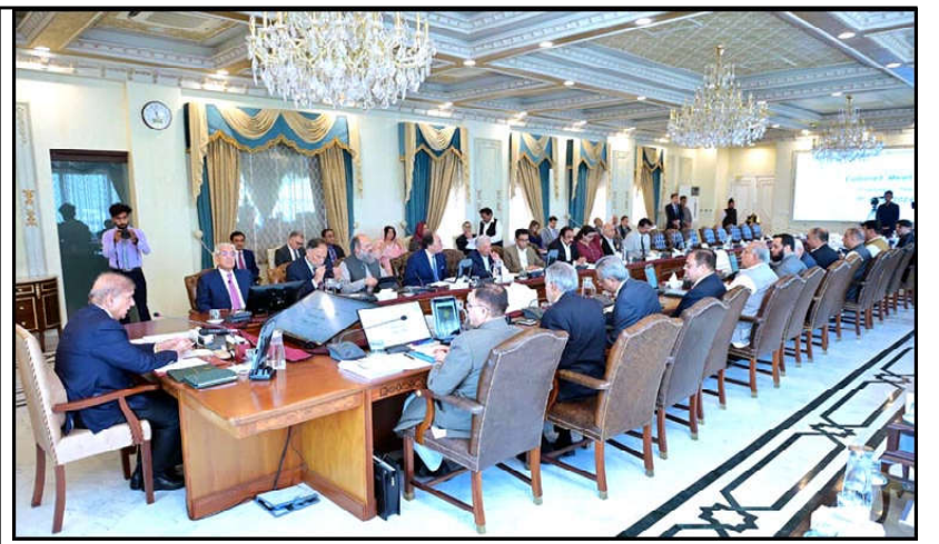
ISLAMABAD: Prime Minister Muhammad Shehbaz Sharif chairs a meeting of the Federal Cabinet.