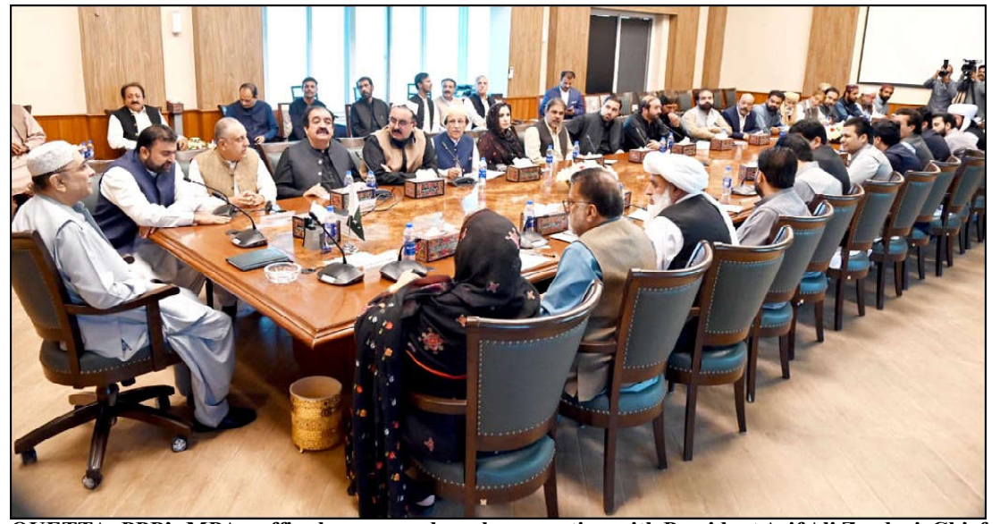
QUETTA: PPP's MPAs, office bearers and workers meeting with President Asif Ali Zardari. Chief Minister Balochistan Mir Sarfaraz Ahmed Bugti is also present

Ahsan Iqbal also discussed the upcoming South Asian Games 2025, underlining the importance of comprehensive training programs for Pakistani athletes.