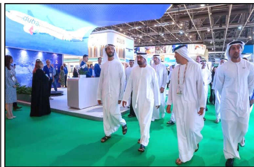
Sheikh Ahmed bin Saeed Al Maktoum, president of the Dubai Civil Aviation Authority and CEO of flag carrier Emirates, kicks off the mega travel and tourism exhibition event, Arabian Travel Market (ATM) 2024, in Dubai.

tian state-linked media said the talks stalled after a rocket attack claimed by Hamas's armed wing killed four Israeli soldiers on Sunday. Israeli Prime Minister Benjamin Netanyahu has vowed to send ground troops into Rafah regardless of any truce, defying international concerns. Cairo's foreign ministry warned in a statement of "grave humanitarian risks" for more than one million Gazans sheltering there and urged Israel to "exercise the utmost restraint". US President Joe Biden and Netanyahu spoke and Biden restated "his clear position" against an invasion of Rafah, the White House said. It also said the Israeli premier "agreed to ensure the Kerem Shalom crossing is open for humanitarian assistance for those in need".