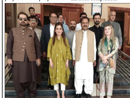
QUETTA: A delegation of National Commission on the Rights of Child (NCRC) led by its Chairperson Ayesha Raza Ferooz in a group photo with Secretary Local Government Abdul Rauf Baloch after a meeting

He said that the district administration was keeping an eye on the performance of all the departments so that efforts should be made to leave no stone unturned in the service of the public. The Deputy Commissioner specially instructed the officers to pay attention to the cleanliness of the cities and to make special arrangements for cleanliness in markets and other public places in all concerned cities to keep the area clean. While instructing the Xens, he said that the quality of ongoing development projects across the district should not only be ensured, but prioritized for their completion so that people would get benefit from completion.