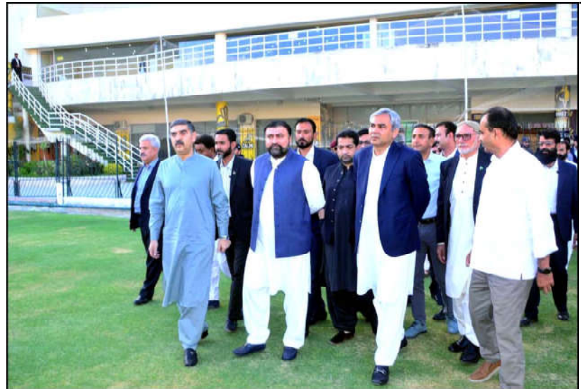
QUETTA: Balochistan Chief Minister Mir Sarfaraz Ahmed Bugti along with Federal Minister for Interior, Chairman of PCB Mohsin Naqvi and Ex-Interim PM Anwaar-ul Haq Kakar inspecting at Bugti Cricket Stadium