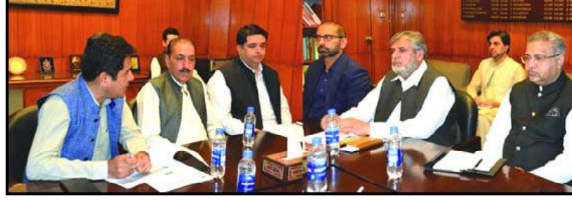
QUETTA: Balochistan Chief Secretary Shakeel Qadir Khan presiding over a meeting regarding border markets

They also briefed about the measures taken for improving law and order.