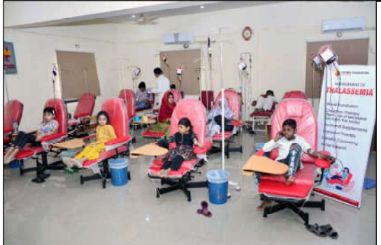
HYDERABAD: Children patients of Thalassemia being blood transfusions at Fatimid Foundation Center in connection with International Thalassemia Day.