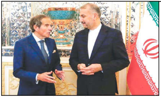
Iranian Foreign Minister Hossein Amir Abdollahian meets UN atomic watchdog chief Rafael Grossi.

pulled. "The equipment which was confiscated, the loss that we suffered from stopping our broadcast, all of that is subject matter for legal action," Nagm said. The Israeli government on Sunday said the order was initially valid for 45 days, with the possibility of an extension. Hours later, screens in Israel carrying Al Jazeera's Arabic and English channels went blank, apart from a message in Hebrew saying they had "been suspended in Israel". The shutdown does not apply to the Israeli-occupied West Bank or Gaza Strip, from which Al Jazeera still broadcasts live on Israel's fighting with Hamas. Al Jazeera immediately condemned Israel's decision as "criminal", saying on social media site X that it "violates the human right to access information".