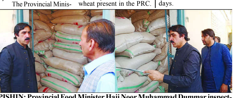
PISHIN: Provincial Food Minister Haji Noor Muhammad Dummar inspecting wheat stock at PR Center

Meanwhile, the Minister inspected the stock of wheat present in the PRC.