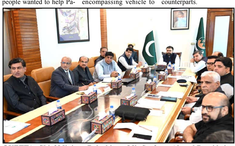
QUETTA: Chief Minister Balochistan Mir Sarfaraz Ahmed Bugti being briefed about Communication Department

The prime minister expressed his satisfaction over the solid and tangible progress achieved during the delegation's interac-