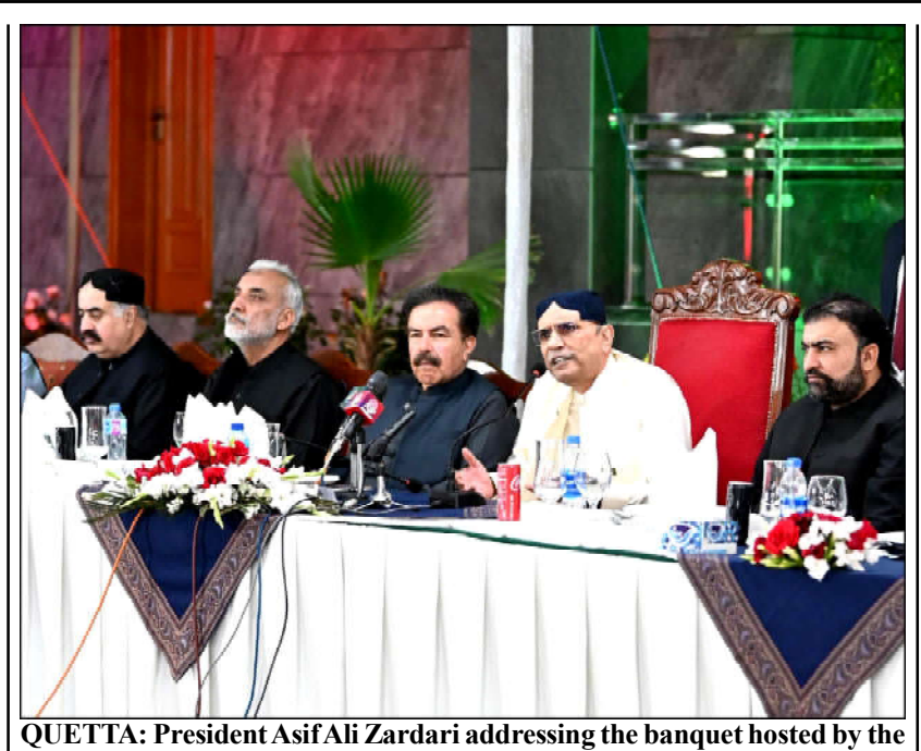
Chief Minister of Balochistan Mir Sarfaraz Ahmed Bugti. Governor Balochistan Sheikh Jaffar Khan Mandokhail is also present

The court said that the members of the reserved seats allotted in the second phase would not be able to vote until the