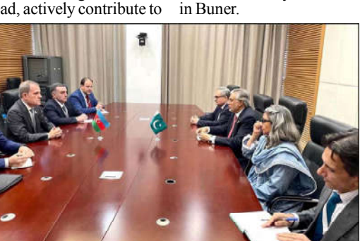
BANJUL: Deputy Prime Minister and Foreign Minister Senator Mohammad Ishaq Dar held a bilateral meeting with Foreign Minister of Republic of Azerbaijan Jeyhun Bayramov, on the sidelines of the 15th OIC Islamic Summit Conference.

nishing the reputation of to stabilize the exchange