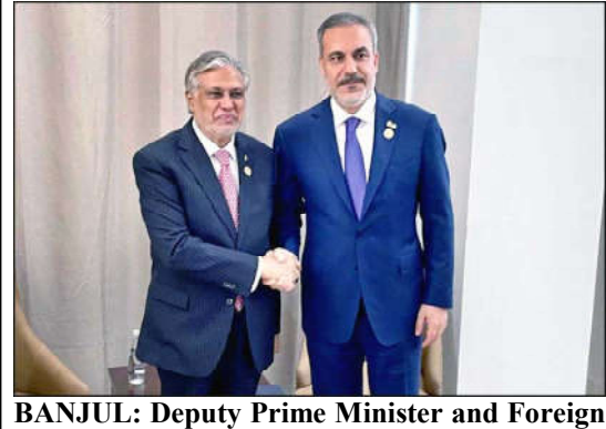
Minister Senator Mohammad Ishaq Dar met with Turkish Foreign Minister Hakan Fidan, on the sidelines of the 15th OIC Islamic Summit Conference.

(OIC) that commenced its Furthermore, the secdeliberation in Banjul, the retary general reaffirmed capital of The Gambia unthe OIC's commitment to der the theme: 'Enhancing addressing pressing politi-Unity and Solidarity cal and humanitarian chalthrough Dialogue for Suslenges facing the OIC Memtainable Development', a