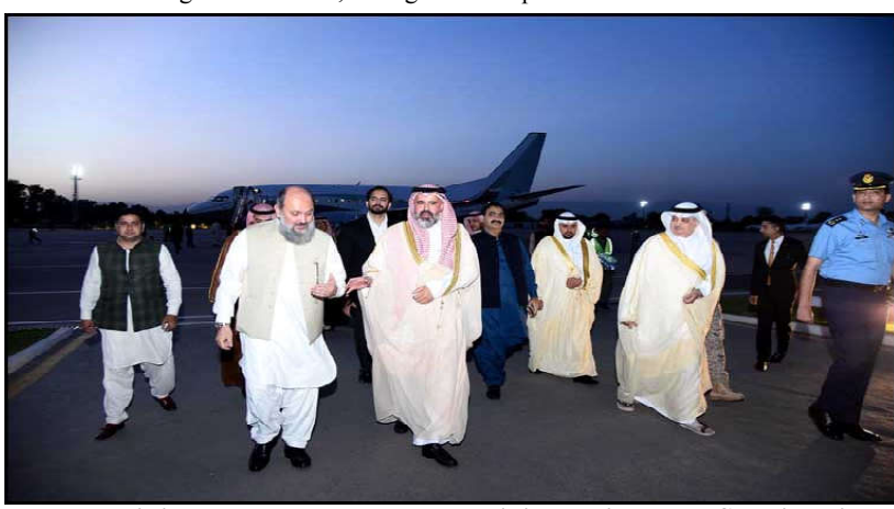
Federal Minister Jam Kamal Khan receiving a high-level Saudi business delegation upon its arrival.

Highlighting Indian atrocities in Indian Illegally Occupied Jammu and Kashmir (ÎIOJK), especially after India's illegal and unilateral actions of 5 August 2019, the deputy prime minister and foreign minister urged the OIC to implement its Action Plan on Jammu and Kashmir; demand that India ends all human rights violations; release Hurriyat leaders; and reverse its illegal demographic and other unilateral