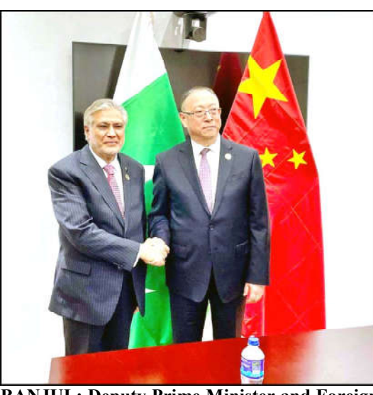
BANJUL: Deputy Prime Minister and Foreign Minister Senator Mohammad Ishaq Dar met with Vice Chairman of the Standing Committee of the National People's Congress of China Zheng Jianbang, on the sidelines of the 15th OIC Islamic Summit Conference.

The B2B meetings will specifically target sectors such as agriculture, mining, human resources, energy, chemicals and maritime. Moreover, discussions will extend to investment prospects in other sectors including refinery, IT, religious tourism, telecom, aviation, construction, water and power generation,