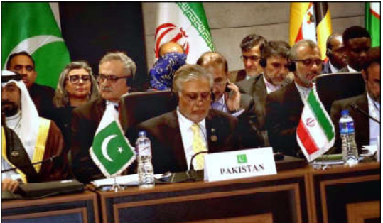
BANJUL: Deputy Prime Minister and Foreign Minister Senator Mohammad Ishaq Dar participated in the preparatory Meeting of Foreign Ministers to the Islamic Summit of the OIC.

instructed concerned authorities from ASF, ANF, and Customs to devise a comprehensive plan within the next 24 hours in this regard. Khawaja Asif stated that after the successful implementation at Lahore Airport, the simplified search process will also be implemented at other airports as well. The Interior minister directed to increase the number of immigration counters at the arrival and departure terminal to save passengers from the hassle of waiting. He added that a final plan in this regard should be presented within three days. Mohsin Naqvi stressed the importance of providing maximum facilities to passengers through out-of-the-box initiatives. Besides reviewing the facilities available to passengers at the airport, he also observed the search process of ANF, ASF and Customs.