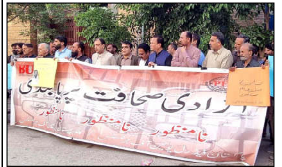
QUETTA: Members of Quetta Union of Journalists are holding protest demonstration for acceptance of their demands on the occasion of World Press Freedom Day, at Quetta press club.

BANJUL (Gambia), (APP): As the foreign ministers of the OIC countries gathered ahead of the Islamic Summit here, Pakistan called for the declaration of an immediate and unconditional ceasefire in Gaza, the lifting of the inhuman siege, and the opening of a humanitarian corridor, besides urging the international community to hold Israel accountable for its war crimes in Gaza. The theme of this year's summit is "Enhancing Unity and Solidarity through Dialogue for Sustainable Development." During the meeting, Pakistan was unanimously elected as the Vice-Chair of the Bureau of Foreign Ministers' Preparatory Meeting for the 15th Islamic Summit of the OIC. Ishaq Dar, who arrived in the Gambian capital city of Banjul on Wednesday for the OIC Islamic Summit, also emphasized the UN Security Council's role in implementing its resolution 2728 for cessation of hostilities, asking Israel to halt all settlements in the occupied Palestinian territories and relinquish all usurped Palestinian properties. Deputy Prime Minister and Foreign Minister Ishaq Dar, in his address at the Preparatory Meeting of Foreign Ministers for the 15th Session of the Islamic Summit Conference held here on Thursday, also called for an end to the indiscriminate use of force and the return of the displaced people.