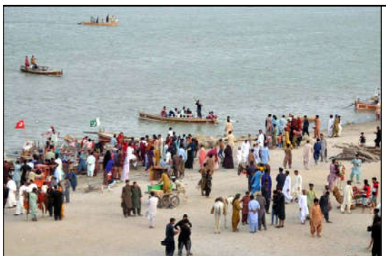
HYDERABAD: People are enjoying pleasant evening and cooling themselves during the hot weather, at River Indus in Jamshoro.