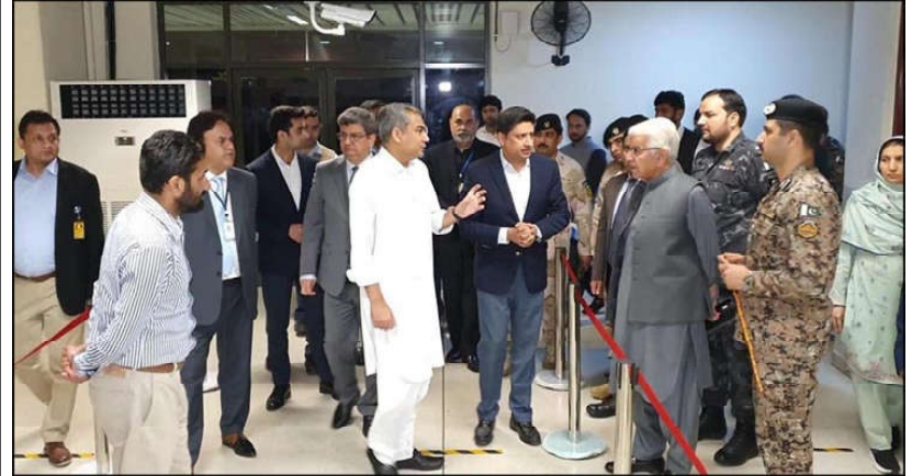
LAHORE: Federal Minister for Interior, Mohsin Naqvi and Federal Minister for Aviation and Defence, Khawaja Muhammad Asif reviewing the facilities for passengers at Allama Iqbal International Airport.