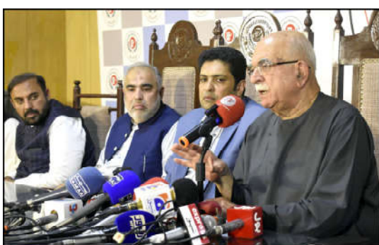
LAHORE: Head of the Tehreek-e-Tahafuz-e-Ayem-e-Pakistan (TTAP) Mahmood Khan Achakzai, addressing a press conference at press club, in the Provincial Capital.