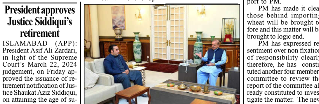
ISLAMABAD: Chairman Pakistan People's Party and MNA Bilawal Bhutto Zardari called on Prime Minister Muhammad Shehbaz Sharif.