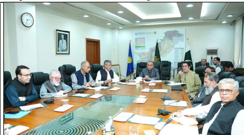
Federal Minister for Communications Abdul Aleem Khan is being briefed on the matters pertaining to Pakistan Post.

Attorney General, Mansoor Usman Awan was also present on the occasion, according to press statement issued by FBR.