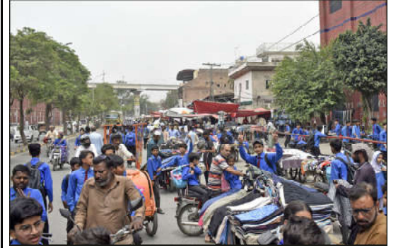
LAHORE: Students crossing a busy road after the attending their class at a local school, in the Provincial Capital, which may cause any incident any time as needs to attention for concern authority.

Independent Report LAHORE: At least 15 persons were dead and 1406 injured in 1280 road accidents in all 37 districts of Punjab during the last 24 hours. Out of these, 638 people with serious injuries were shifted to different hospitals, while 768 victims with minor injuries were treated at the site by rescue medical teams, thus reducing the burden of hospitals. Furthermore, the analysis showed those 767 drivers, 60 underage drivers.