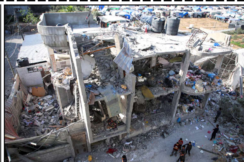
People stand next to a house damaged in an Israeli strike, amid the ongoing conflict between Israel and the Palestinian Islamist group Hamas, in Rafah, in the southern Gaza Strip.

"72 per cent of all residential buildings have been completely or partially destroyed". Reconstruction is made more difficult by the presence of large quantities of unexploded ordnance in the debris that Gaza's Civil Defence agency says triggers "more than 10 explosions every week". Mediators have proposed a deal that would halt fighting for 40 days and exchange Israeli hostages for potentially thousands of Palestinian prisoners, according to details released by Britain. An Israeli official not authorised to speak publicly said Israel was still waiting for Hamas's formal response to the latest proposal.