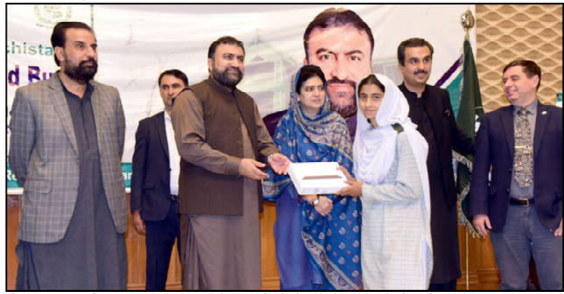
QUETTA: QUETTA: Balochistan Chief Minister Mir Sarfaraz Ahmed Bugti alongwith Education Minister Raheela Hameed Khan Durrani giving away tablet to girl students at a ceremony of distribution of tablets to schools students

students to work hard to excel in studies. He also urged the teachers to motivate students towards acquiring different skills.