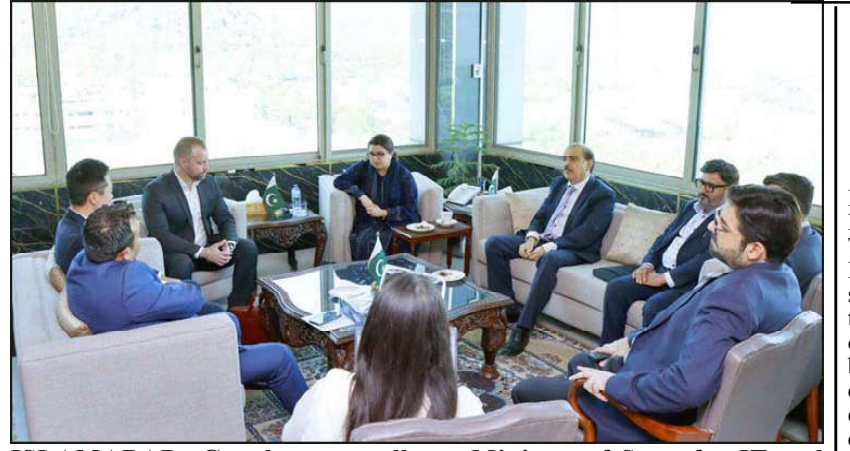
ISLAMABAD: Google team calls on Minister of State for IT and Telecommunication, Shaza Fatima Khawaja.