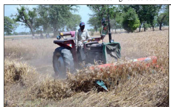
FAISALABAD: Farmer busy in cutting wheat crop with the help of tractor in his field.

He expressed his gratitude to the Development Director of the British High Commission in Pakistan for the continued support and assistance provided to the people of Pakistan.