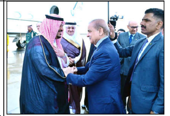
RIYADH: Prime Minister Muhammad Shehbaz Sharif departs for Pakistan after participating in a special meeting of the World Economic Forum.

their thinking instead of independence of judiciary, the chief justice observed as Attorney General Usman Mansoor Awan presented his arguments while representing the government being the country's chief law officer. The chief justice also recalled that he was the first individual to name someone for interference by mentioning Lt-Gen (ret'd) Faiz Hameed in the Faizabad sit-in case.