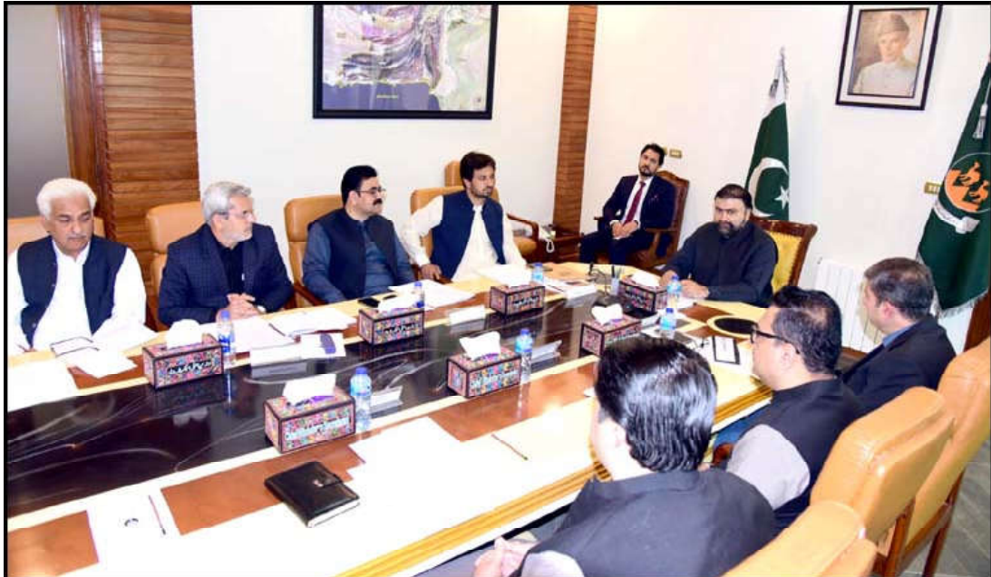
QUETTA: Chief Minister Balochistan Mir Sarfaraz Ahmed Bugti presiding over a view meeting of Livestock & Dairy Development Department

Ph: 2841470/2841473 Vol: XIX No. 309, Shawwal 22, 1445 AH Wednesday May 01, 2024, Pages 04, Price Rs.15