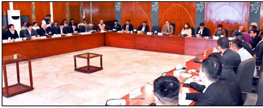
ISLAMABAD: Federal Minister for Planning, Development & Special Initiatives, Ahsan Iqbal chairs a meeting with Chinese enterprises working in Pakistan to discuss their challenges and recommendations for CPEC Phase II projects.

He made pledged to take all those exploiting labourers in the province to task. He also vowed to ensure equal opportunities and necessities to the labourers. He asserted that no discrimination would be made with anyone on the basis of colour and creed. This and similar other views were expressed by the Chief Minister in a message issued marking the Labour day being observed today (Wednesday). Mir Sarfraz Ahmed Bugti said that Labour day is the day to pay homage to the martyrs of Chicago who sacrificed their lives in 1886. He said that the objective behind observance of the day is to raise voice for rights of the labourers. He said that the labourers have key role and status in economic development of any society and country. He said that the role of labourers can't be ignored in development and industrialization of the countries.