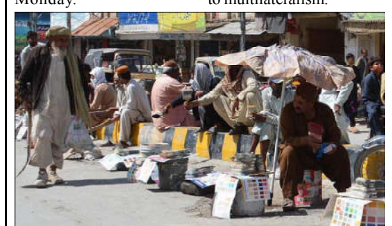
QUETTA: Daily wages labors sitting with their work tool along road side while waiting for customers to earn money for their family on eve of International Labor Day.

ISLAMABAD (APP): The ACT Alliance calls for an immediate, comprehensive, and across-the-board implementation of the Track and Trace System (TTS) as Prime Minister Muhammad Shehbaz Sharif reaffirms commitments to stringent tax enforcement. Despite the system's introduction in 2019, the promises of full implementation by December 2023 have faltered, revealing a critical lapse in our fiscal management strategy. The recent cabinet meeting chaired by Prime Minister Sharif underscored the dire state of tax evasion and illicit trade, with the Federal Board of Revenue (FBR) failing to effectively deploy TTS across vital industries such as cement, sugar, and tobacco. The under-utilization of TTS has allowed a significant portion of local manufacturers to remain unchecked, leading to substantial losses. For instance, two tobacco companies holding 42 per cent of the market share contributed Rs173 billion in taxes in FY 2022-23, while over 40 local manufacturers, controlling a 58 per cent share, paid a mere Rs3 billion. Muabshir Akram, National Convener of the ACT Alliance, expressed deep concern over TTS's selective and inadequate enforcement. "Without equitable and transparent tax collection and enforcing TTS on all large-scale manufacturers, the government will struggle to meet its financial targets."