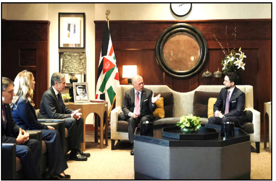
U.S. Secretary of State Antony Blinken meets with Jordan's King Abdullah II and Jordan's Crown Prince Hussein in Amman, Jordan

trary: we are working day and night for a two-state solution," the ministry said. "We are the largest donor of humanitarian aid to the Palestinians. "We are working to ensure that aid reaches the people in Gaza." But it added that Israel has the right to defend itself and said more than 100 hostages are still being held by Hamas, "which is abusing the people of Gaza as shields." The court noted that Germany had granted only four export licenses to Israel for weapons of war since the start of the conflict, two for training ammunition and one for test purposes, as well as one consignment of "3,000 portable anti-tank weapons."