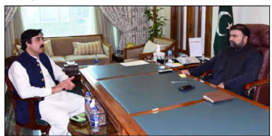
QUETTA: Provincial Food Minister Haji Noor Muhammad Dumar meeting with Chief Minister Balochistan Mir Sarfraz Ahmed Bugti

He noted that the farmers were coerced to sell wheat in the open market at a much lower than the officially fixed rate owing to the inept and incompetent imposed government's faulty and anti-poor policies with regard to the procuring of wheat.