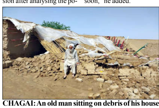
destroyed in recent rains

"I am away from mainstream and social media these days but can take decision to enter politics again soon," he added.