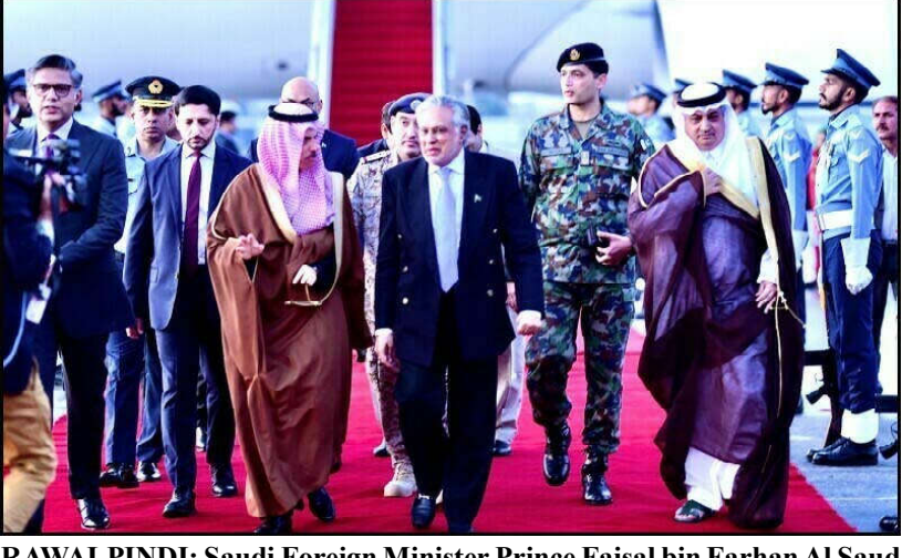
RAWALPINDI: Saudi Foreign Minister Prince Faisal bin Farhan Al Saud received by Foreign Minister Ishaq Dar upon his arrival at Nur Khan Airbase

General Investments. "The visit takes place essentially to expedite follow up on the understanding reached between Prime Minister Muhammad Shehbaz Sharif and Mahammad hin Salman Mohammad bin Salman, Crown Prince and Prime Minister of the Kingdom of Saudi Arabia during their recent meeting in Makkah Al Mukarramah to enhance bilateral economic cooperation between Pakistan and Saudi Arabia," the For-AlKhorayef, Deputy Minister of Investment Badr eign Office, in an earlier press release, said.