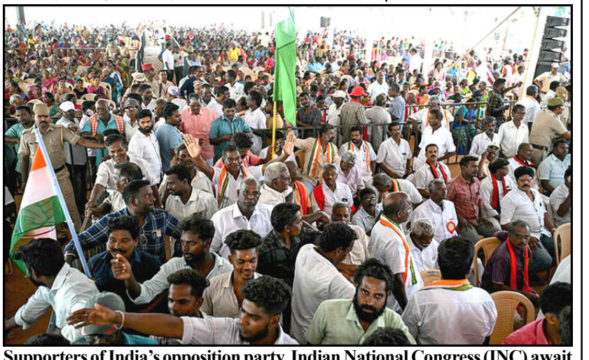
Supporters of India's opposition party, Indian National Congress (INC) await the arrival of their party President Mallikarjun Kharge, in Puducherry.

nancial crime-fighting agency, arrested Kejriwal to the city's liquor policy and he had been remanded to custody until April 15. Kejriwal has chal