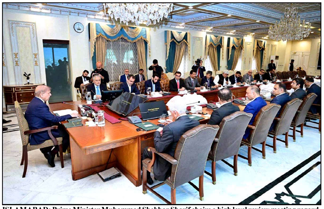
ISLAMABAD: Prime Minister Muhammad Shehbaz Sharif chairs a high level review meeting regard-

Ph: 2841470/2841473 REG: No. BC-116 B/ID-445 Vol: XXV No. 235, Shawwal 07, 1445 AH Tuesday April 16, 2024 Pages 08, Price Rs.15