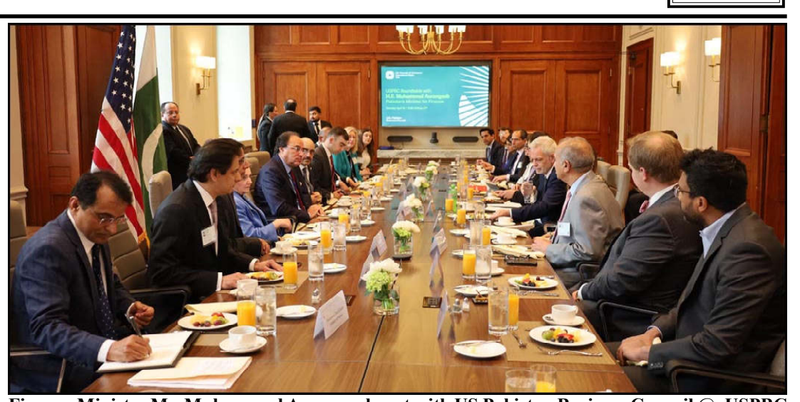
Finance Minister Mr. Muhammad Aurangzeb met with US Pakistan Business Council @ USPBC delegation in Washington D.C. Highlighted govt's commitment to improving business climate & attracting foreign & domestic investments in key sectors including agriculture, IT, mining, & energy.

The participants also expressed their commitment that they would fully cooperate with the highlevel delegation from Saudi