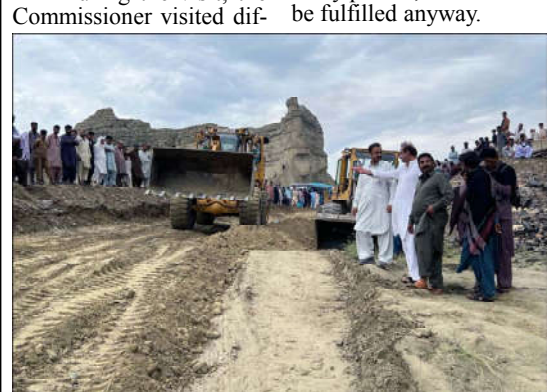
HUB: Heavy machineries and laborers busy in construction work of Causeway crossing road completely destroyed after flood in Hub River during recent heavy downpour of monsoon, under supervision NHA, located on Gwadar Coastal Highway.

He said that it is our responsibility to protect every person, and it would be fulfilled anyway.