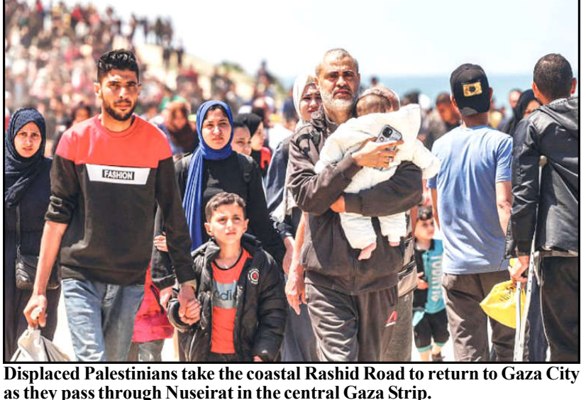
as they pass through Nuseirat in the central Gaza Strip.