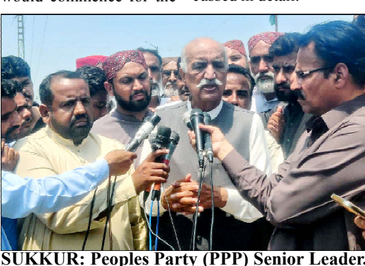
SUKKUR: Peoples Party (PPP) Senior Leader, Khursheed Shah talking to media persons after case hearing of alleged assets beyond means, outside Accountability Court

Senior Provincial Minister Sharjeel Inam Memon emphasized that the launch of the People's Bus Service across Sindh will bring revolutionary relief to the people. Additionally, he highlighted that establishing the best transport network will also attract trade and investment to the province. He directed that the transport projects should be completed soon so that the people can obtain relief. În the meeting, various transport projects, including the Red Line BRT, Green Line, and Yellow Line, were also dis-