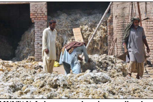
MULTAN: Labourers are busy in spreading sheep wool for drying at their workplace.

Abdulkarim Al-Issa. Ashrafi said the visit of Saudi Foreign Minister Faisal bin Farhan, accompanied by representatives from vital ministries and business sectors.