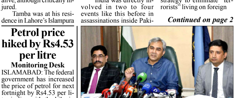
LAHORE: Federal Minister for Interior, Mohsin Raza Naqvi talking to media persons in Lahore

same." The attack came days after British publication The Guardian reported that the Indian government assassinated individuals in Pakistan as part of a wider strategy to eliminate "ter-