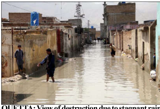
QUETTA: View of destruction due to stagnant rainwater causing of poor sewerage system creating problems for commuters and residents after heavy downpour, at Hazarganji area in Quetta.