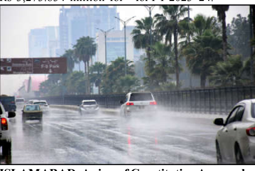
ISLAMABAD: A view of Constitution Avenue during rain in the Federal Capital.

Under the scheme, Rs 10,000 million was allocated for Umbrella PC-1 of the Flood Protection Sector Project, Rs 1000 million each for the remodeling of Pat Feeder Canal, Kachhi Canal Project, construction of Sumari Payan dam project (Kohat), and Rs 385.736 million for the construction of Asreli Storage Dam Sui in the PSDP