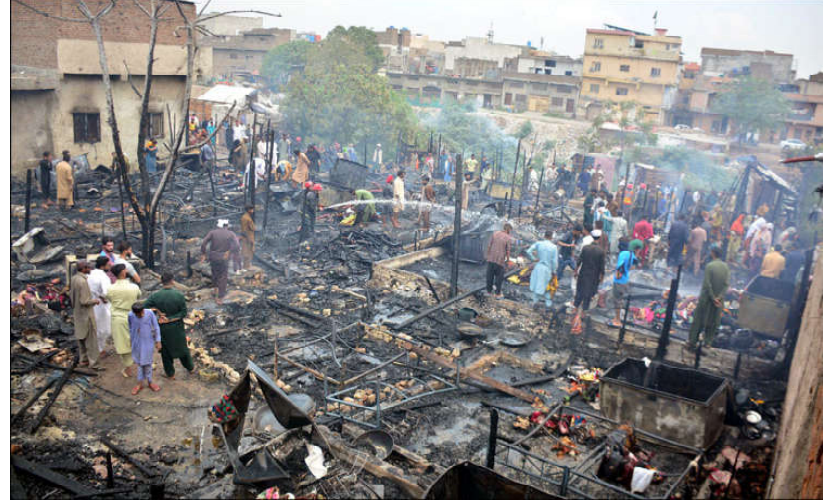
RAWALPINDI: Fire fighters extinguishing an inferno erupted in Dhoke Ratta area of the city.

PESHAWAR (APP): The Provincial Disaster Management Authority (PDMA) on Saturday released a report on the loss of lives and properties due to rain in the last 24 hours and confirmed that one person was killed and two injured due to rain since last night. A spokesman of the PDMA said that due to the rain, 1 house was completely damaged while 4 houses were partially damaged. The loss of life and property took place in Chitral Lower, the PDMA official release said. Many roads are closed for traffic due to rain in Chitral district and instructed the district administration to ensure the availability of small and big missionaries to open the closed highways, the official said. The official of PDMA said that the PDMA relief workers and other related organizations are being engaged in relief operations while PDMA is in touch with all concerned institutions. The emergency operation center of PDMA is fully functional and the people should report any untoward incident in 1700, the spokesperson said.