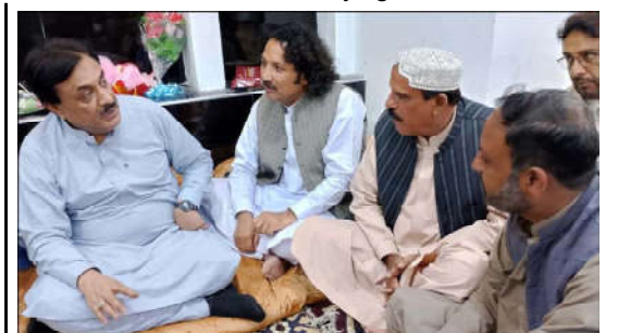
QUETTA: A delegation of Joint Action Committee University of Balochistan greets Deputy Chairman Senate Saidal Khan Nassar

LAHORE (Online): FIA has arrested one XEN of LESCO. It has been said that arrest has been made due to overbilling of consumers. The arrested XEN is charged with billing additional one crore 90 lac units to consumers and sent them additional electricity bill of Rs. 480 million. This led to cause loss of millions of rupees to national kitty.