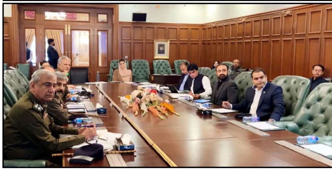
MURREE: Punjab Chief Minister Maryam Nawaz chairing a special meeting to review the overall law and order situation of the province.