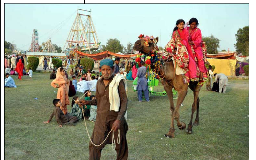
HYDERABAD: Children are enjoying camel and horse rides at Fun Land with their families as they are spending Eid holidays, at Rani Bagh in Hyderabad.

LAHORE (APP): Punjab Local Government and Community Development (LG&CD) Minister Zeeshan Rafique has directed the municipal administrators across Punjab to ensure all necessary arrangements put in place in light of recent rainfall in the province. The minister emphasized the importance of precautionary measures, advising that the alerts regarding rainfall from the Provincial Disaster Management Authority (PDMA) Punjab should be taken into consideration. LG&CD Minister Zeeshan Rafique stressed the need for machinery to be prepared for the drainage of rainwater, especially in low-lying areas, and for a proactive review of the sewage systems to prevent any blockages. Despite the ongoing holidays, he insisted that the citizens should not face any inconvenience due to the rains. Furthermore, he instructed the Secretary LG&CD and CEOs of waste management companies to maintain coordination with the local government department and other relevant departments, including the PDMA, to take joint actions and avoid any emergency situations.