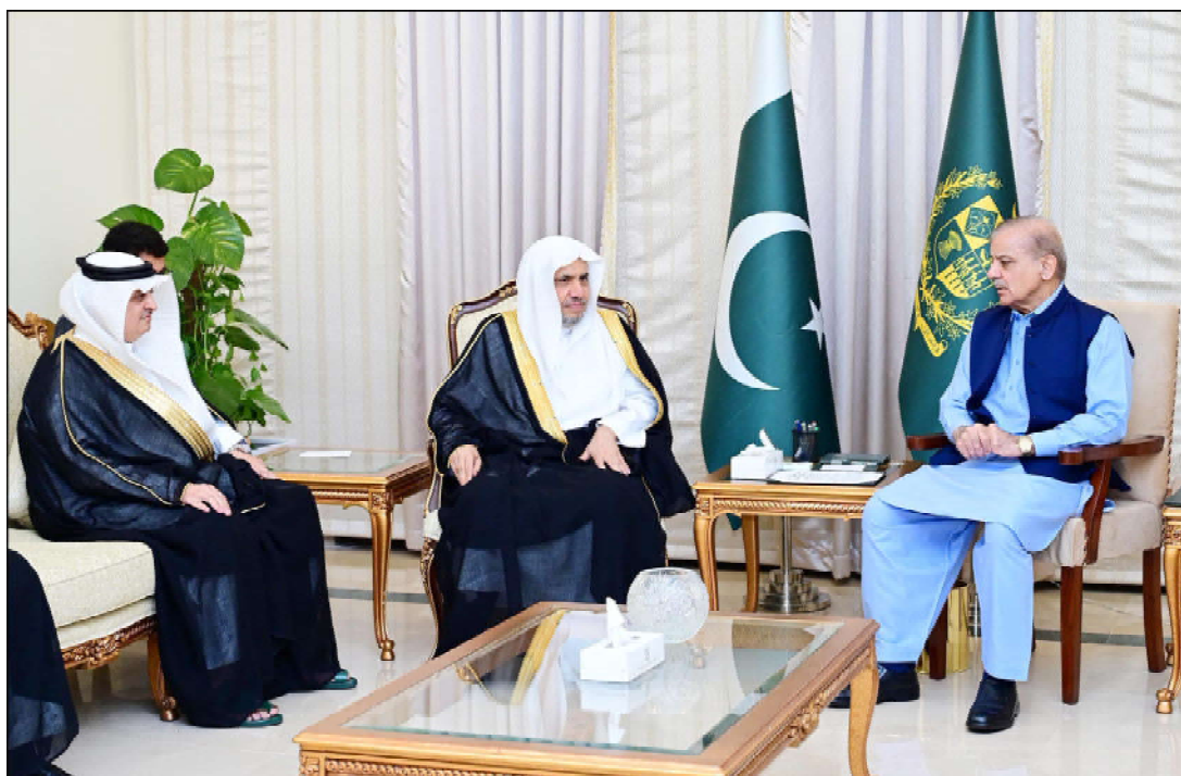
ISLAMABAD: Secretary General of Muslim World League Sheikh Dr. Muhammad Bin Abdulkarim Al-Issa meeting with Prime Minister Muhammad Shabbaz Sharif