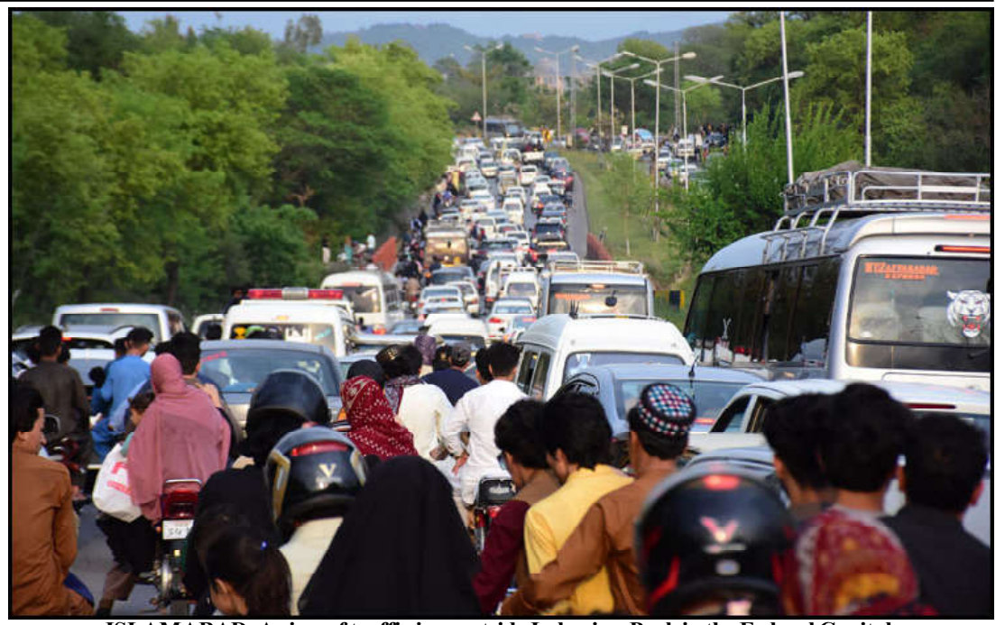
ISLAMABAD: A view of traffic jam outside Lakeview Park in the Federal Capital.

ISLAMABAD (INP): A report of the Law and Justice Commission of Pakistan stated that administrative tribunals and special courts (ATSC), had decided 137,316 cases during the year of 2023. In this connection, the ATSC has prepared a report depicting performance of Administrative Tribunals and Special Courts for the period of 2023. The report contains data of institution and disposal of cases in the 324 ATSCs functioning in the country, said a press release. Considering the number of pending cases, it can be seen that the net number has increased from 160,697 cases to 163,211 cases which shows an increase.