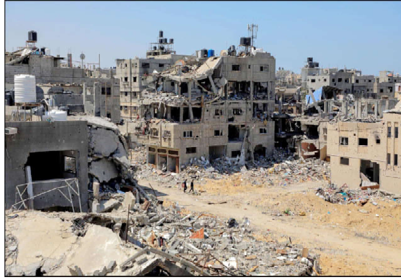
KHAN YUNIS: A view of buildings destroyed in Israeli attacks

Israel’s retaliatory offensive has killed at least 33,545 people in Gaza, mostly women and children, according to the Hamas-run territory’s health ministry.