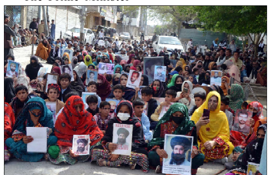
QUETTA: Members of Voice of Baloch Missing Persons are holding protest demonstration for recovery of their missing loved one