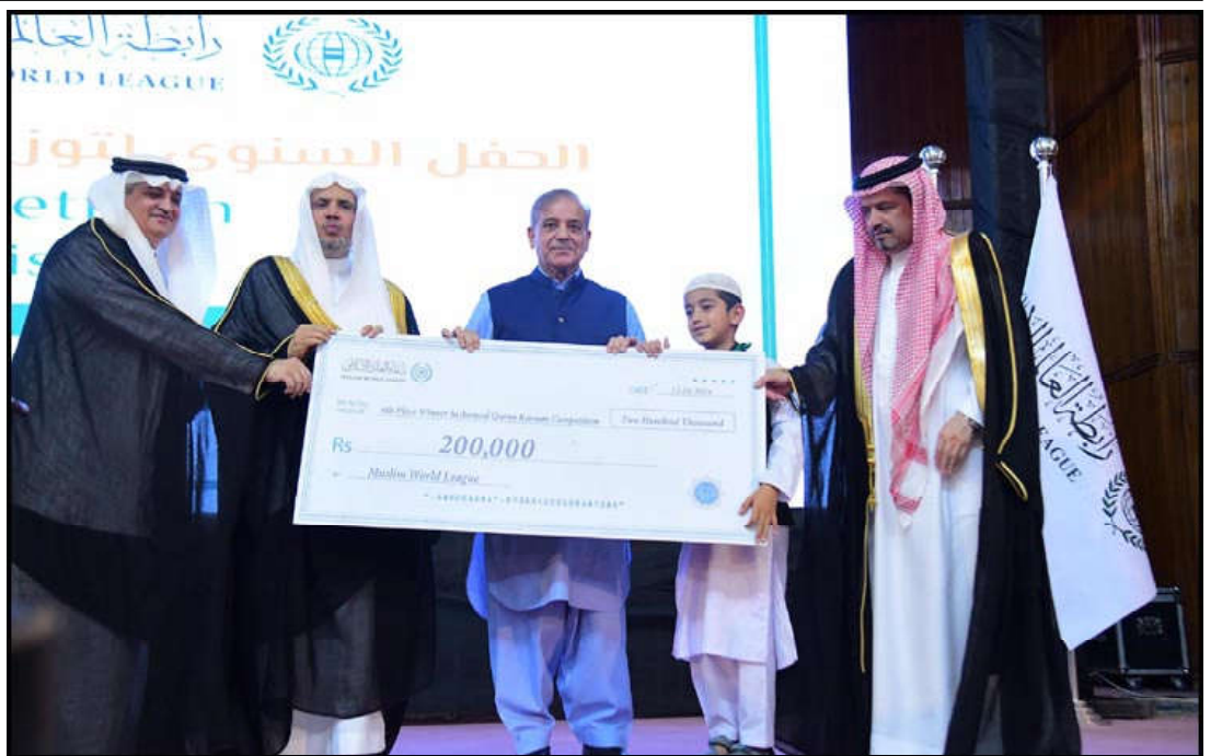
Prime Minister Muhammad Shehbaz Sharif distributes prizes among the winners of Annual Quran Kareem Hifz/ Qirat Competition organized by the Muslim World League in Islamabad.

for the project of Seerat Museum. He said people of Pakistan would not never forget adoration of leadership of Saudi Arabia whose landmarks where spread all over Pakistan, like the Faisal Mosque in Islamabad capital. While talking about his recent visit to the two holy mosques in Makkah and Medina and offering of prayers there, he said Crown Prince Mohammed bin Salman bin Abdul Aziz warmly received his delegation and exhibited deep love and affection for Pakistan.