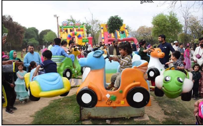
ISLAMABAD: Kids enjoying ride at Lakeview Park picnic point in the Federal Capital.

ISLAMABAD (Online): A new study says a global shift from red meat to forage fish consumption has the potential to dramatically decrease death rates from noncommunicable diseases. Forage fish such as herring, anchovies, and sardines are a rich source of omega-3s and other essential nutrients and are also more environmentally sustainable than red meat. However, experts question the feasibility of this dietary shift in low- and middle-income regions.