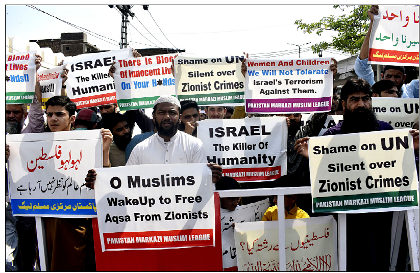
LAHORE: Activists of Pakistan Markazi Muslim League shouting slogans during protest against Israel attack on Ghaza, in the Provincial Capital

The project will eliminate the need for Heavy Fuel Oil (HFO). It is estimated to save forty four million dollars annually due to reduction in import bills, offering attractive returns to stakeholders.