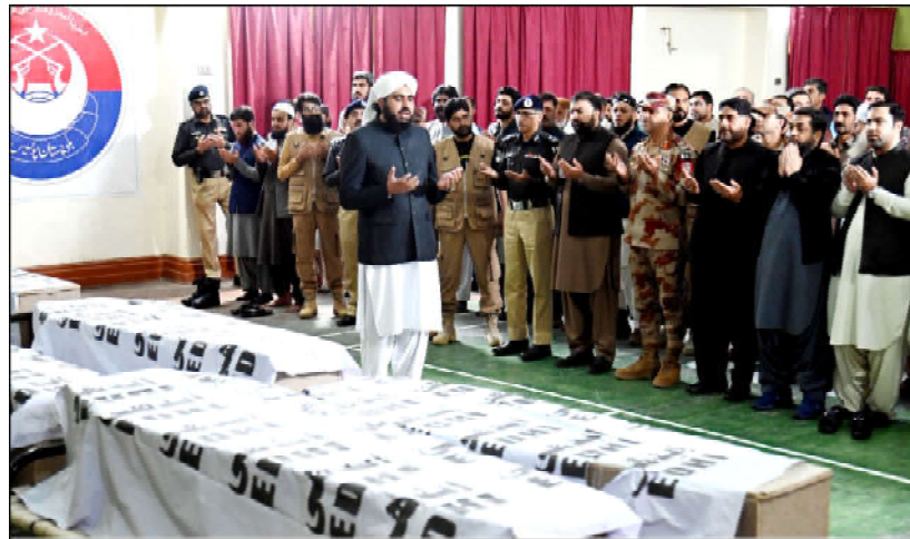
QUETTA: Chief Minister Balochistan Mir Sarfraz Ahmed Bugti, IGFC and MPAs offering Fateha for the departed souls of passengers gunned in Noshki last night