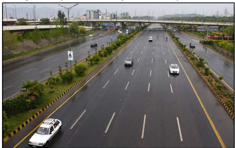
ISLAMABAD: A view of Srinagar Highway after rain in the Federal Capital.

real image, however in a test only 25% could actually distinguish a real image from an AI-generated one. This puts organisations at risk given how employees are often the primary targets of phishing and other social engineering attacks. For example, cybercriminals can create a fake video of a CEO requesting a wire transfer or authorising a payment, which can be used to steal corporate funds. Compromising videos or images of individuals can be created, which can be used to extort money or information from