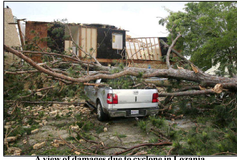
A view of damages due to cyclone in Lozana

Orenburg. Flood water covered the embankment promenade and swirled around houses and an high-rise apartment blocks built close to the river, an AFP journalist saw. Almost 14,000 people have been evacuated from Orenburg and the surrounding region, according to authorities. Eldar Rakhmetov, an official from the Ministry of Emergency Situations involved in the evacuation said: “There has been an increase in the number of homes flooded since this morning and more areas are being evacuated.” Local residents were using rubber dinghies to try to retrieve pets and belongings from flooded houses and some areas were left without power. Valery, 64, a local factory worker, was one of those evacuated Saturday by a police truck.