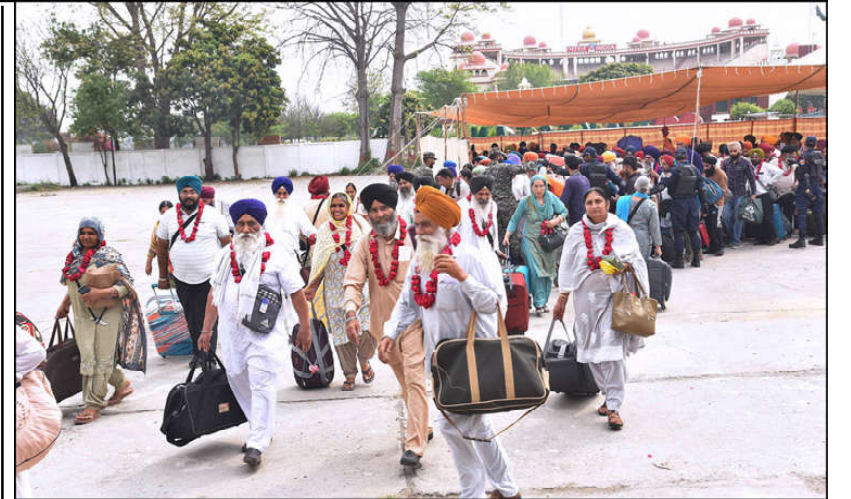
LAHORE: Arrival of Sikh Yatees at Wagah Border to participate in the religious rituals in Pakistan.