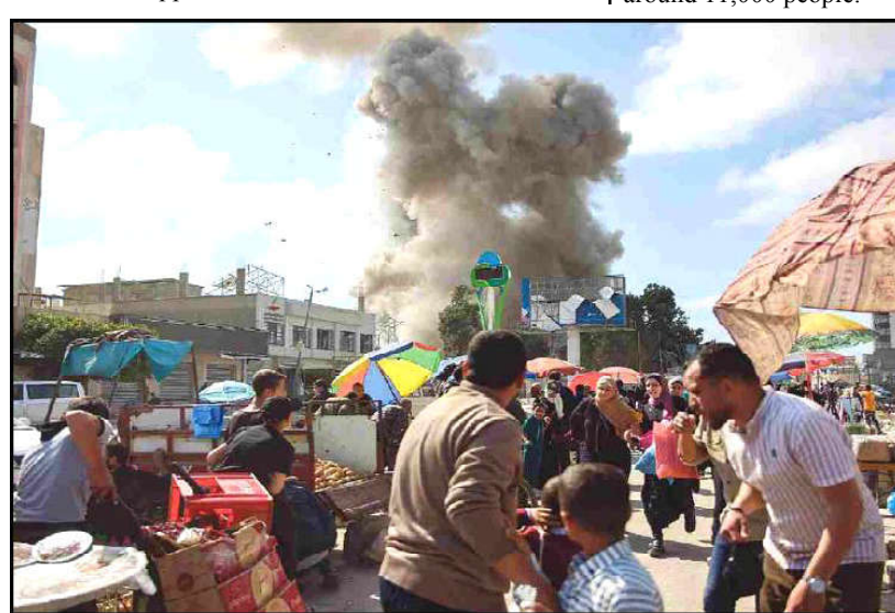
GAZA: Palestinians react as smoke billows after Israeli bombing in the Firas market area