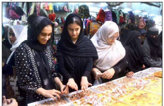
KARACHI: Women purchasing artificial jewelry ahead of Eid-ul-Fitr at Hyderi Market.

IG Punjab said that health screening of police employees with third dose of hepatitis vaccination will be completed soon. He said that has re-conduct of health screening and psychological profiling of police employees in collaboration with the health department will be completed. IG Punjab said that the collaboration of Police Lines Welfare Hospital Qila Gujjar Singh with King Edward Medical College will continue, police Lines Qila Gujjar Singh Hospital will provide the best medical facilities to police employees and their families.