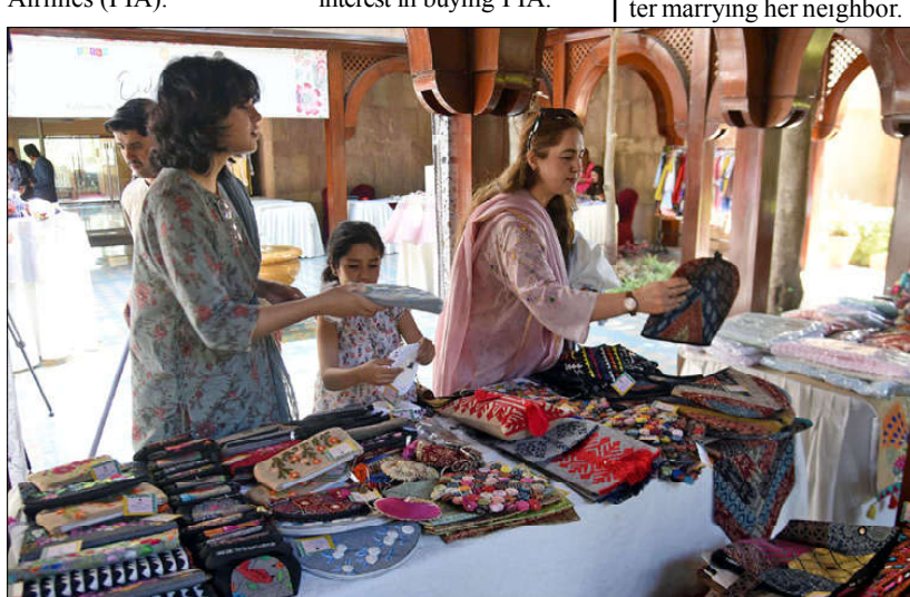
ISLAMABAD: Visitors taking interest in crafts at an Eid Bazaar arranged by the Management of Serena Hotels in collaboration with Behbud Crafts celebrating Women Artisans through Economic Empowerment at Bazaar Court, of Serena Hotel at Federal Capital.