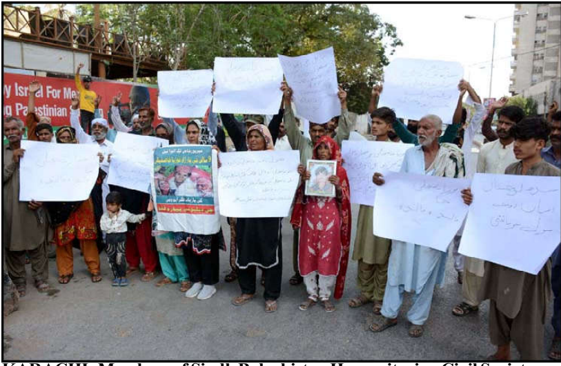
KARACHI: Members of Sindh Balochistan Humanitarian Civil Society are holding protest demonstration against killing of Khaskheli community people and recovery of missing two kidnapped girls.