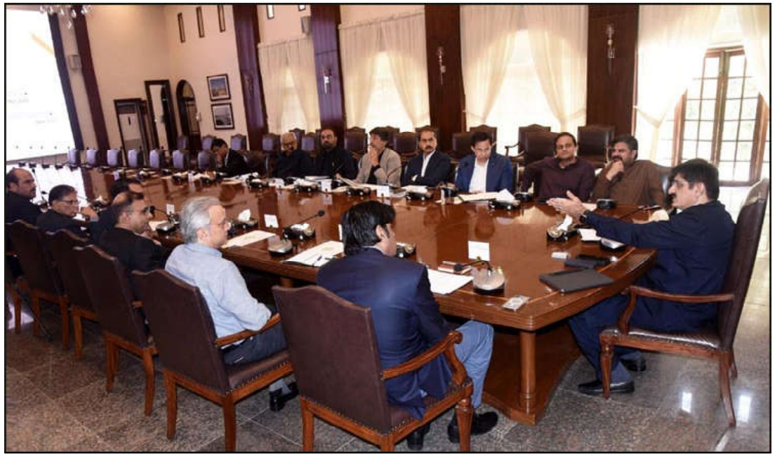
KARACHI: Chief Minister Sindh Syed Murad Ali Shah presiding over a meeting to review progress of K-4 project.