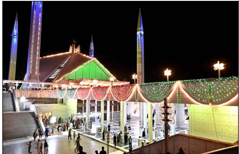
ISLAMABAD: An illuminated view of Faisal Masjid decorated with colourful lights in connection with Shab-e-Qadar on 27th day of Holy fasting month of Ramzanul Mubarak.