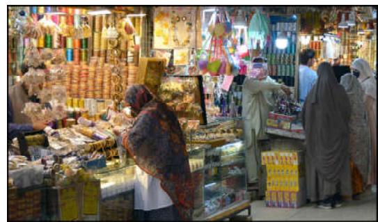
QUETTA: Woman busy in eid preparation as Eid approaching.