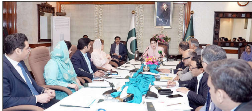
LAHORE: Chief Minister Punjab Maryam Nawaz Sharif presiding over a special meeting regarding LDA.