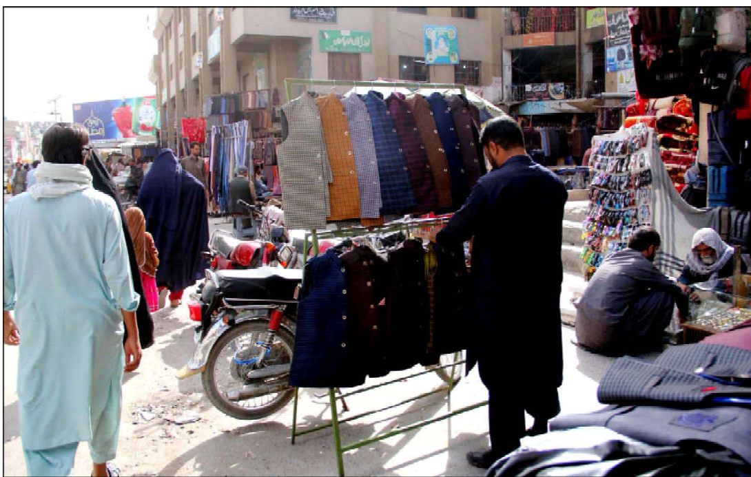
QUETTA: People are busy in Eid shopping ahead of Eid-ul-Fitr at Qandhari Bazar in Quetta

The ILO estimates that perhaps 25 per cent of the people killed in Gaza have been men of working age — generally, women do not work.