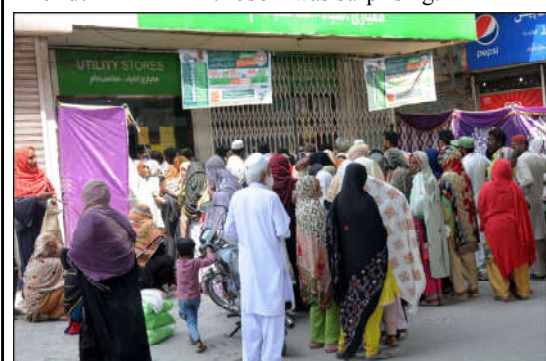
MULTAN: Women in a queue to get flour bags on the subsidize rate at a utility store.

She said that performance of price control magistrates would also be monitored and stern action would be taken against those who failed to accomplish their assignments.