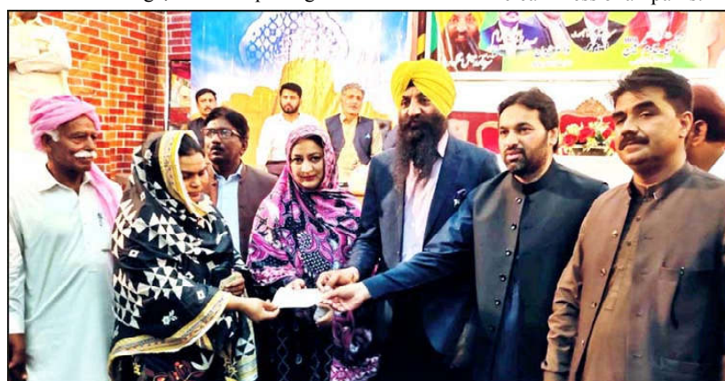
BAHAWALPUR: Provincial Minister Minority Affairs Sardar Ramesh Singh Arora and Deputy Speaker Punjab Assembly Malik Zaheer Iqbal Chand is distributing relief checks to minority women in a ceremony organized on the occasion of Easter and Holi.

were provided to the deserving people in all four tehsils, each ration pack included ten kilograms of flour bag, two kilograms of ghee, two kilograms of rice, two kilograms of sugar and basion. The Deputy Commissioner highly appreciated the services of the teams under the leadership of Assistant Commissioners (ACs) and the members of the teams for verifying the beneficiaries for working hard for the distribution of the Ramadan relief package.