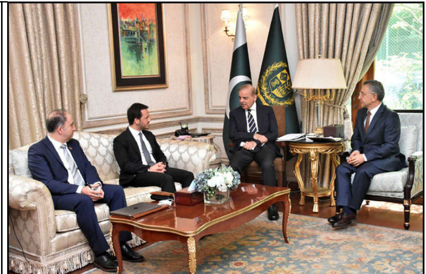
LAHORE: A delegation of Istanbul Grand Airport (IGA) calls on Prime Minister Muhammad Shehbaz Sharif.

He said that the PML-N government had always given importance to Pak-China friendship. He said, "After the incident, the Prime Minister Shehbaz Sharif visited the Chinese Embassy and met the Chinese Ambassador.