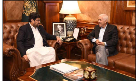
KARACHI: Federal Minister for Maritime Affairs Qaiser Ahmed Sheikh meeting with Sindh Governor Kamran Khan Tessori.