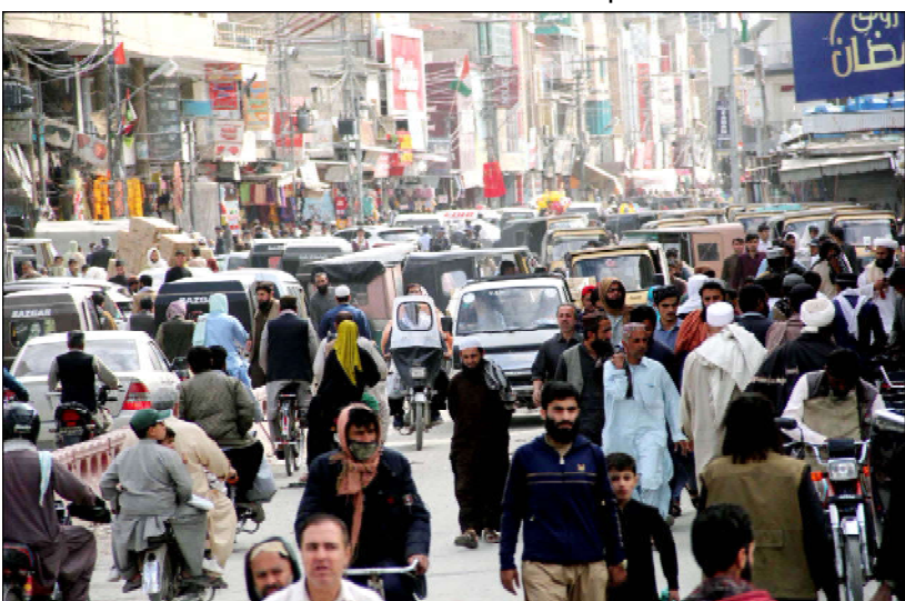
QUETTA: People are busy in Eid shopping ahead of Eid-ul-Fitr at Bacha Khan Chowk

He said registration of birth enables children to have access to the facilities of education and health besides legal identity and inheritance.