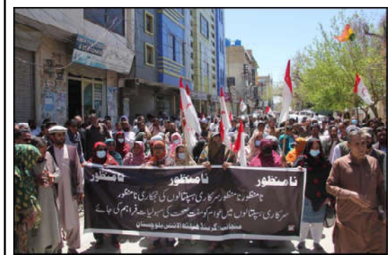
QUETTA: Members of Grand Health Alliance Balochistan are holding protest demonstration against the privatization of the government hospital, held at Quetta press club.