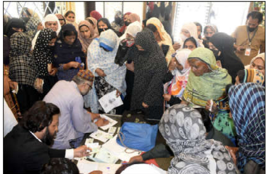
LAHORE: Baitulmal staff registering the deserving women for cheques distribution at Manawan, the provincial capital.