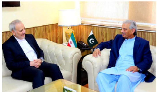
ISLAMABAD: Ambassador of Iran to Pakistan called on Federal Minister of Industry and Production and National Food Security Rana Tanveer Hussain

"These people want to break the party [PTI] and they are the same people levelling allegations against Bushra Bibi," the former prime minister said in an informal conversation with journalists during the hearing of the Toshakhana reference in Adiala jail.