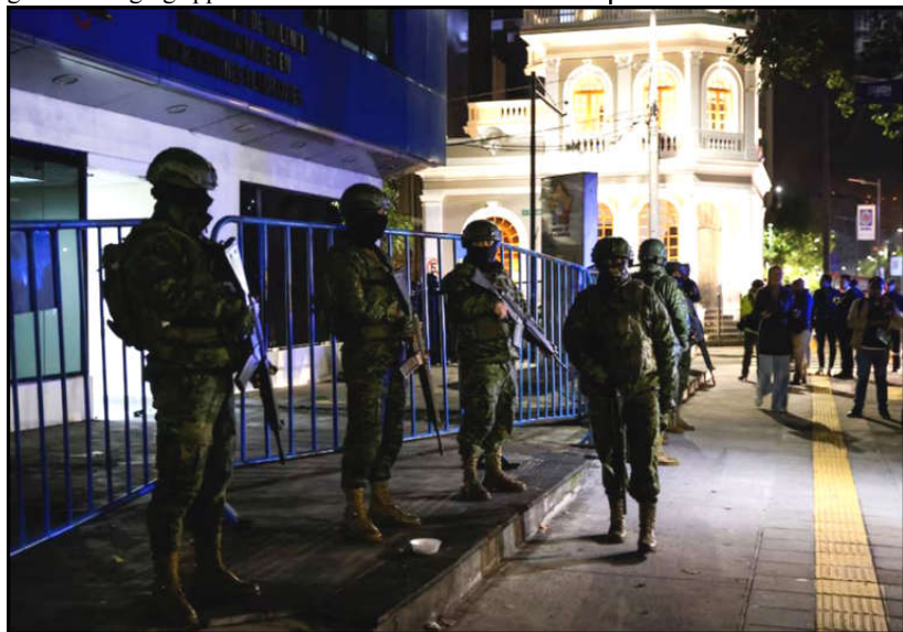
Military officials stand outside the Flagrancy Unit, where former Ecuador Vice President Jorge Glas is believed to be detained, in Quito, Ecuador.