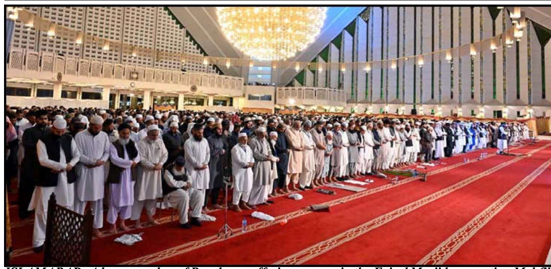
ISLAMABAD: A large number of people are offering prayers in the Faisal Masjid connection Mehfil-e-Shabeena with Shab-e-Qadar on 27th day of Holy fasting Month of Ramzan-ul-Mubarak.