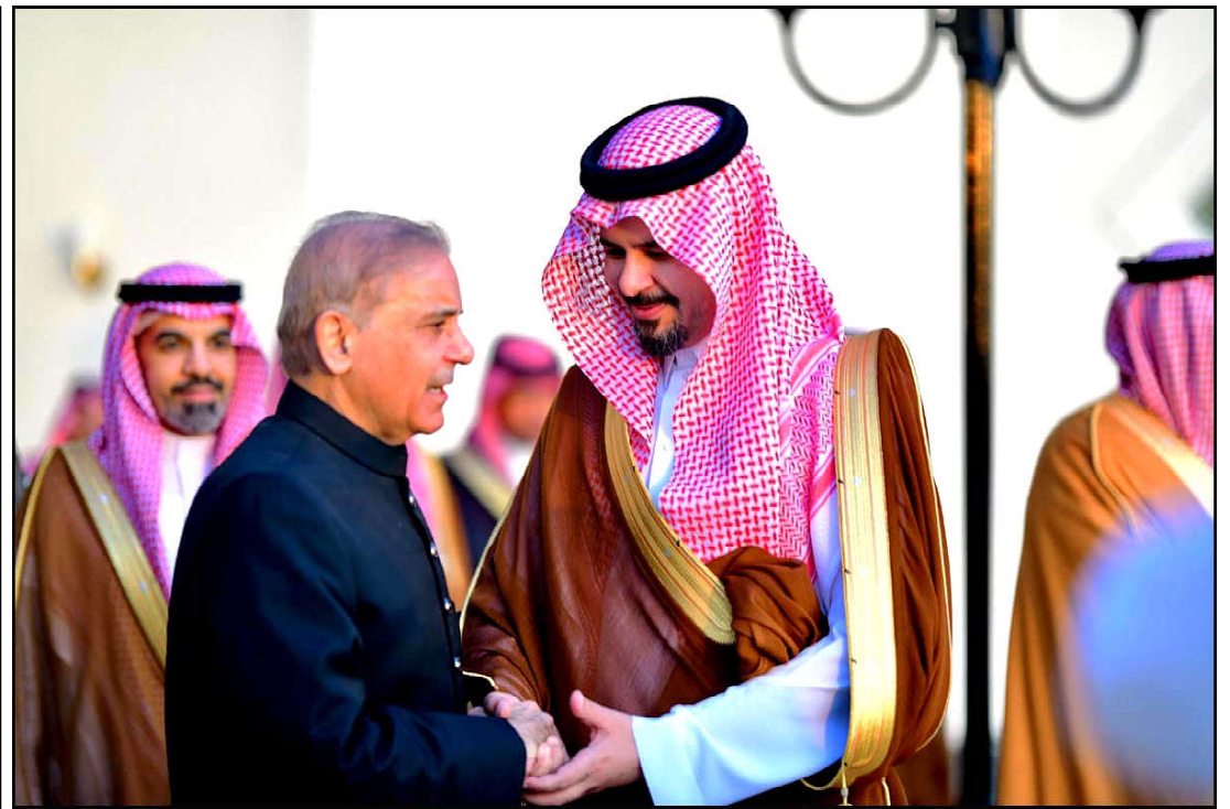
MADINAH MUNAWARAH: Prime Minister Muhammad Shehbaz Sharif is being received by Governor of Madinah H.R.H. Prince Salman bin Sultan Al Saud at Madinah Airport.