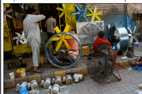
LAHORE: Electricians busy assembling big size exhaust fans at their workplace.

The delegation further informed the LCCI President that the civil administration and police.