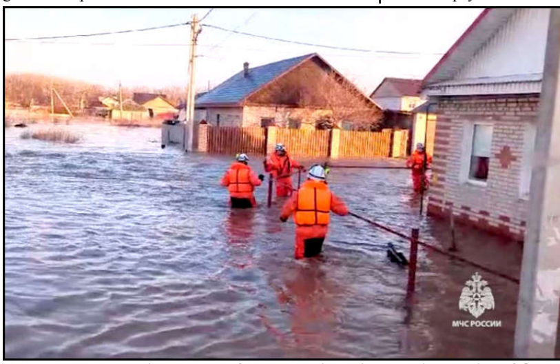
Rescuers make their way on a flooded residential area in the city of Orsk, Russia.

She wants to make the most of her lessons in the makeshift classroom before she is soon excluded under Taliban government rules which bar girls and women from secondary education and universities. The October quake killed more than 1,500 people and damaged or destroyed more than 63,000 homes, according to an assessment published in February by the United Nations, the European Union and the Asian Development Bank. Many people are still living in tents and temporary shelters, the World Health Organization said in February. Education is the second-most affected sector, the report said, with nearly 300 public schools and other learning centres damaged and 180,000 students facing learning disruptions. In the village of Chahak, deep cracks scar the walls and ceilings of its pale blue schoolhouse.