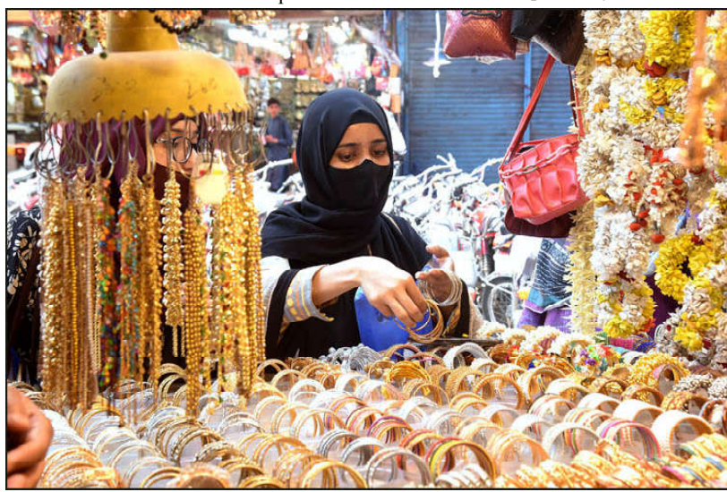
LAHORE: Women selecting Artificial jewelry in connection with preparations for Eid-ul-Fitr.

The price of per tola and ten gram silver remained constant at Rs 2,650 and Rs 2271.94 respectively.