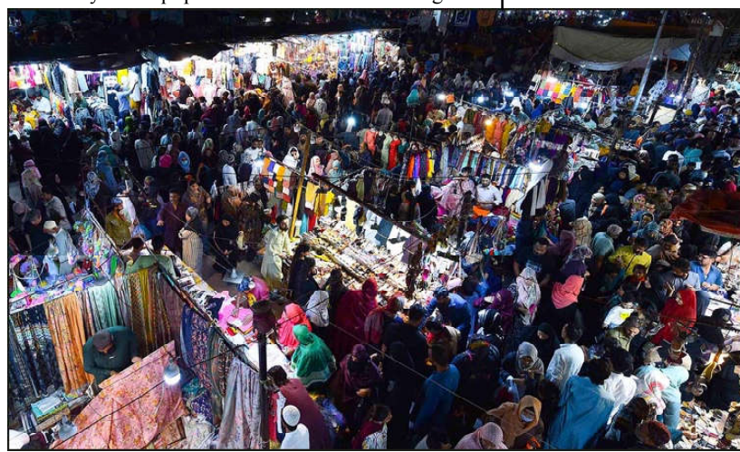
KARACHI: A view of rush on bazaar as Muslim festival of Eid-Al-Fitr approaching.

Wheat procurement targets would be announced daily at procurement centres, she maintained. The Deputy Commissioner Vehari Syed Asif Hussain Shah provided a detailed briefing to the Commissioner.