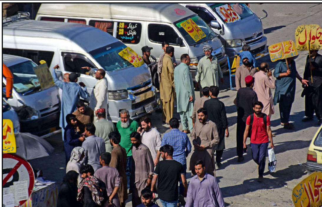
ISLAMABAD: People headed to their hometown dejectedly wait for public transport in the Federal Capital. Thousands are leaving to take advantage of a four-day holiday for Eid al-Fitr festival.