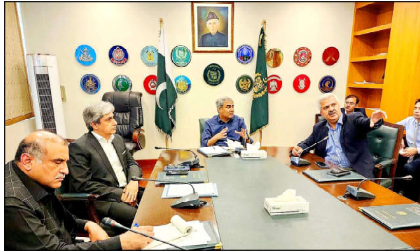
ISLAMABAD: Federal Minister for Interior Mohsin Naqvi chairing a meeting regarding security of foreign nationals.