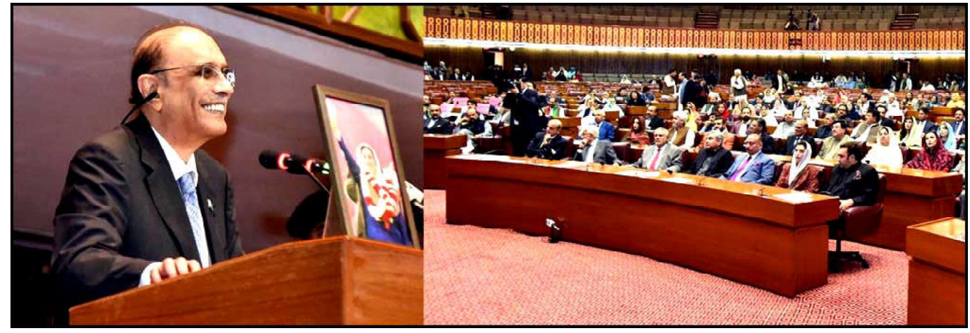
ISLAMABAD: President Asif Ali Zardari address to the joint session of parliament Speaker of National Assembly Ayaz Sadiq presideng the session in Parliament House

Vol. XIV No. 91 Reg. mails-B / ID-445 Friday April 19, 2024, Shawal 10, 1445 A.H. Ph: 2158688, 2158997 Pages 4: Rs. 12