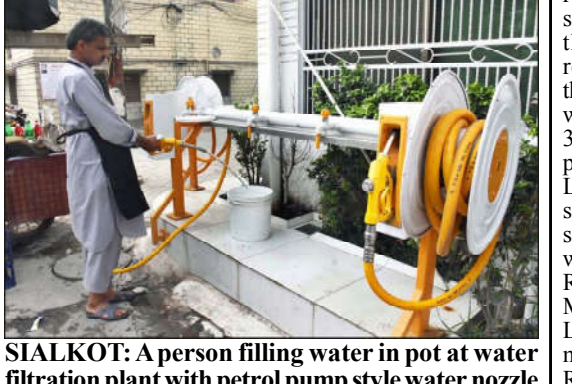
filtration plant with petrol pump style water nozzle at Mubarak Pura.

combined with Zong 4G's proficiency in network CGGC specializes in architecture, security.