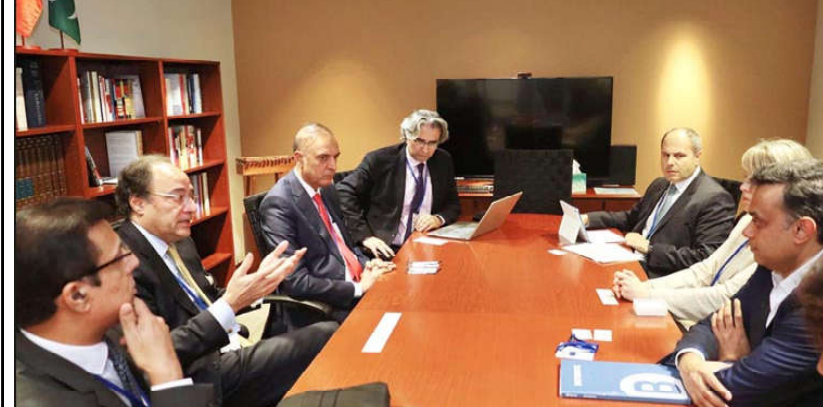
WASHINGTON: Federal Minister for Finance and Revenue, Muhammad Aurangzeb interacted with representatives of Deutsche Bank.

to minimize the government's circular debts. The prime minister directed to complete all the reforms' initiatives Ahmed and other within the stipulated concerned officials.